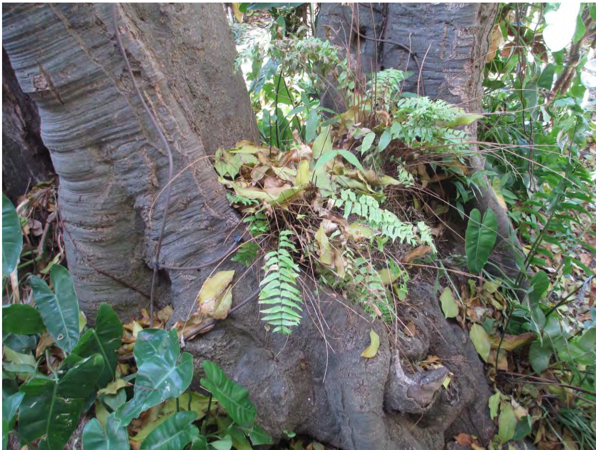
Base of tree, one stump with two trunks