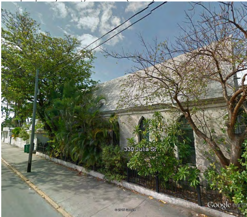
Looking down Whitehead St at property