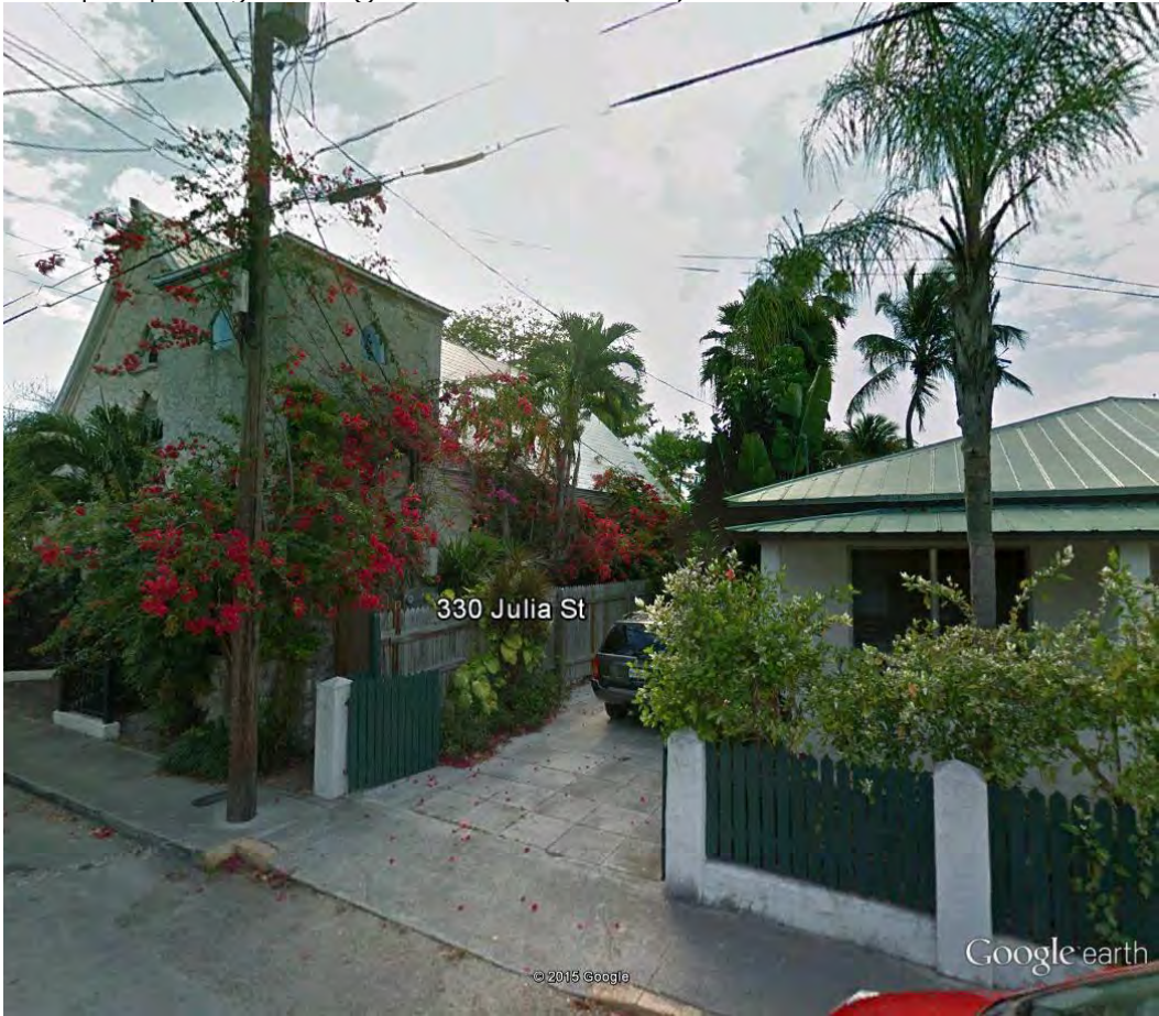
View looking down Julia toward