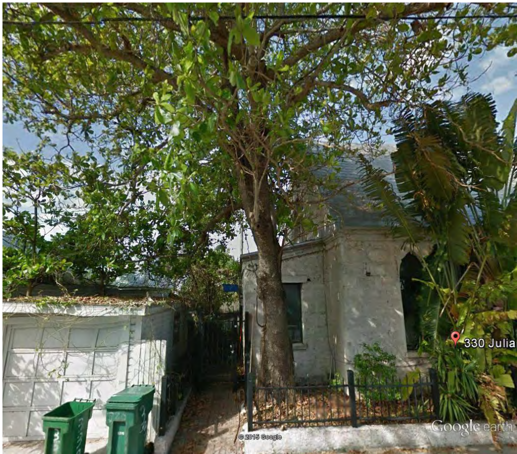
Rear of property on Whitehead St