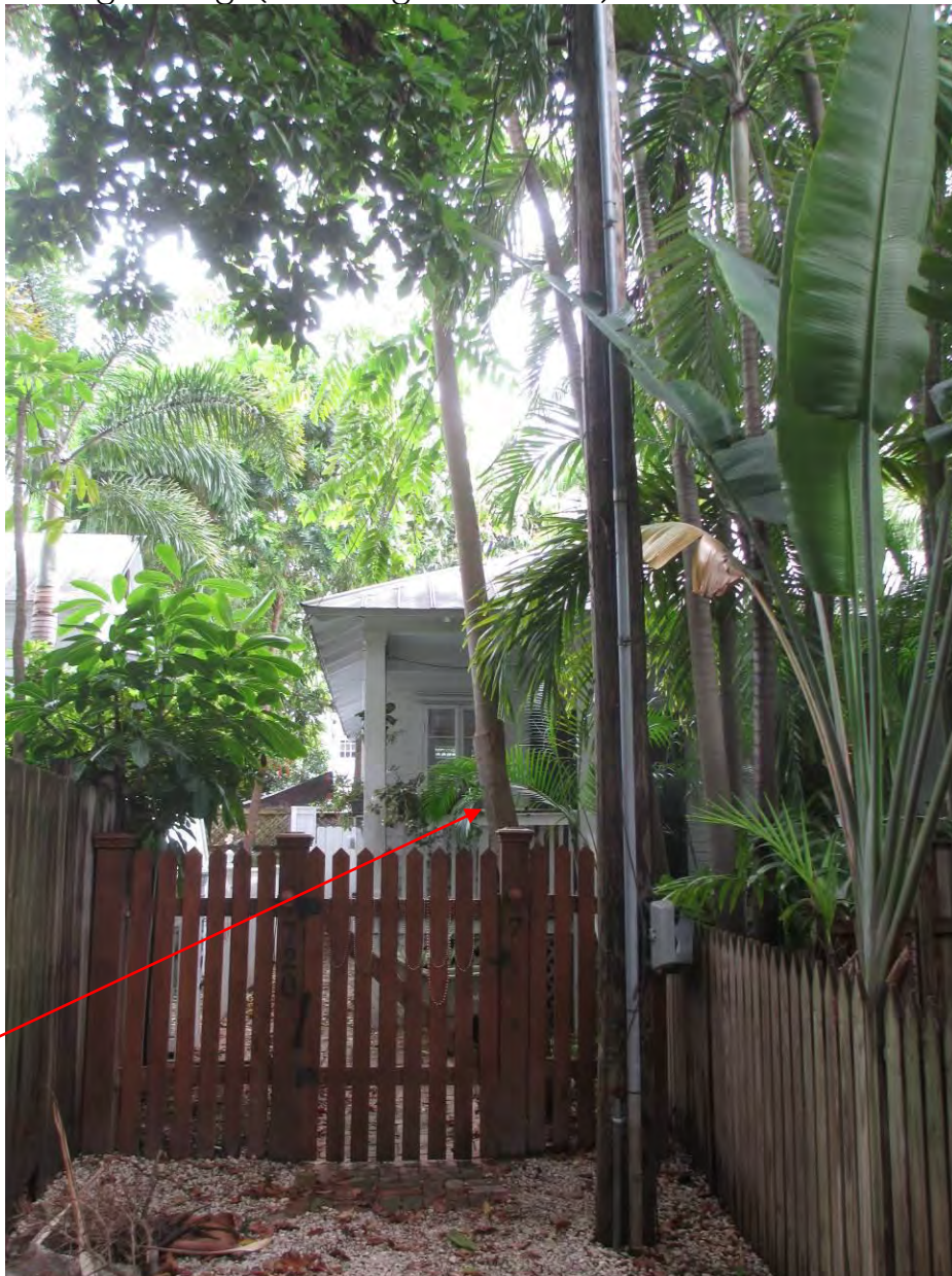
Ylang Ylang tree

Tree Species: Ylang Ylang ( Cananga odorata )