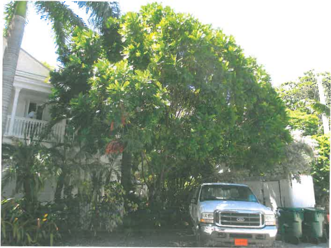
Above photo taken June 2015

Factual allegation: The canopy of one Silver Buttonwood tree was removed turning the tree into a hedge, without benefit of a major maintenance permit. A Japanese Fern tree greater than 4" diameter was removed without benefit of a tree removal permit.