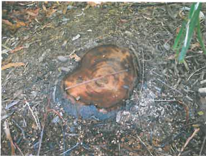
Photo of Japanese Fern tree stump taken July 2015