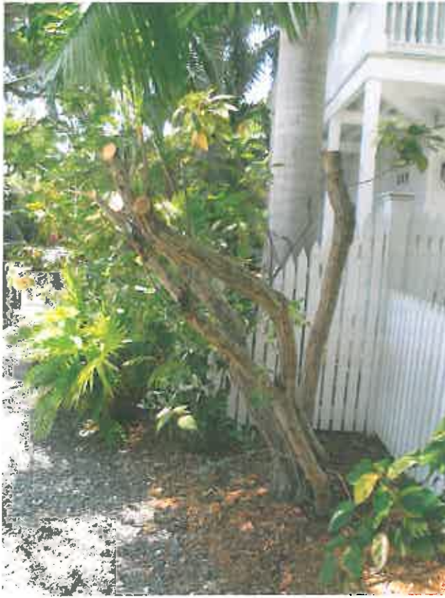
Photo of silver buttonwood tree taken July 2015

If the Tree Commission for the City of Key West finds that there has been a violation of the above code section, it will elect to enter into a compliance settlement agreement pursuant to section 110-291 of the Key West City Code or recommend a fine and further hearing before the Special Master of The City of Key West pursuant to section 110-294 of the Key West City Code.