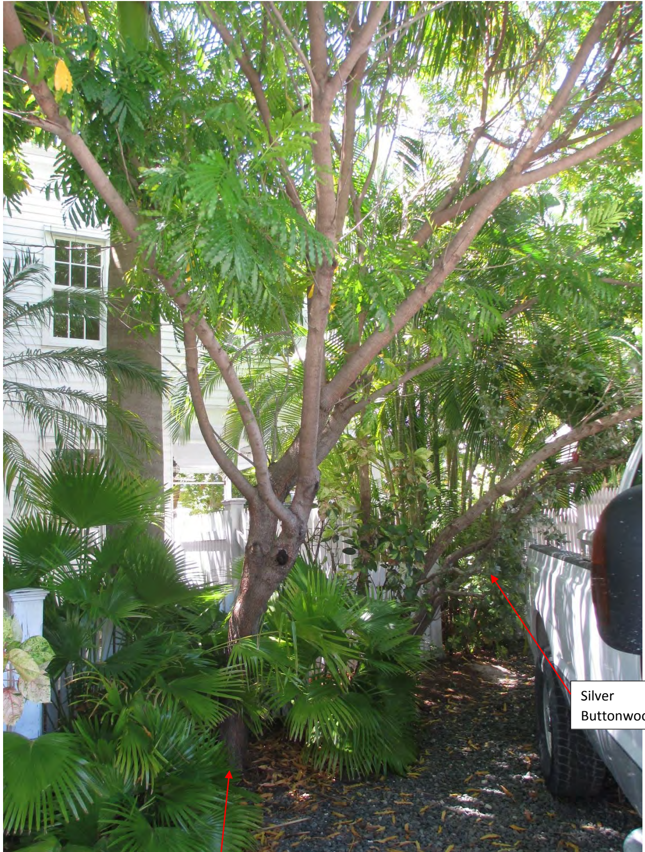
Japanese Fern tree