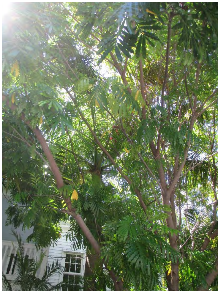
Canopy of Japanese Fern tree 6-19-15