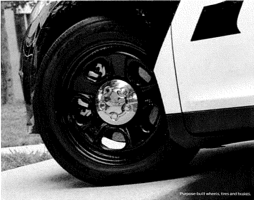
Purpose-built wheels, tires and brakes.