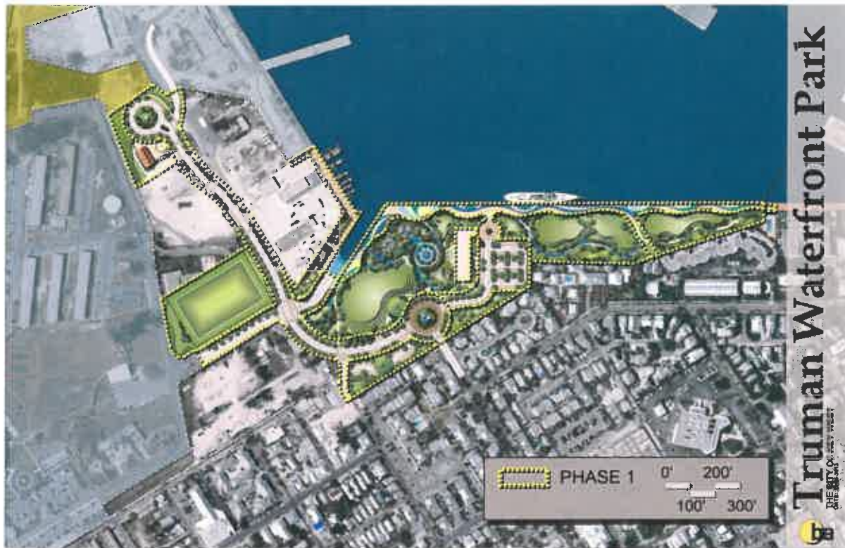
EXHIBIT A – PHASE 1 PROJECT LIMITS