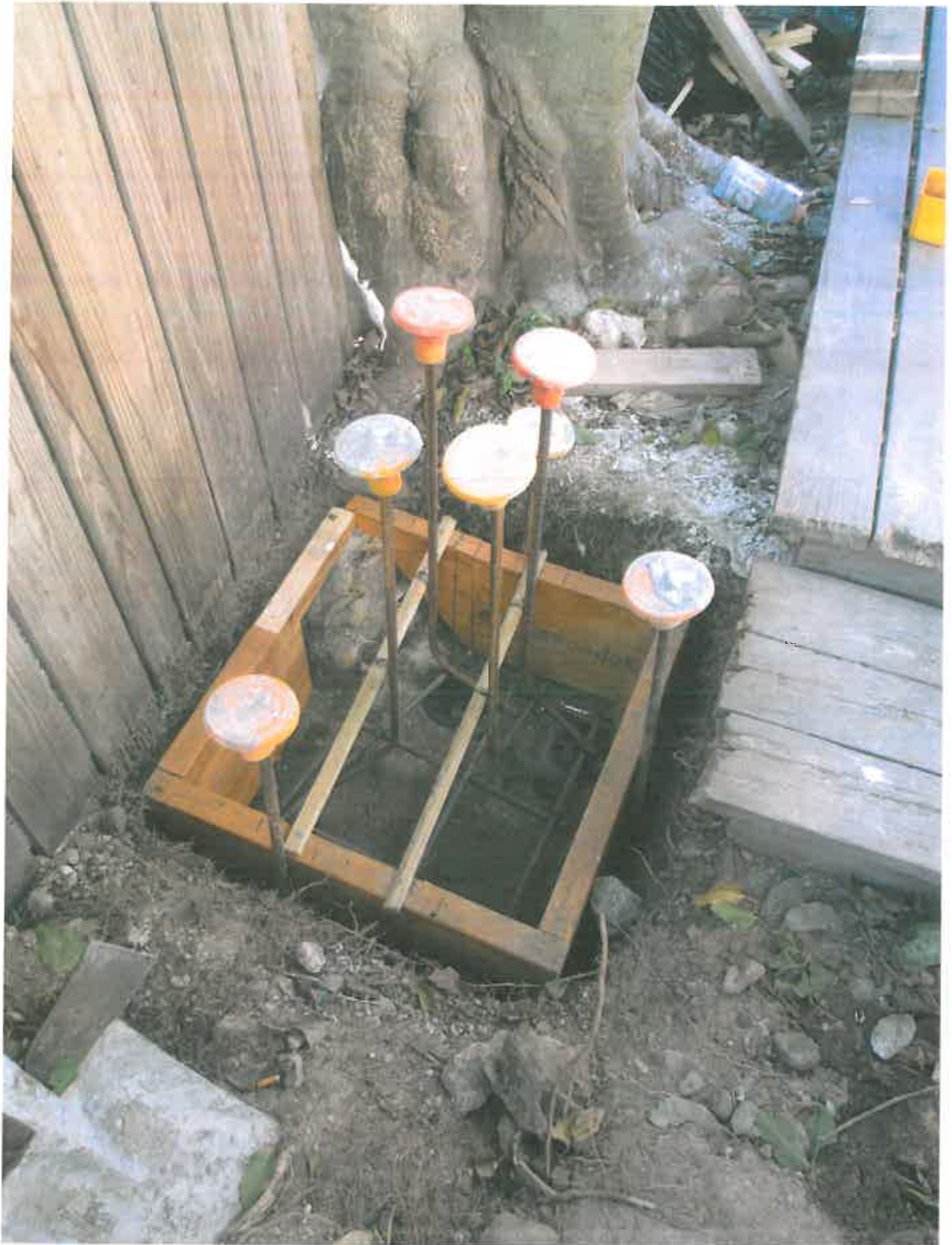
Key to the Caribbean – average yearly temperature 77 ° Fahrenheit.