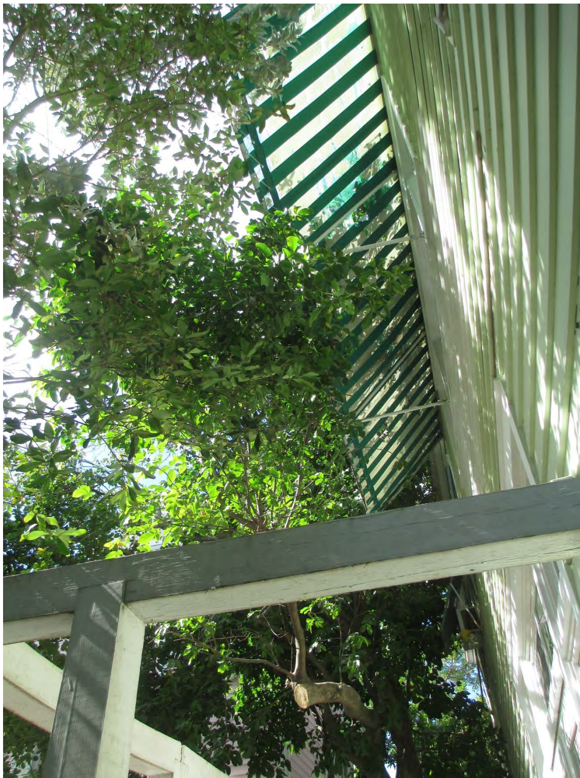
Canopy of the tree