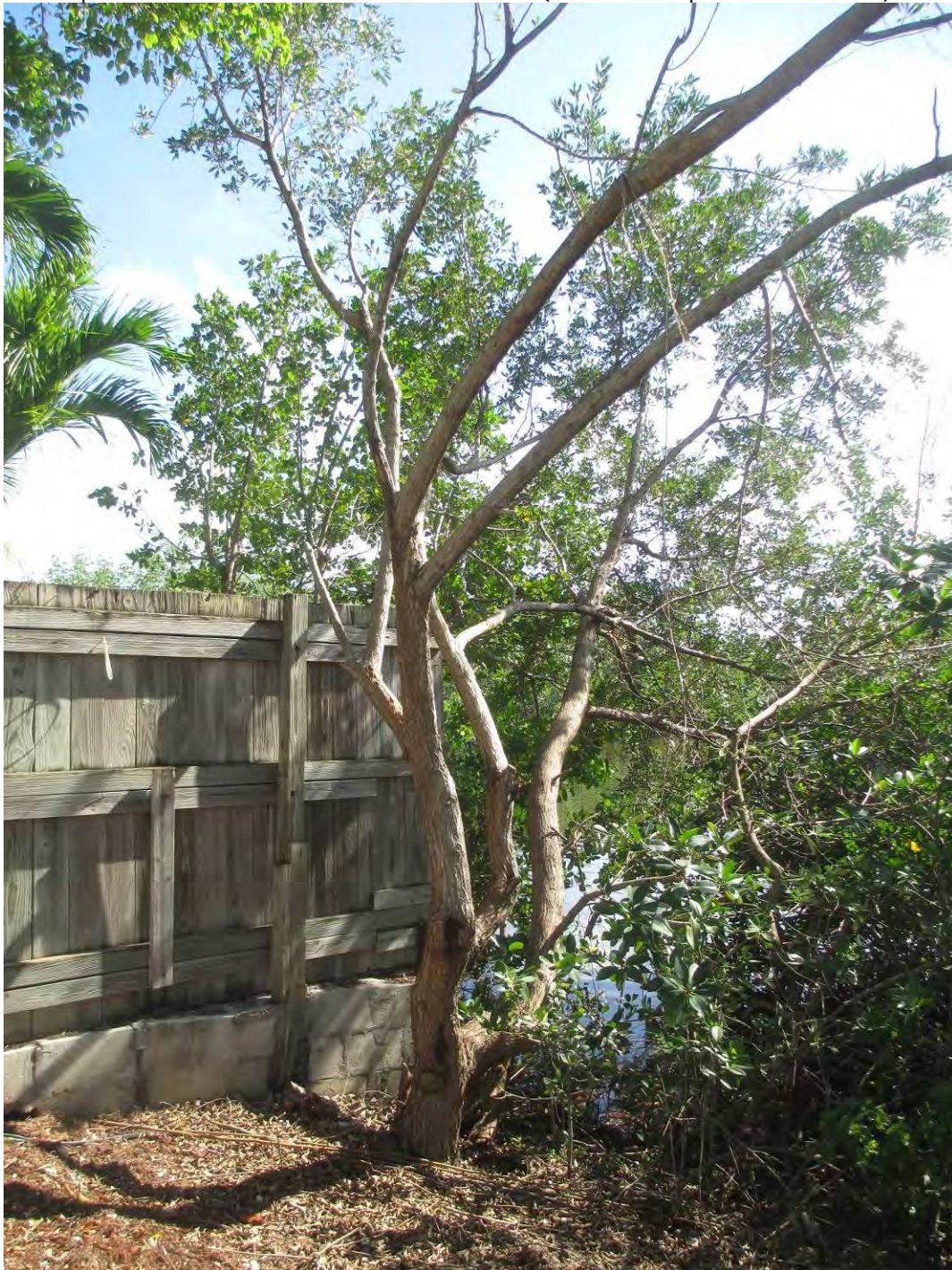
GB Tree #1

Tree Species: Green Buttonwood ( Conocarpus erectus )