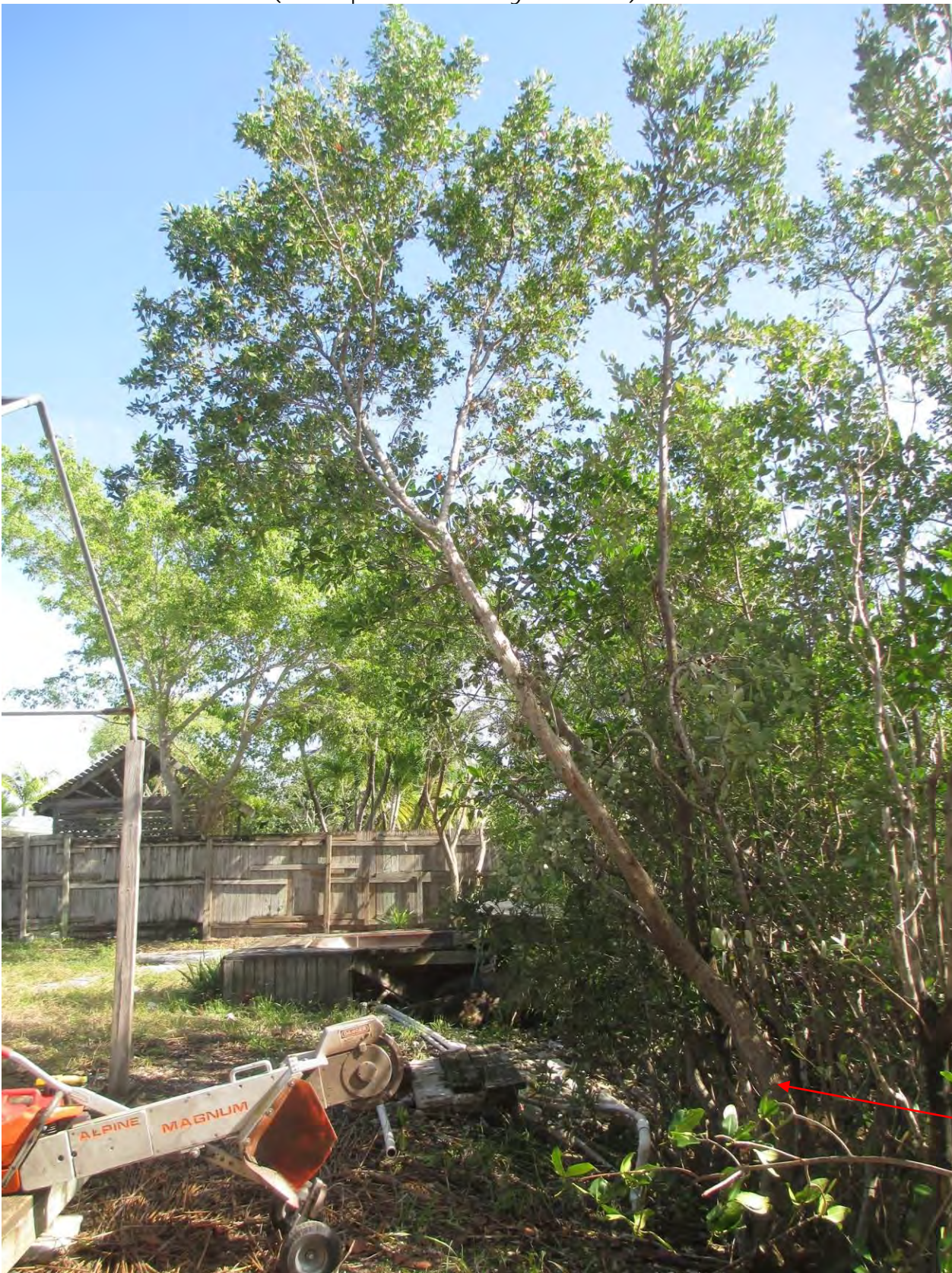
GB Tree #2 (clump with many trunks)