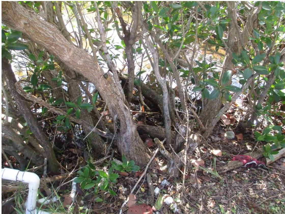
GB #2 Clump growing intermixed with black and red shoreline mangroves.