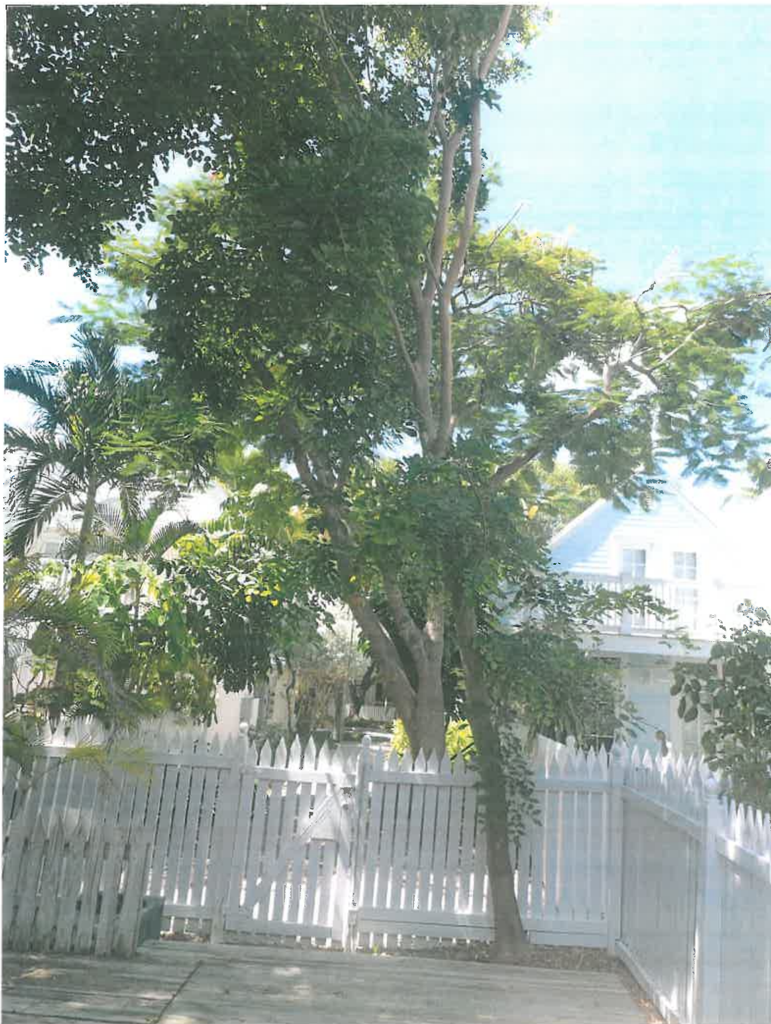
John & Cathy Pagels, 210-1 Southard Street, Key West, FL - Pongam tree removal photos