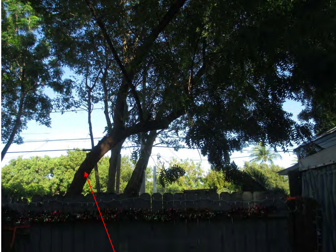
Looking at Canopy of Chinaberry tree #2 whole standing in 1438.