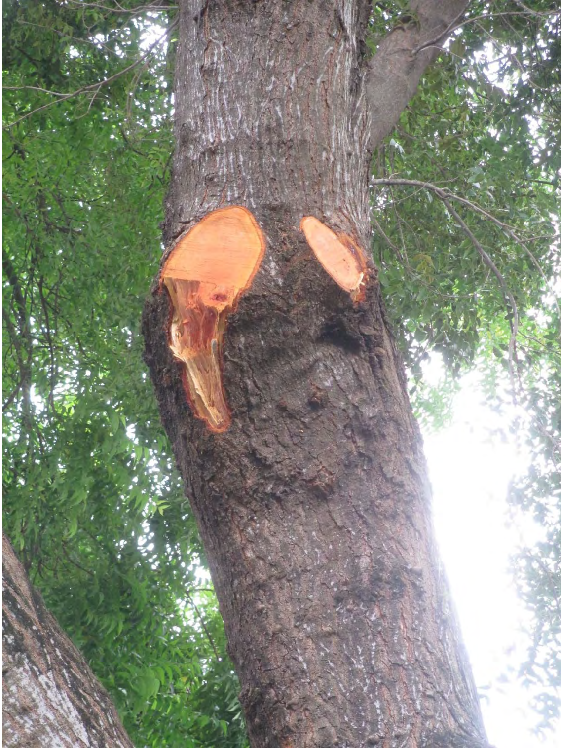
Large diameter branch improperly cut tearing the bark (tree abuse).