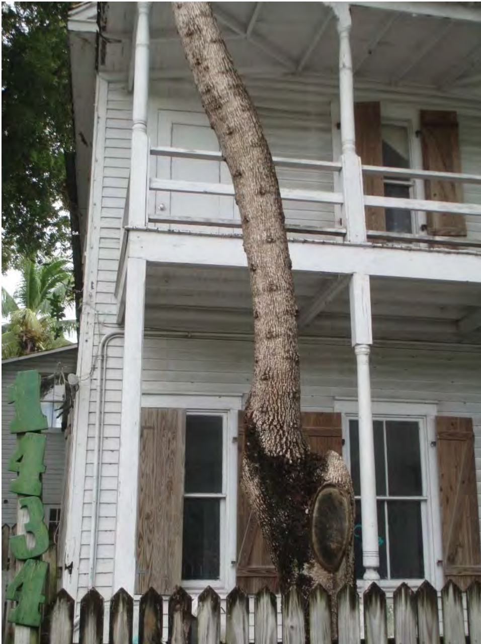
Chinaberry tree #1

On or about December 5, 2015, trees were trimmed on the property by the property owner, Tom Timblin. Several phone calls were received from the neighbors regarding the trimming work done to their trees (1438 Virginia Street). An inspection of the property on December 10 and 11, 2015 revealed that several regulated trees had been improperly trimmed, that permits would have been required for some of trimming, and that no permits had been issued.