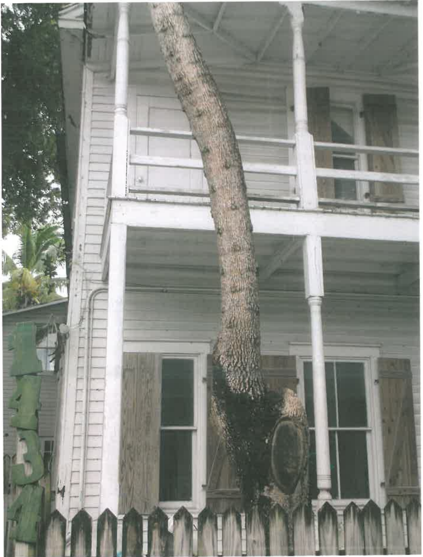
Key to the Caribbean – average yearly temperature 77 ° Fahrenheit.