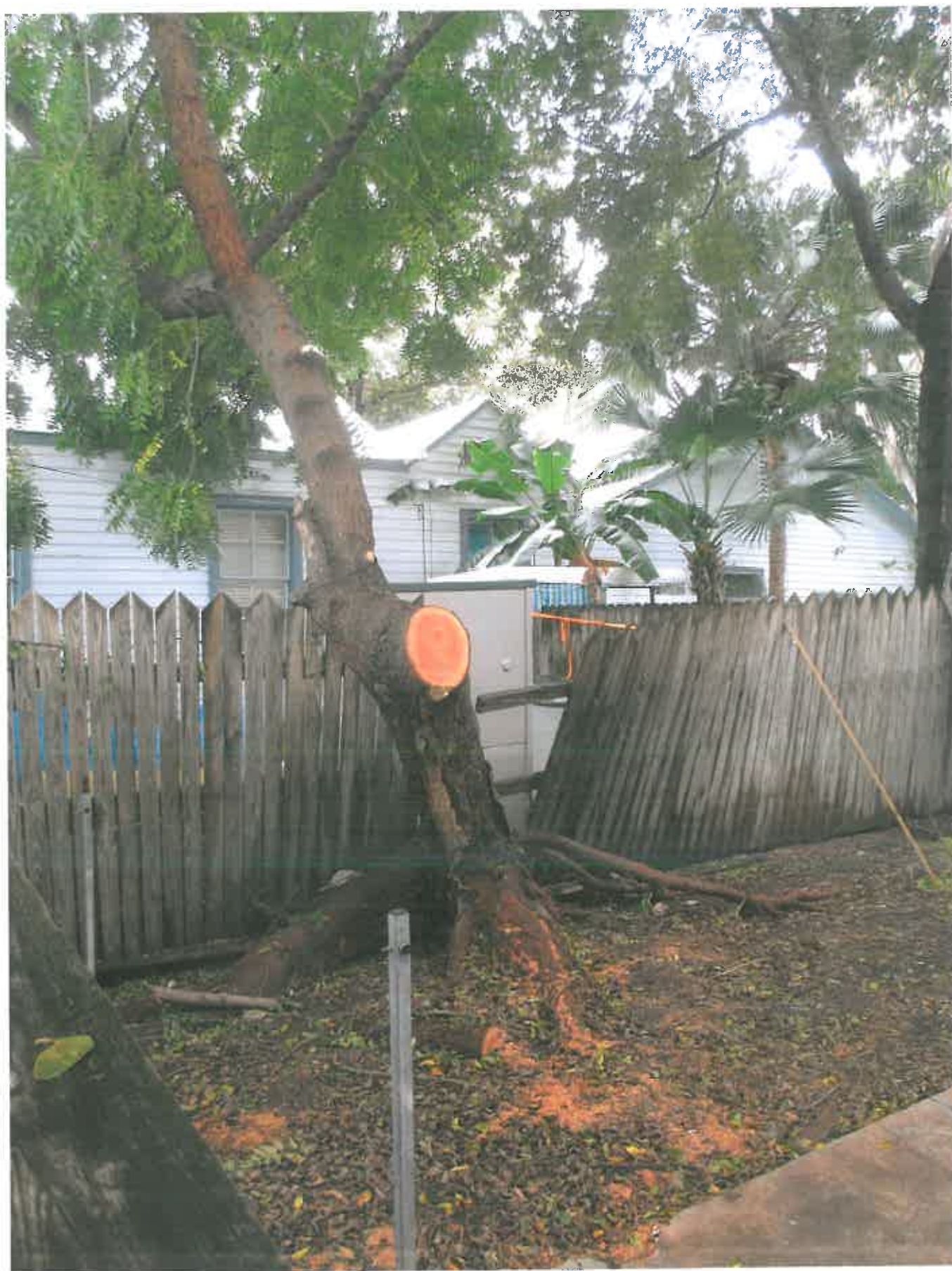
Key to the Caribbean – average yearly temperature 77 ° Fahrenheit.