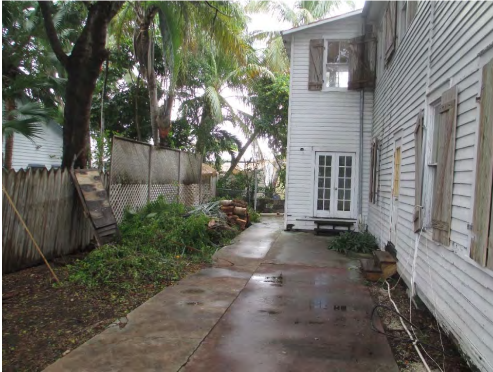
Looking down the driveway at the vegetative debris pile. Note that a dead coconut palm was also removed (no permit required).