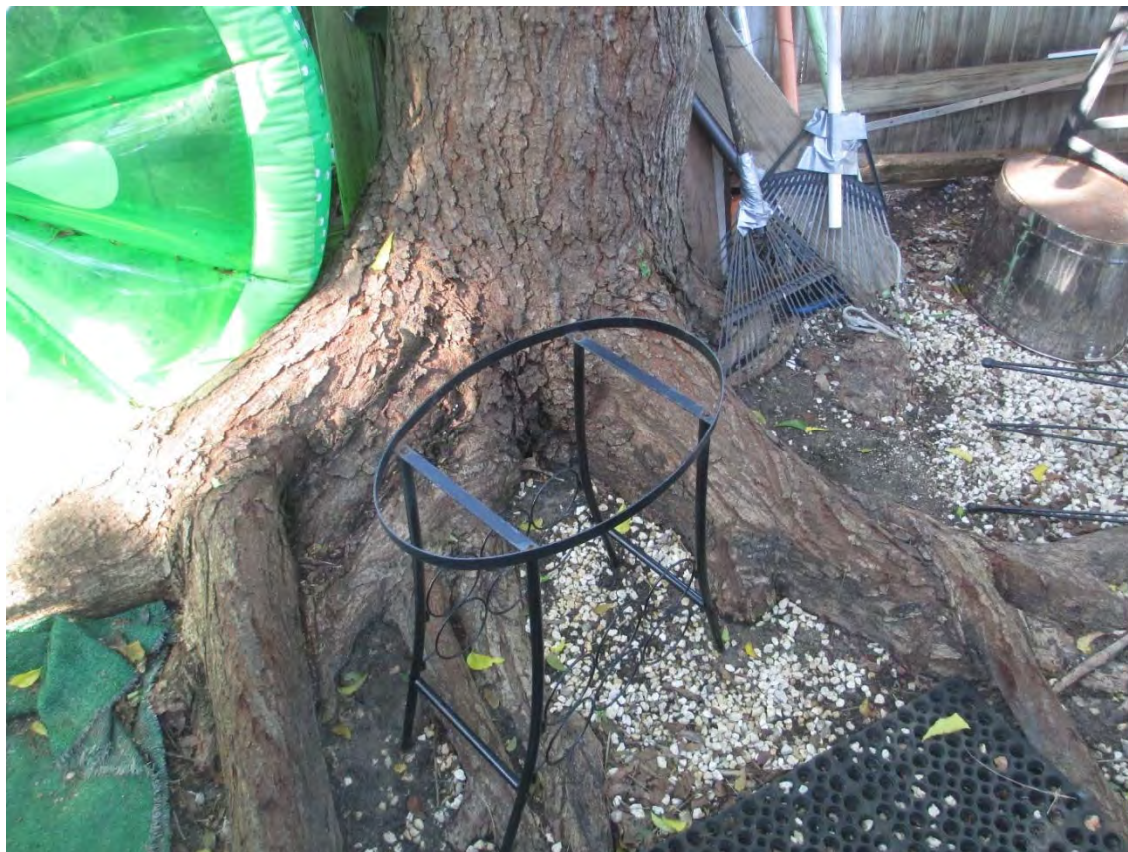
Base of mahogany tree on 1438