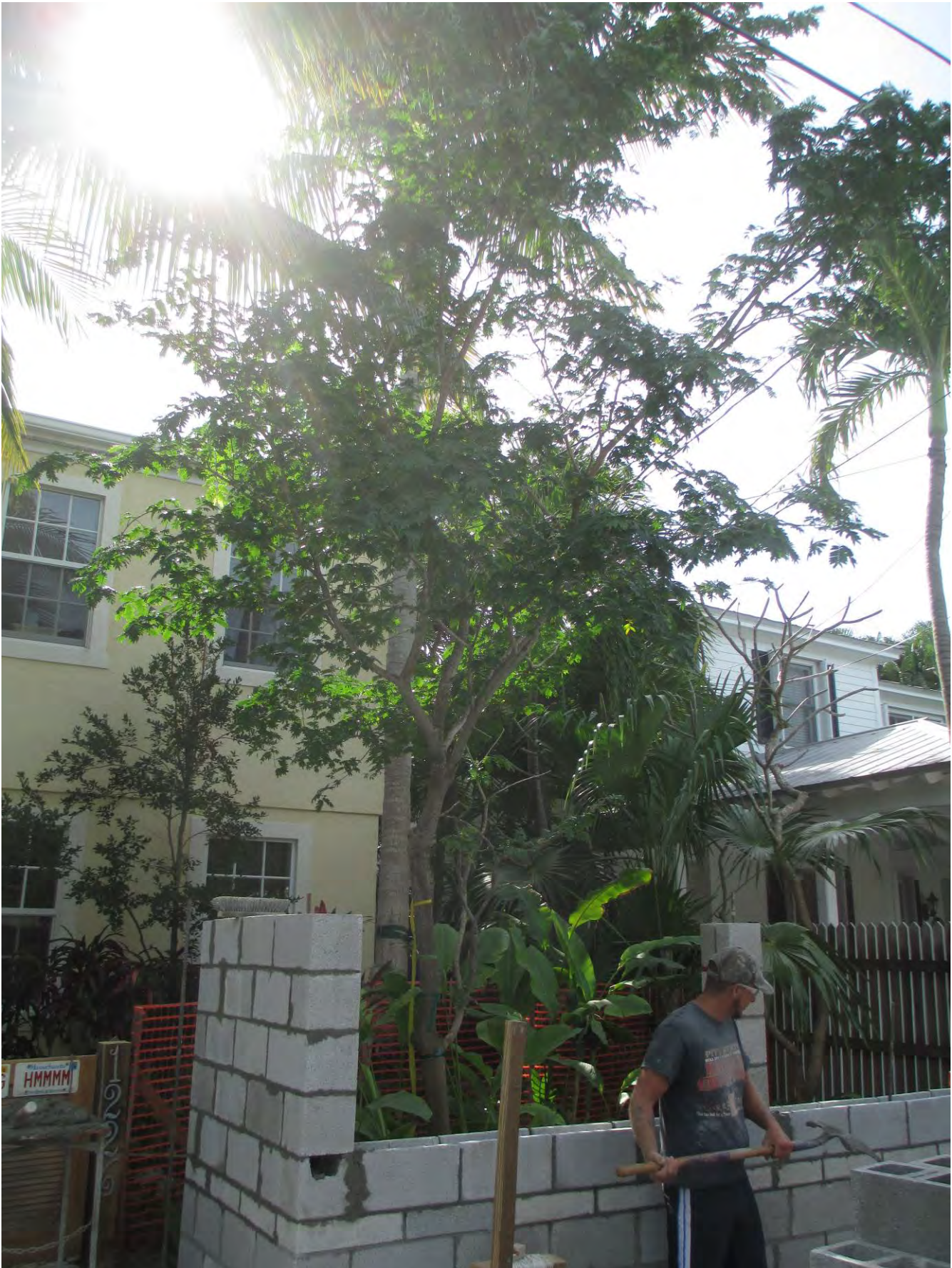
Tree Species: Bulnesia (Bulnesia arborea)