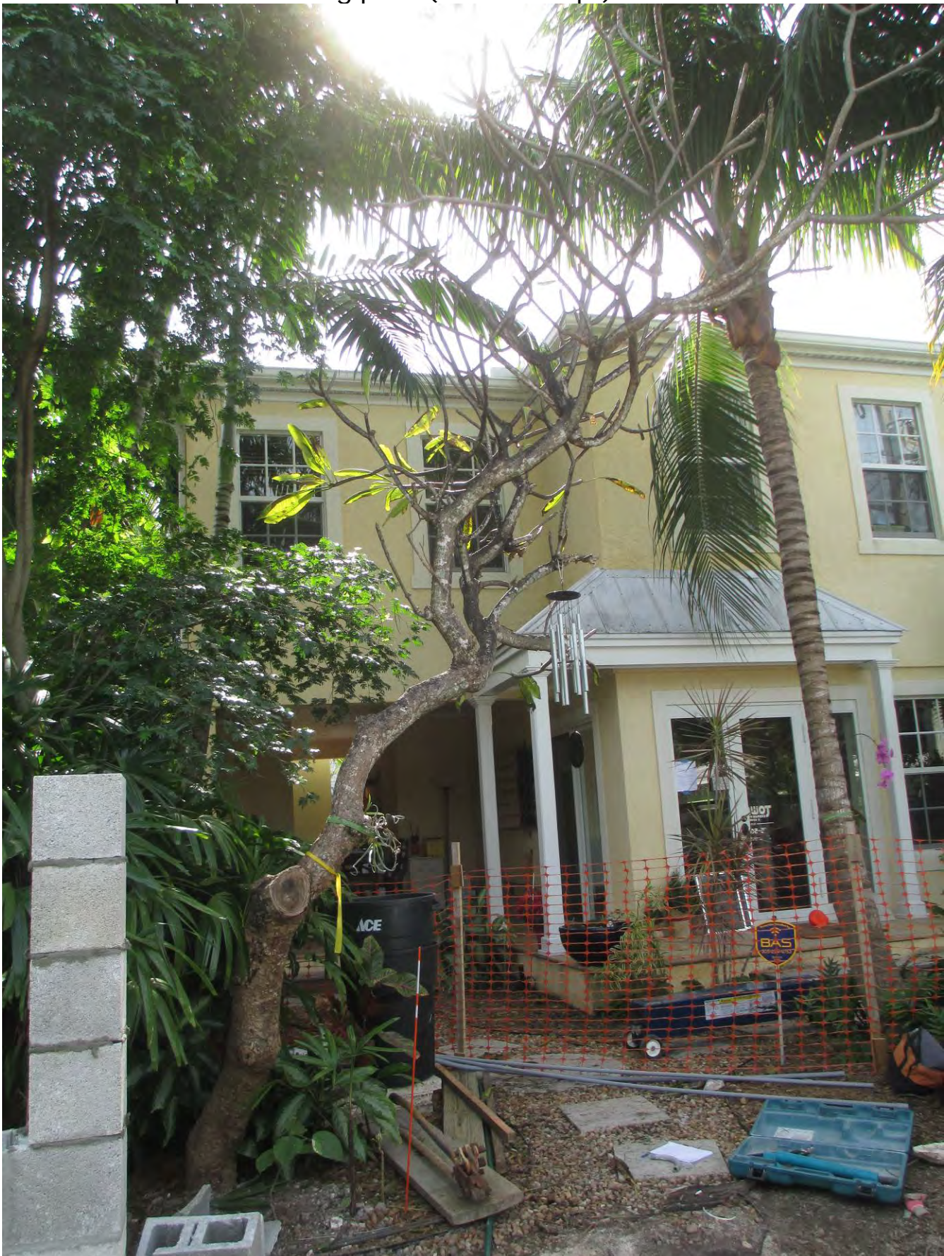
Tree Species: Frangipani (Plumeria sp.)