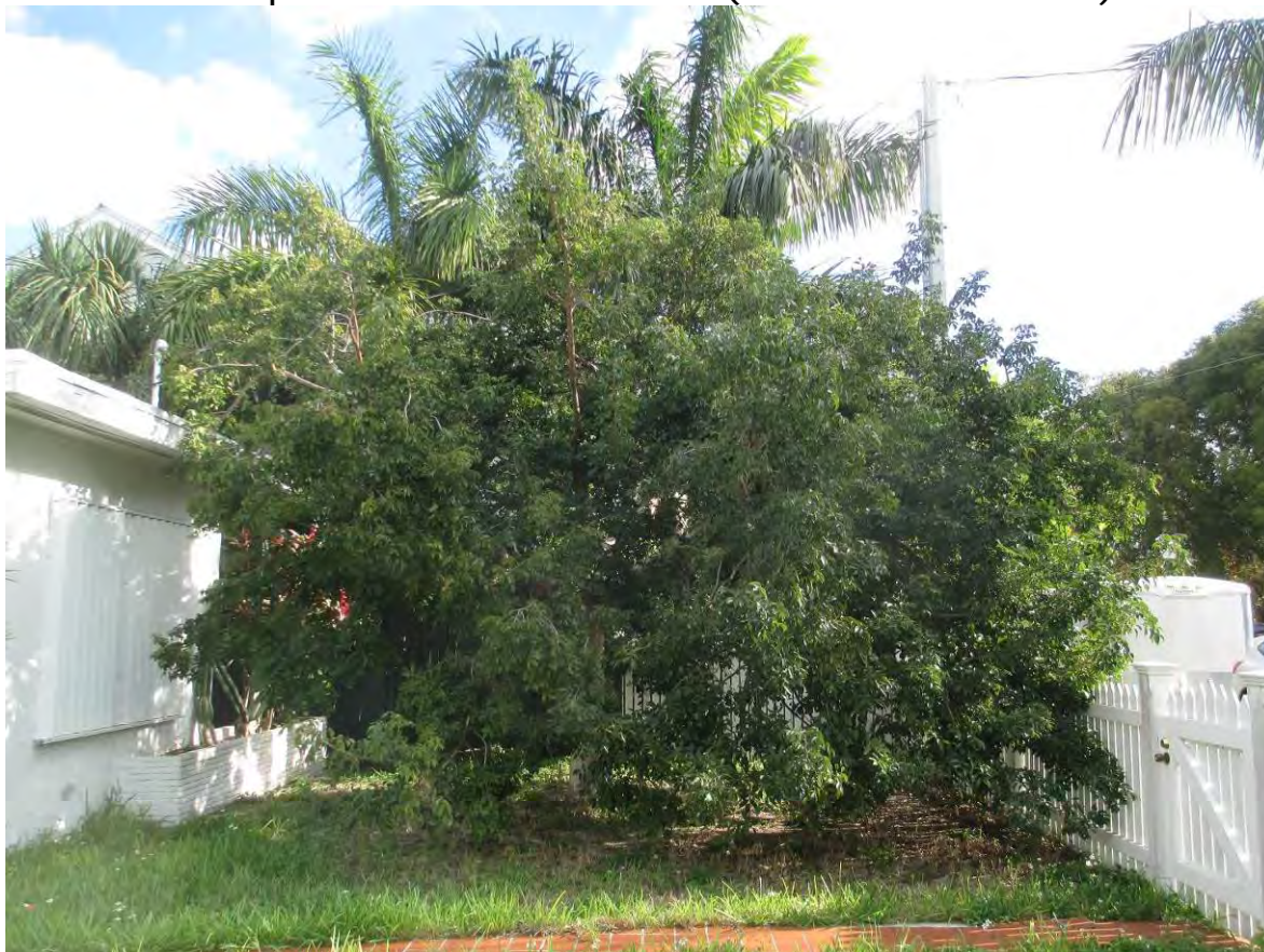
Tree Species: Gumbo Limbo ( Bursera simaruba )