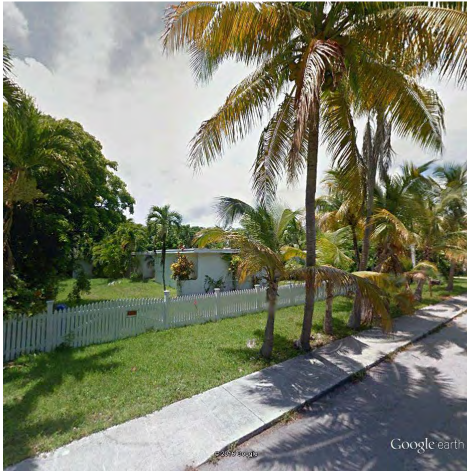
June 2015—Coconut palms are on city right of way. Area between sidewalk and white fence is city right of way.