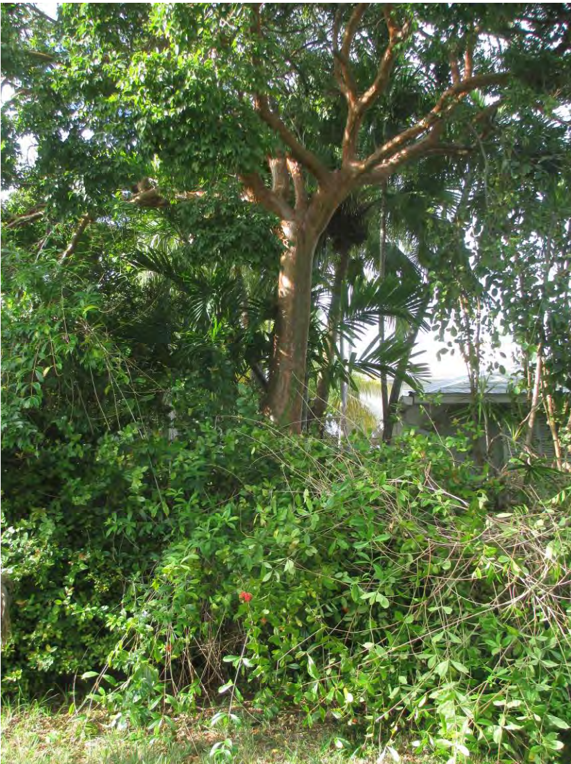
Gumbo Limbo tree next to property line to remain.