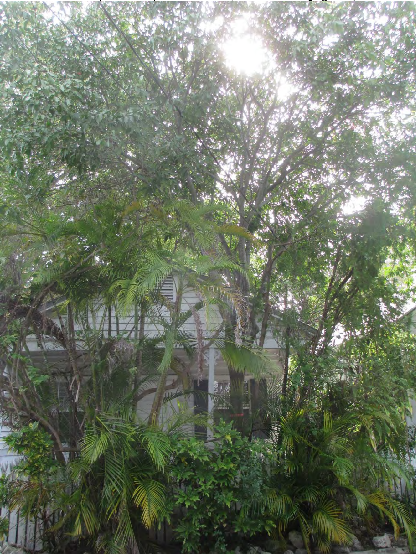
Tree Species: Spanish Lime ( Melicoccus bijugatus )