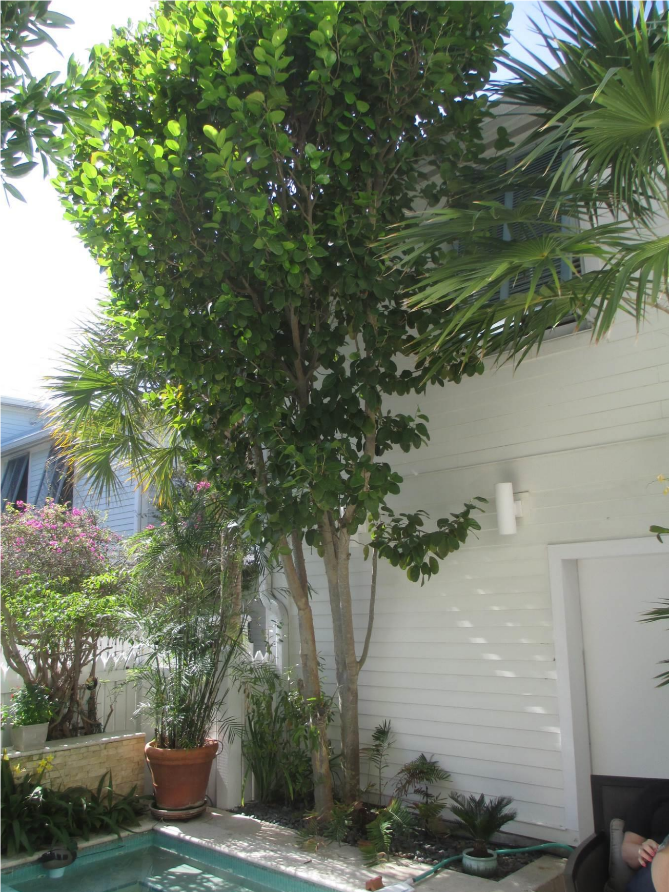
Tree Species: Pigeon Plum ( Coccoloba uvifera )