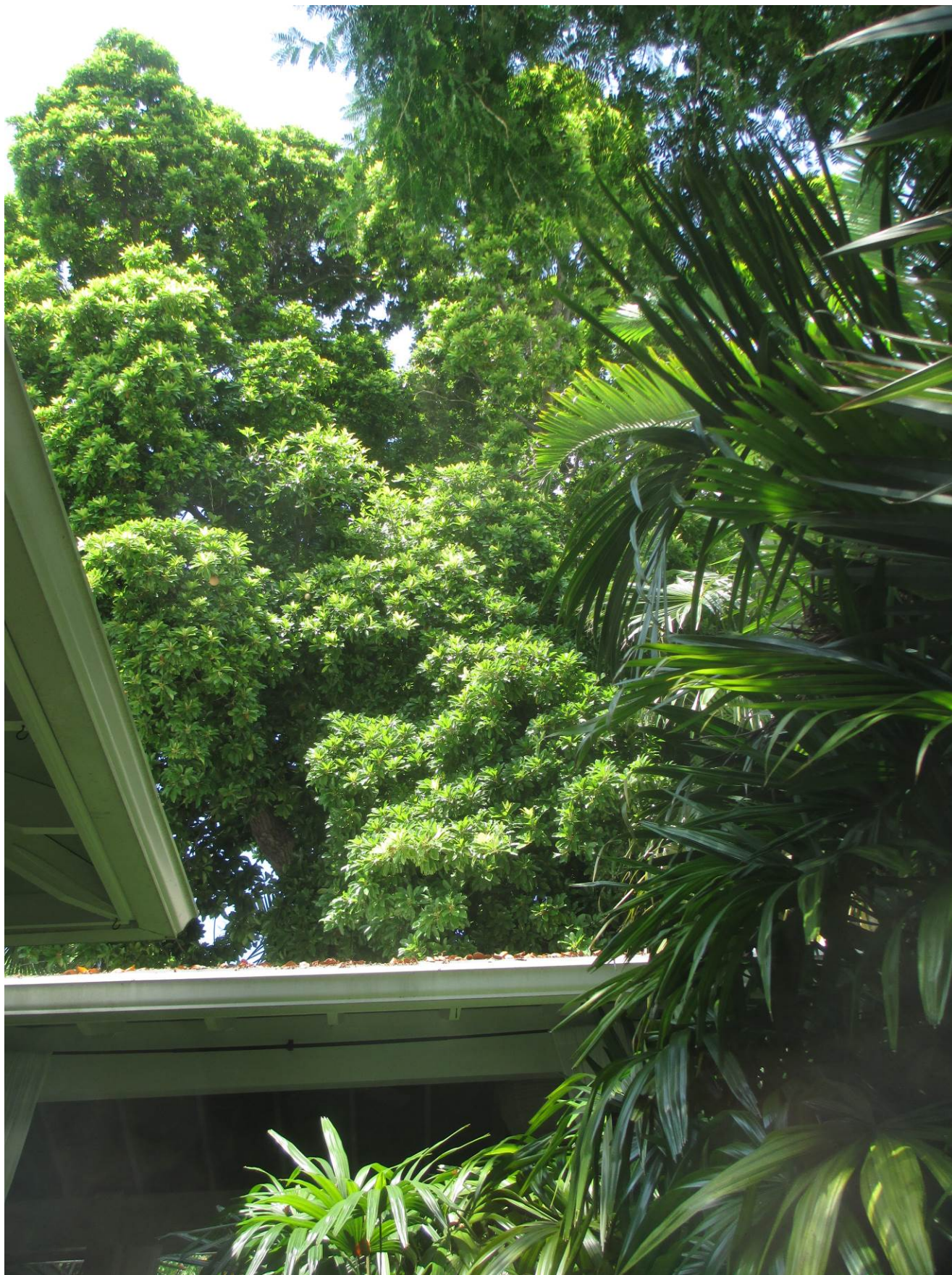
Tree Species: Sapodilla (Manilkara zapote)