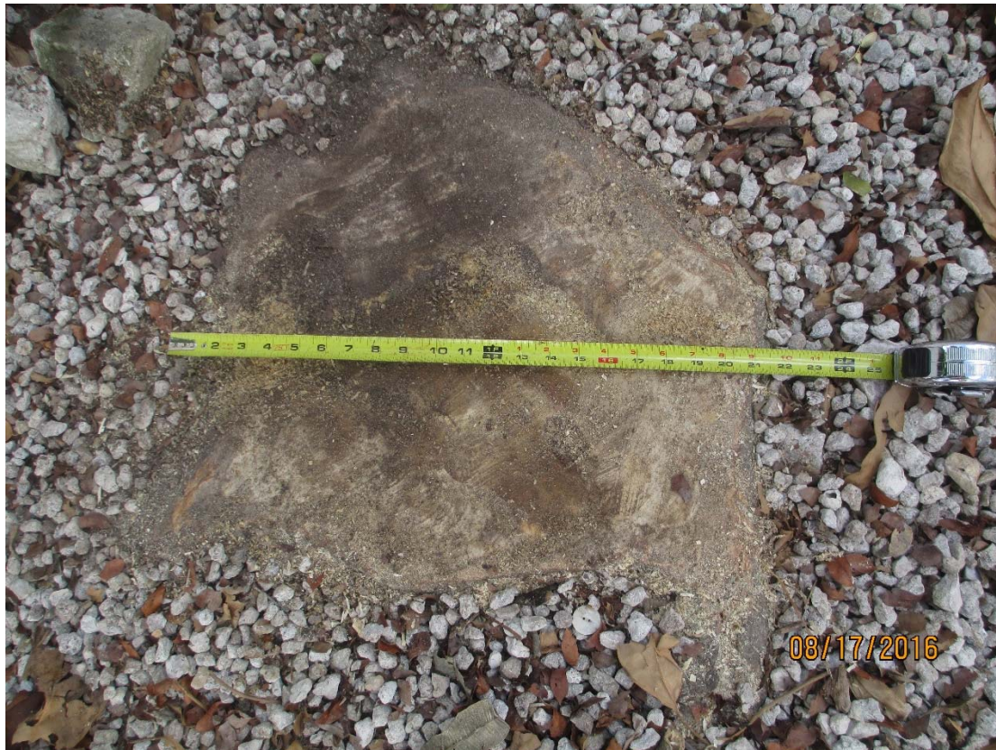
Width of tree trunk measured at 21" and 20" (not a diameter measurement)