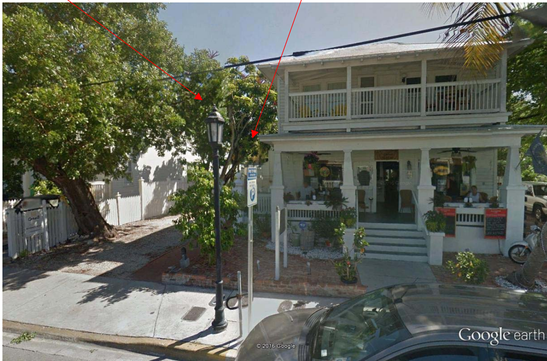
White Frangipani tree (removed)