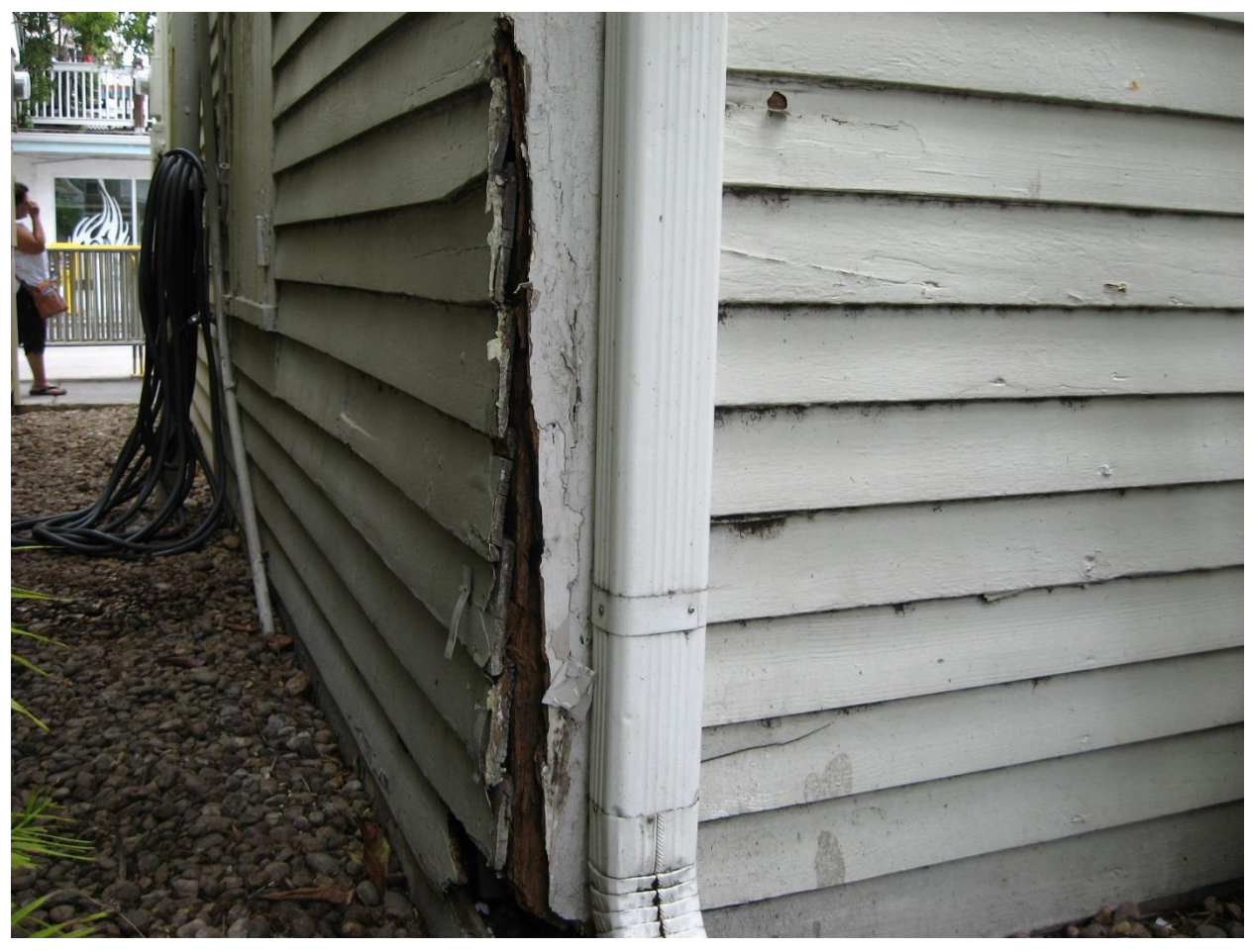
Corner post bad, siding bad and rim plate bad. Need engineering drawing for repairs