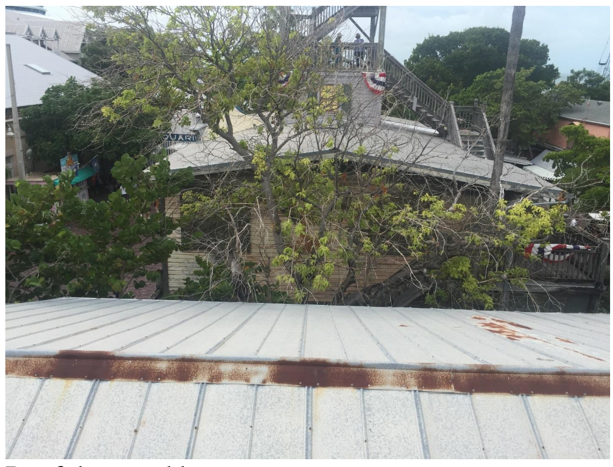
Roof damaged by trees