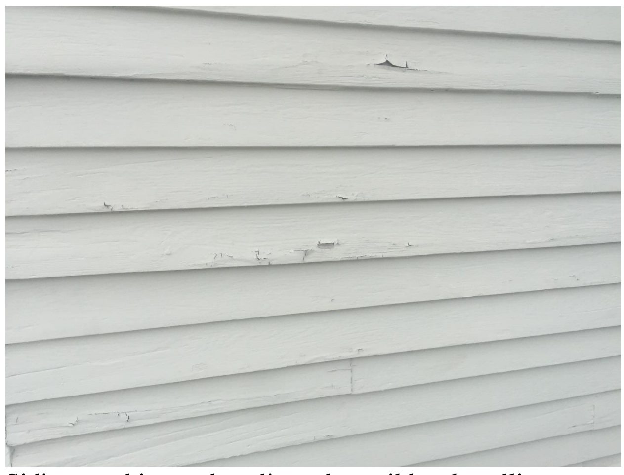
Siding cracking and peeling, also nail heads pulling out.