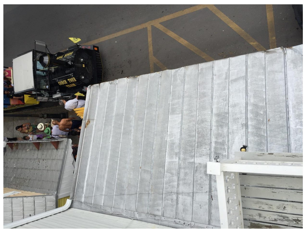
Lower roof damaged by trucks