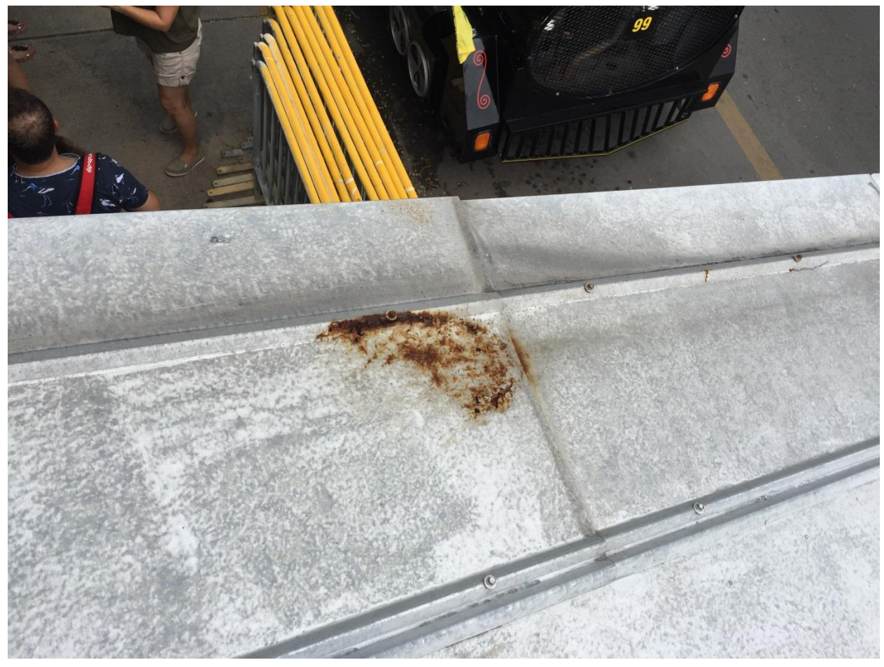
Roof rusting and roof gutter draining on lower roof