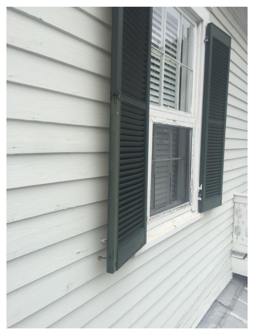
Shutter coming apart