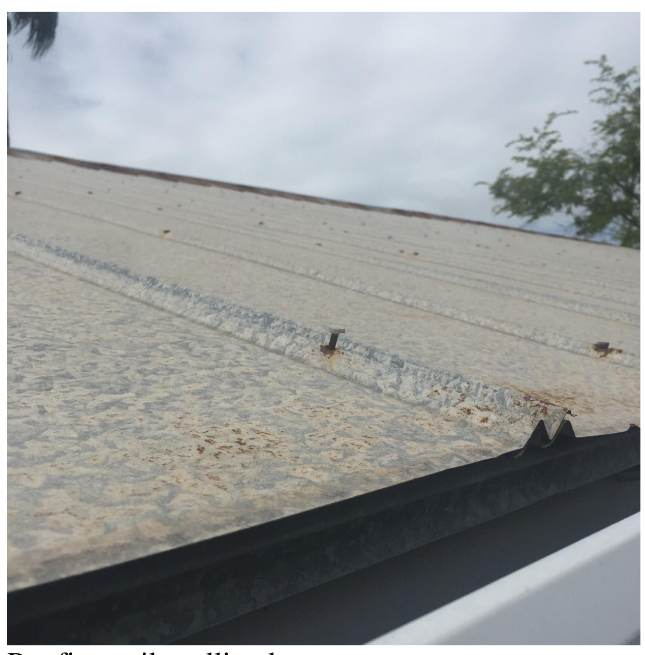
Roofing nails pulling loose