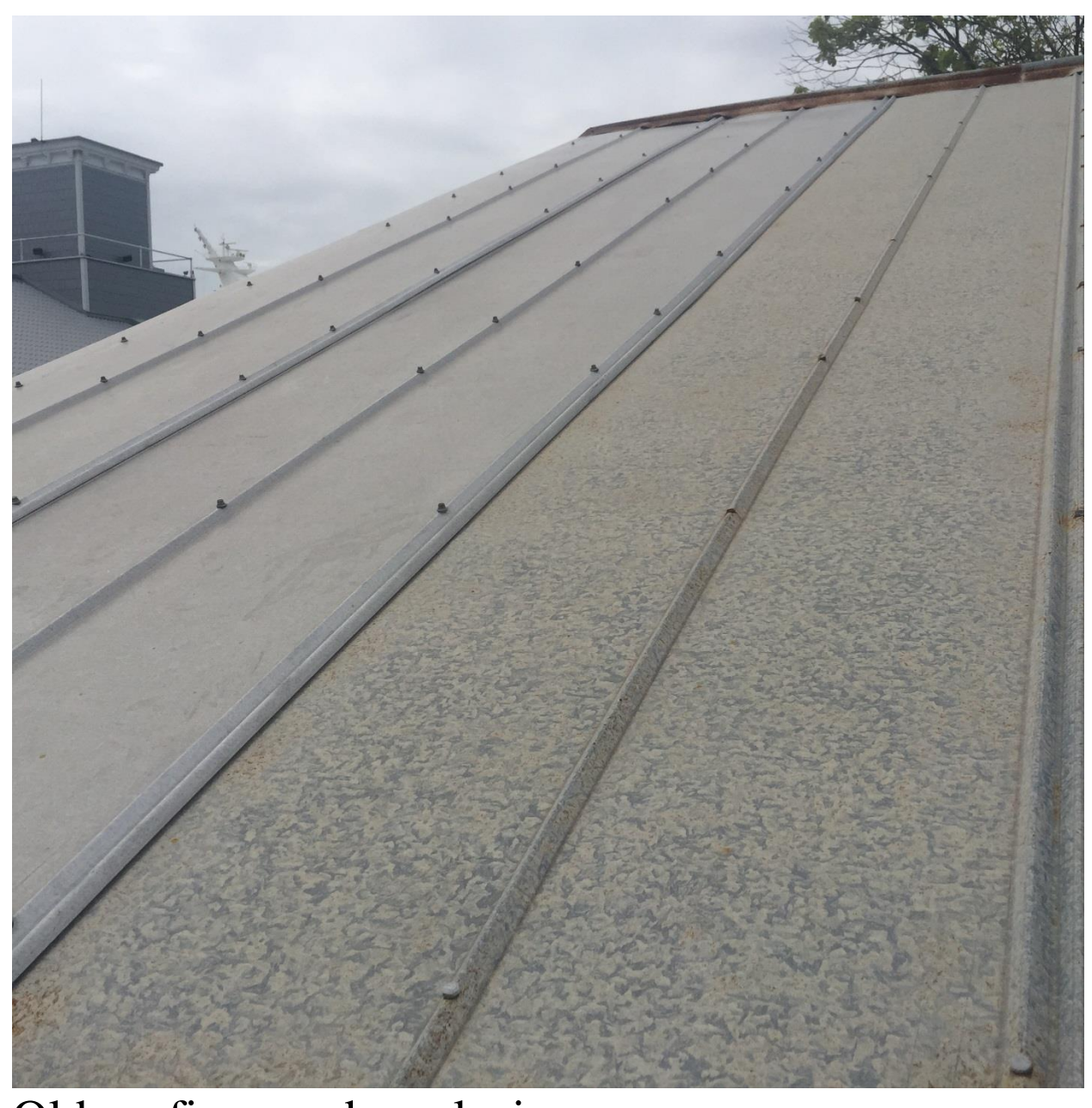
Old roofing needs replacing