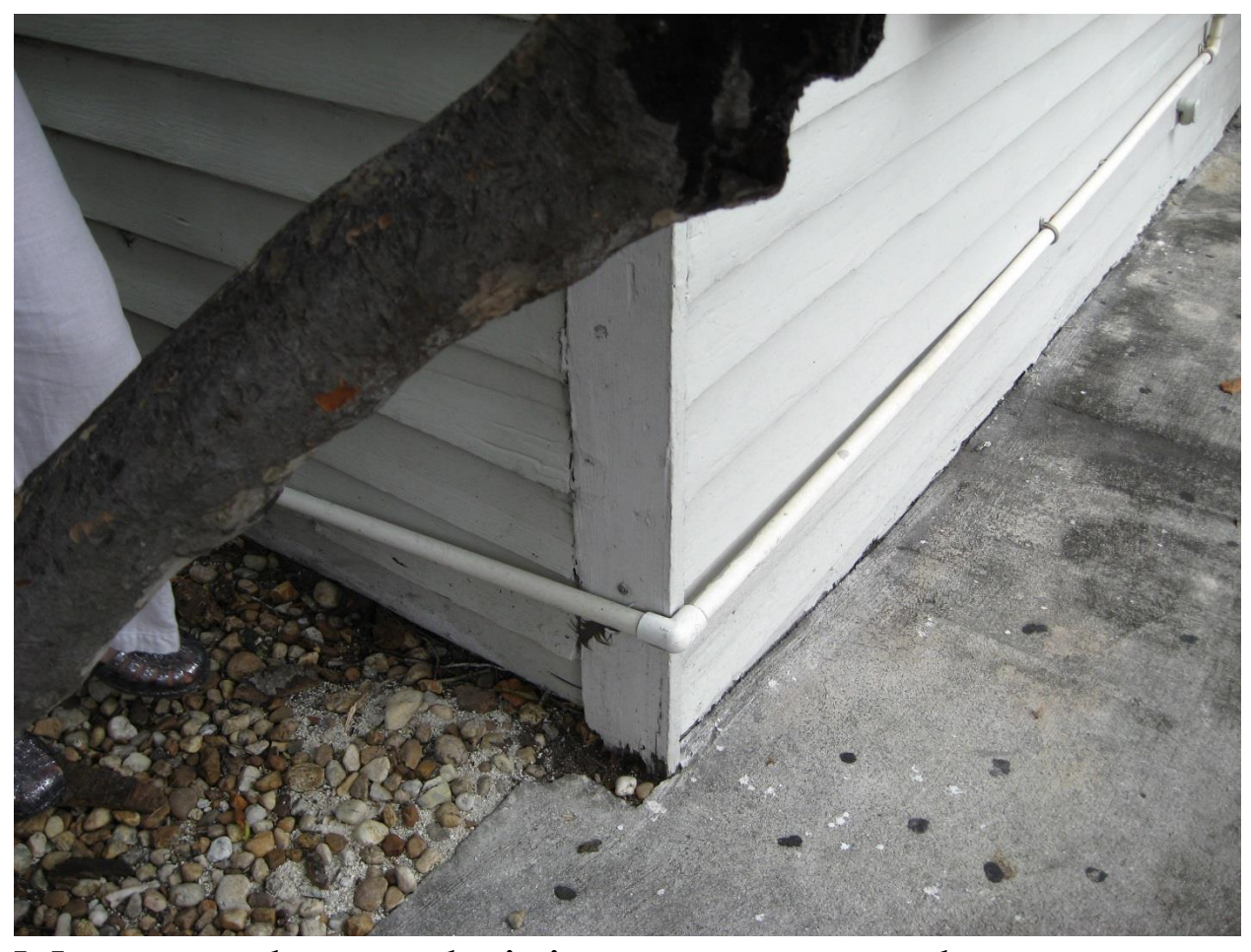
More wood rot and piping not supported