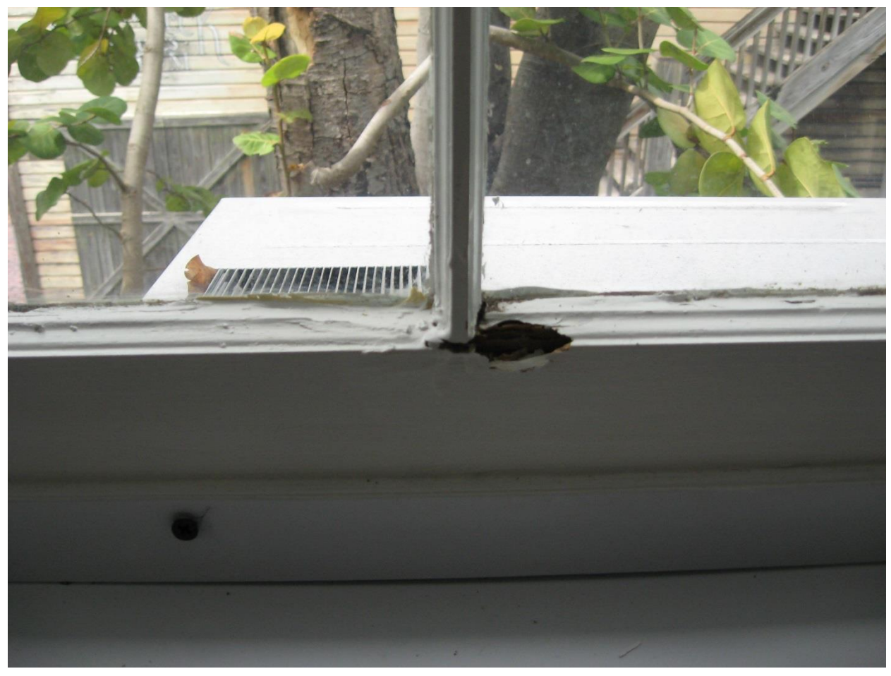
Window glazing bad and wood issues