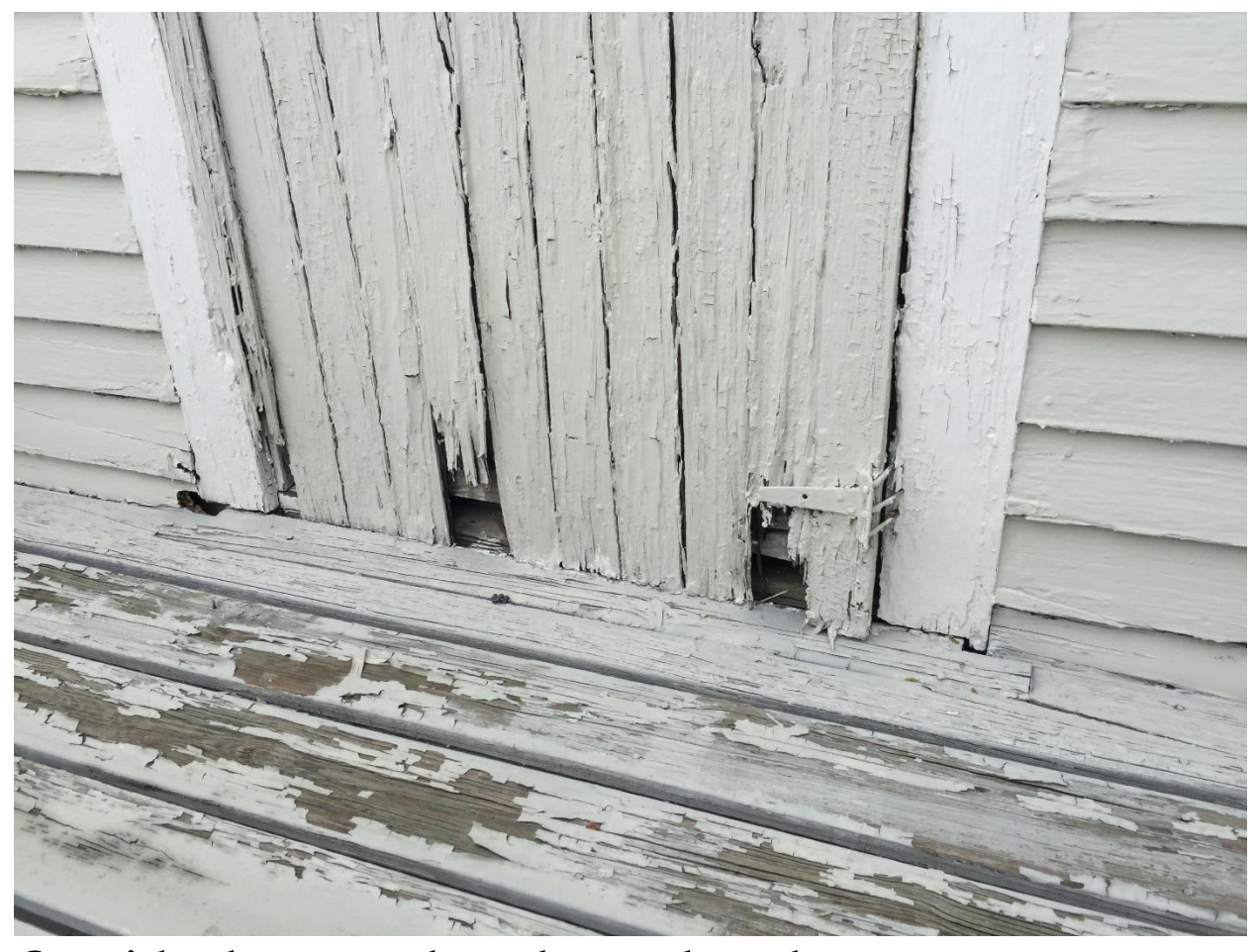
Outside door needs to be replaced