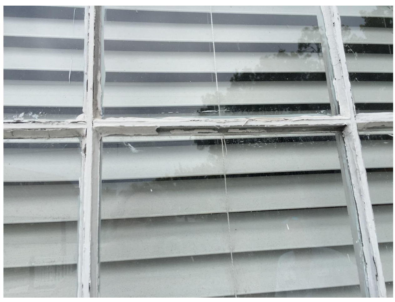
Outside window glazing bad