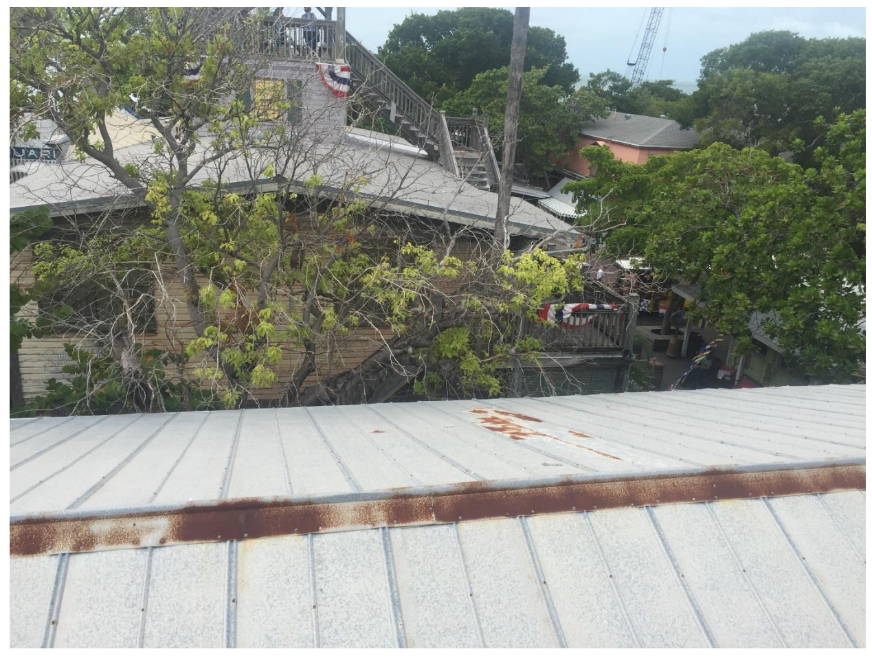
Roof rusting and should be replaced or coated to extend roof life