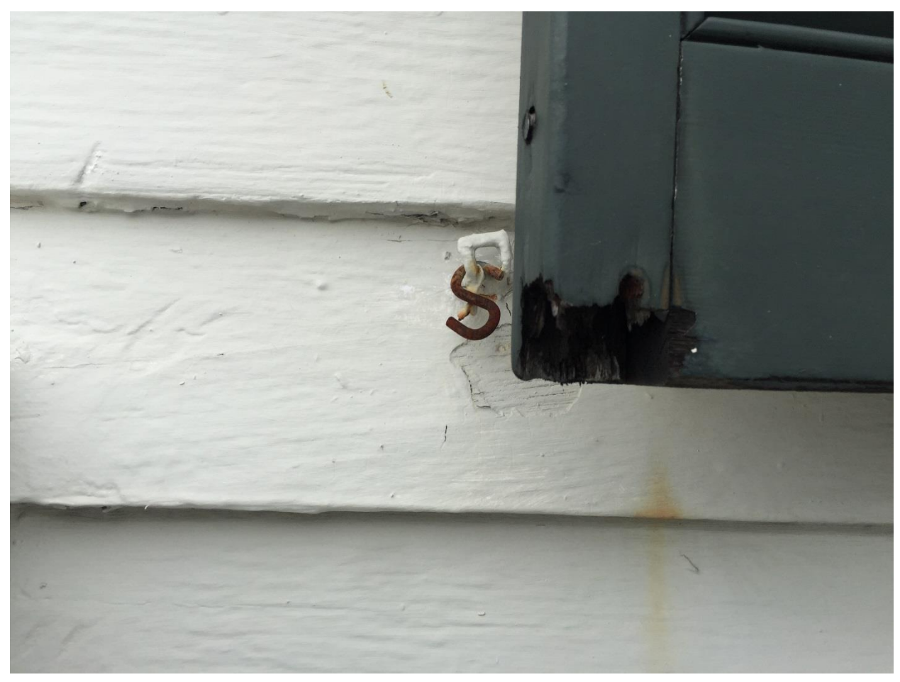
Shutter needs replacing