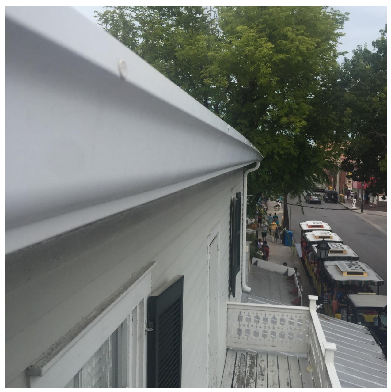
Gutter has sags and the run is holding water