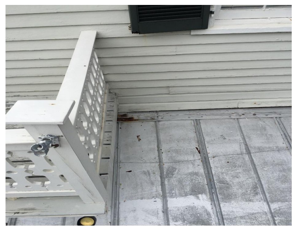
Flashing rusting. Needs repair