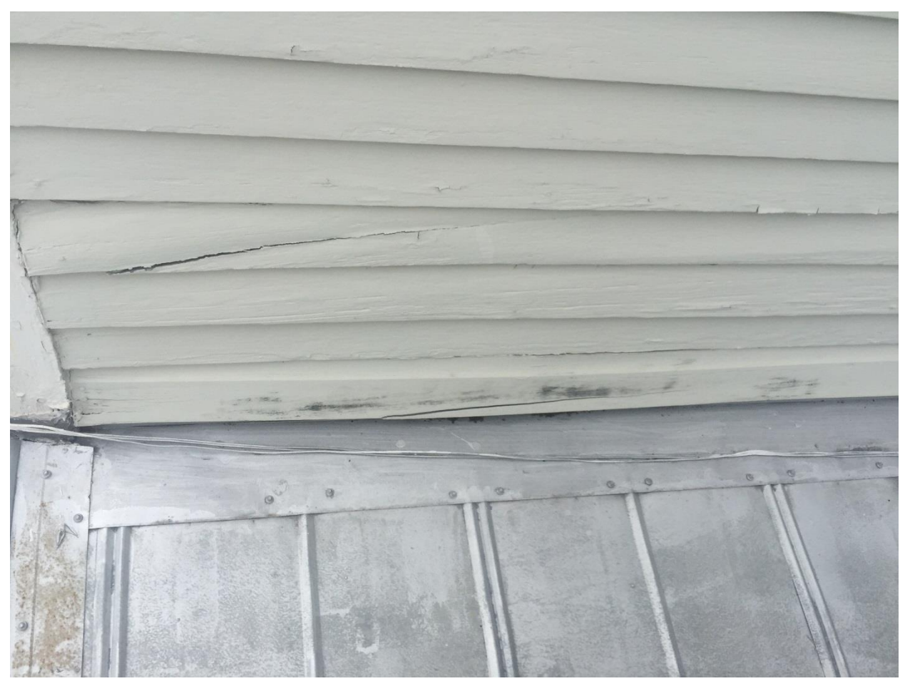
Second floor siding splitting and cable unsecured