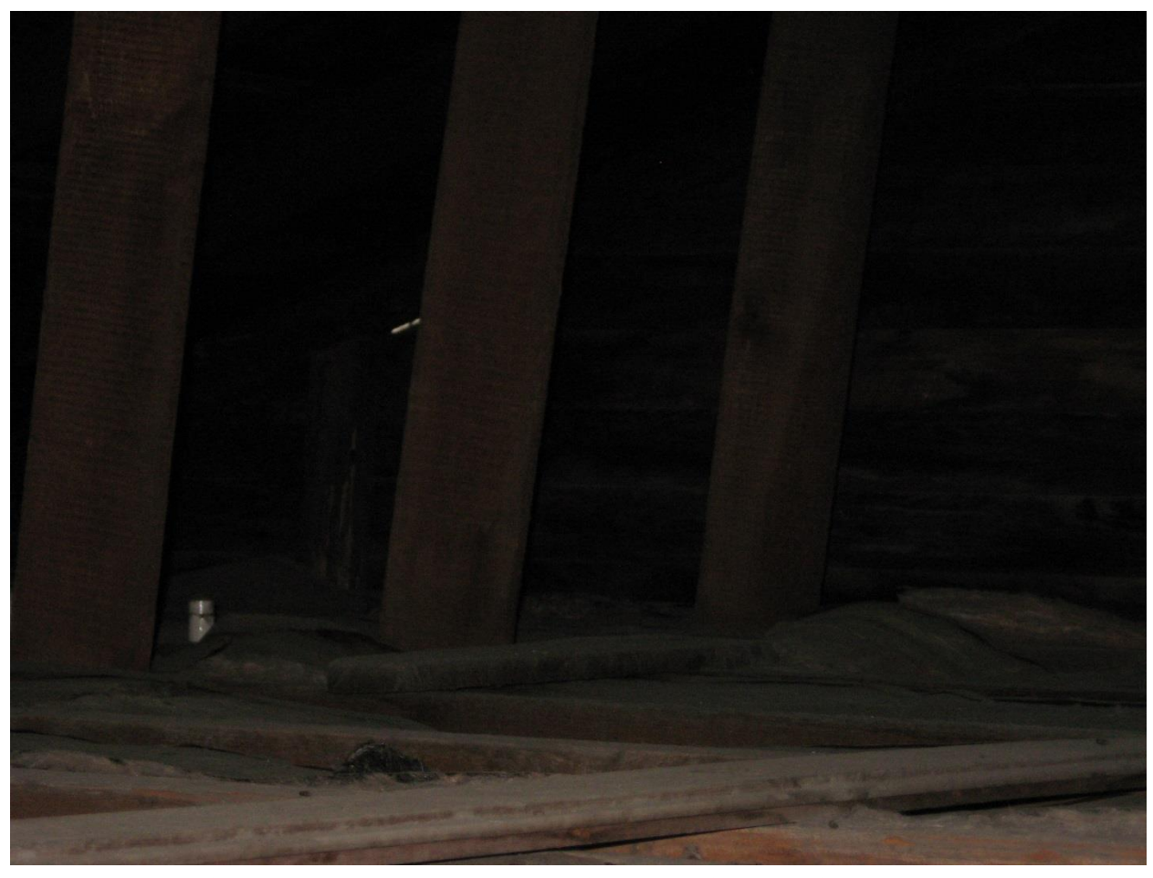
Can see light through the siding in attic