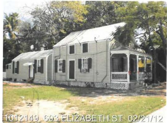
1012149 603 ELIZABETH ST 02/21/12

Parcel ID 00011830-000000 Account # 1012149 Property ID 1012149 Millage Group 10KW Location Address 603 ELIZABETH ST, KEY WEST Legal KW PT LOT 3 SQR 59 Q-685 C2-307 OR803-382 OR813-1359/1360 Description OR813-1361/1362 OR859-83 OR2557-1719/24 (Note: Not to be used on legal documents) Neighborhood 6103 Property Class MULTI FAMILY LESS THAN 10 UNITS (0800) Subdivision Sec/Twp/Rng 06/68/25 Affordable No Housing