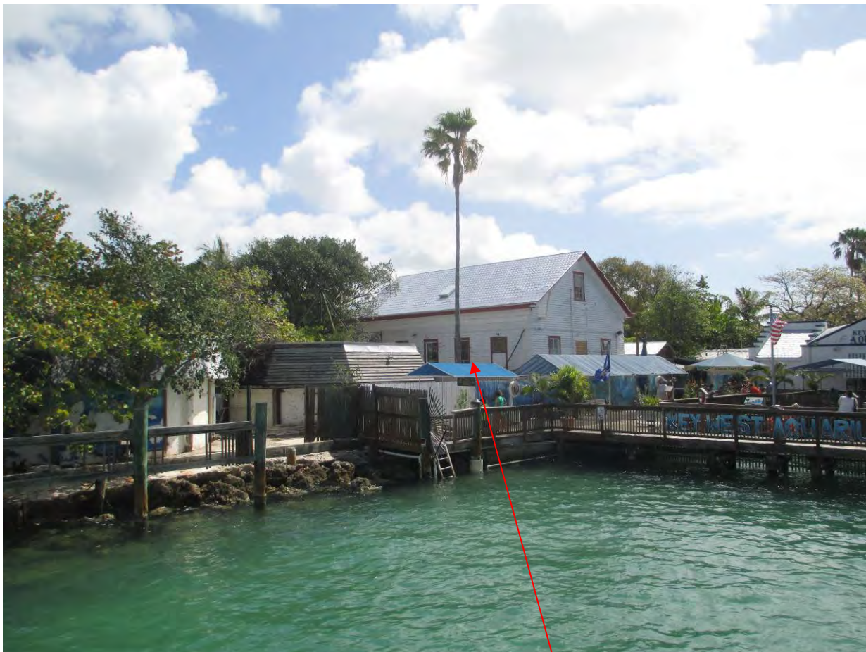
Tree #13 (Washingtonian Palm) to be removed