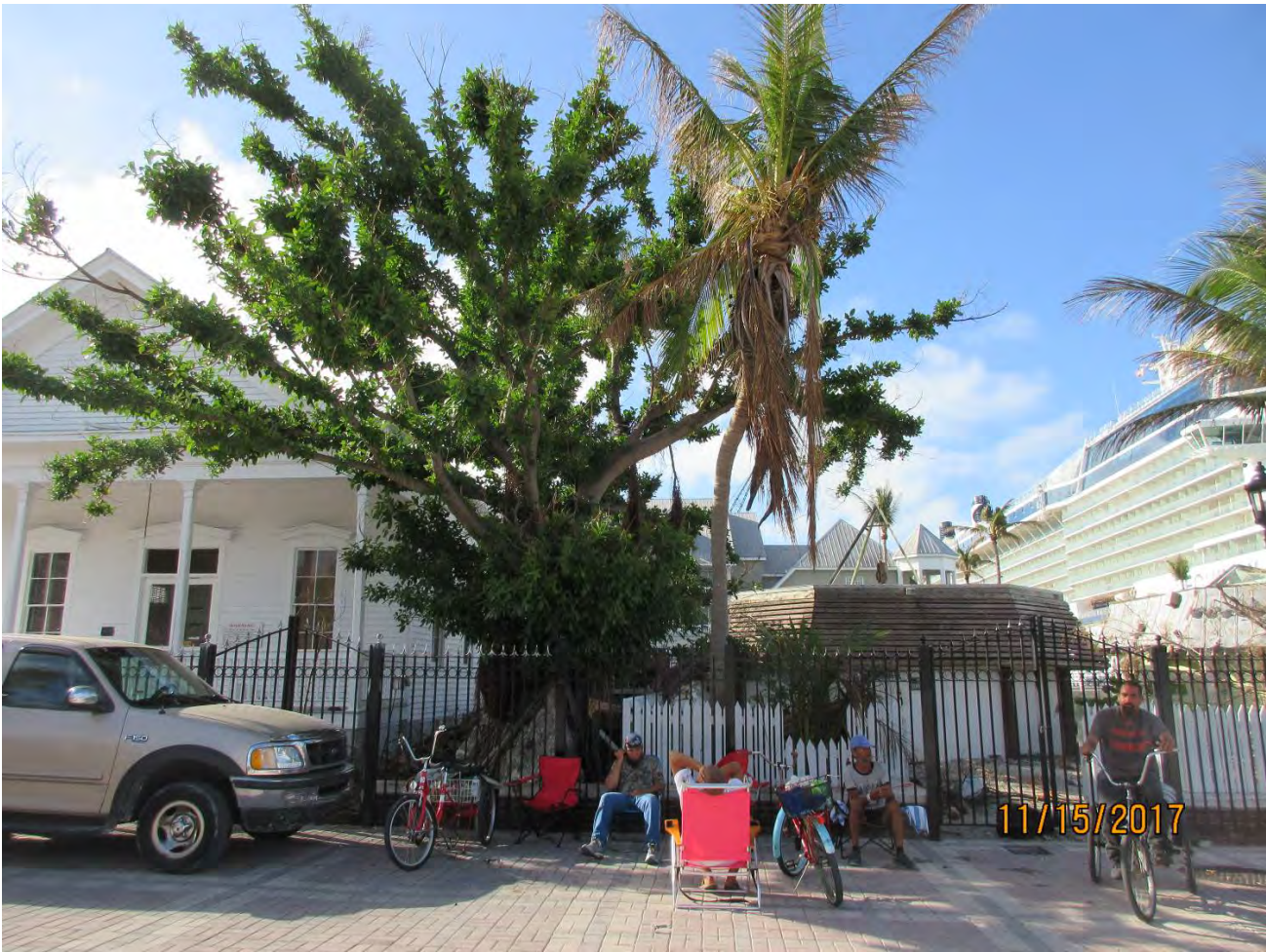
Tree #5 (Ficus) and Tree #4 (Palm)

The plans submitted do incorporate the changes since Hurricane Irma impacted the area and does incorporate 70% native vegetation appropriate for the location.