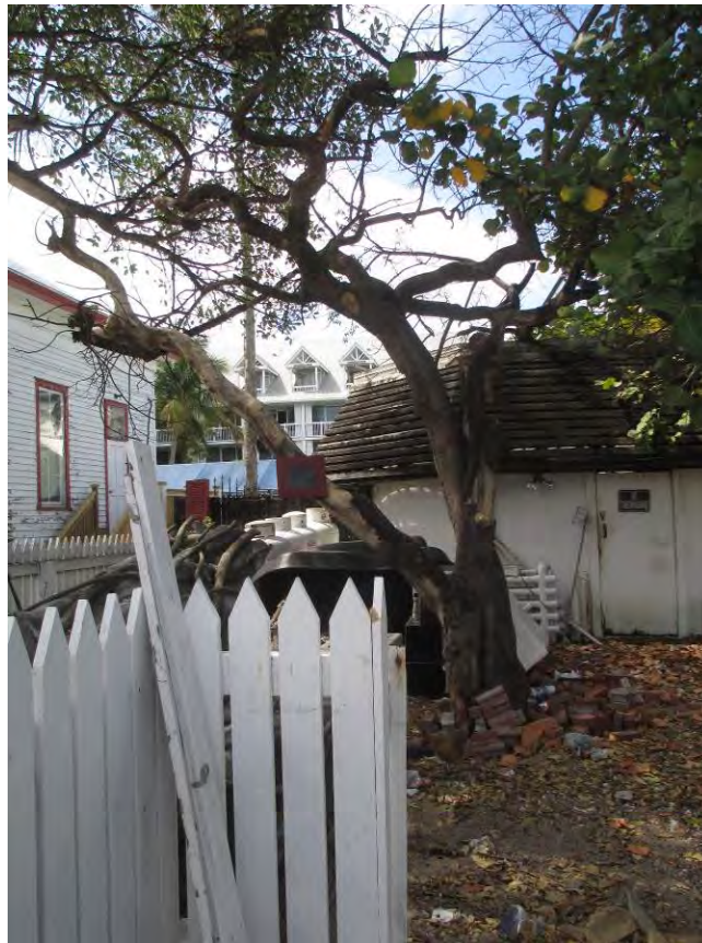
Tree #2 dead tree to be removed