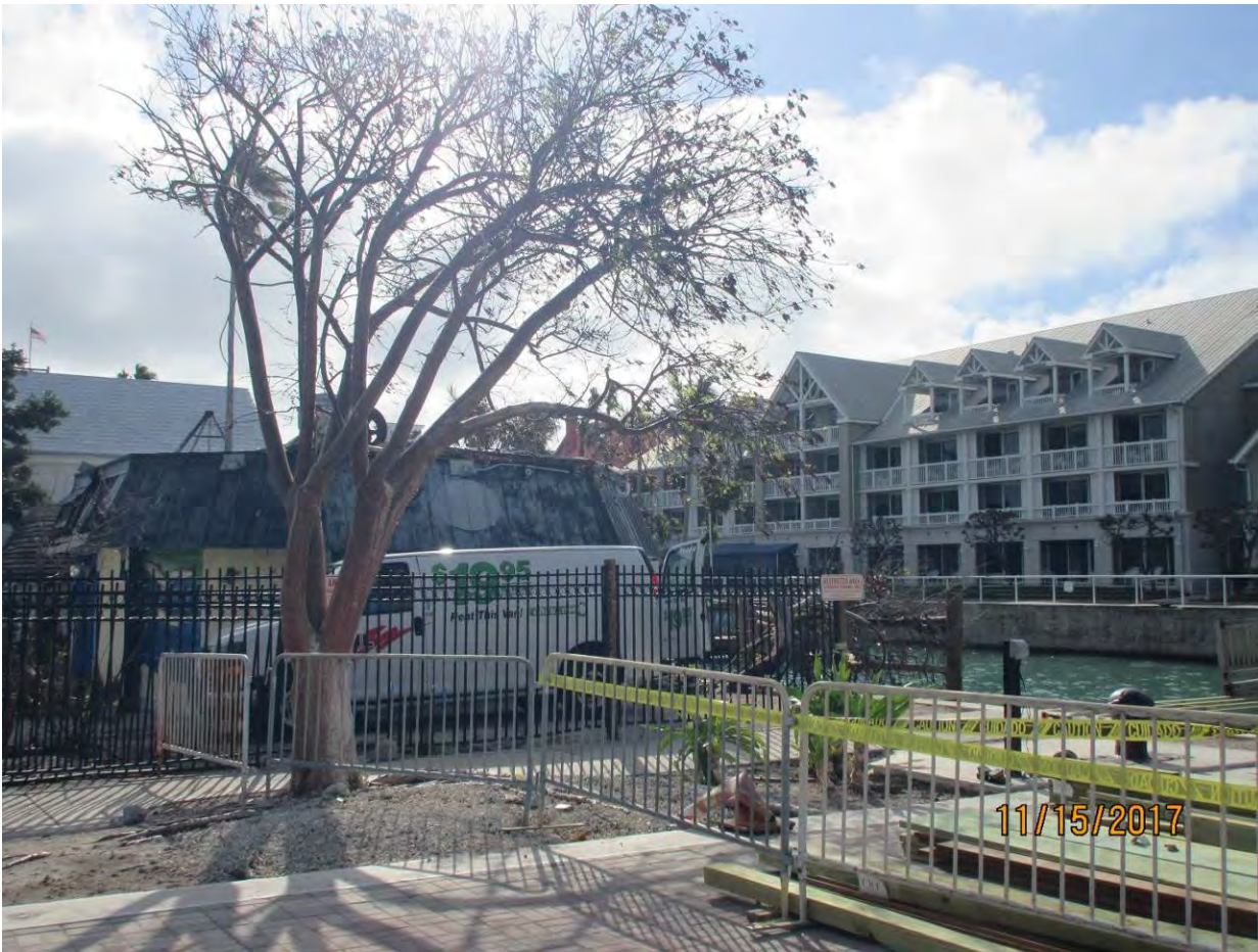
Tree #2: Gumbo Limbo