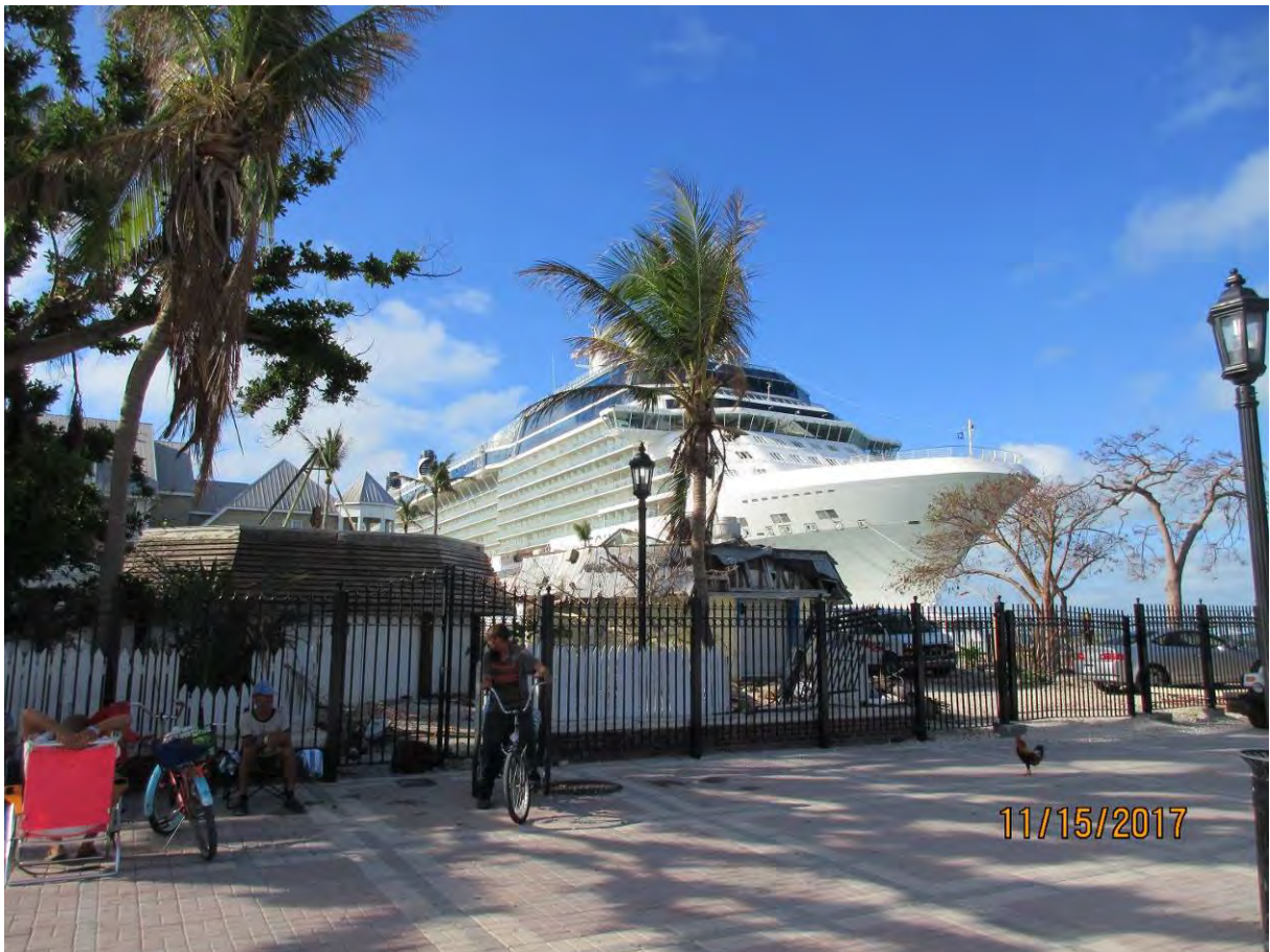
Trees 3 & 4: Palms