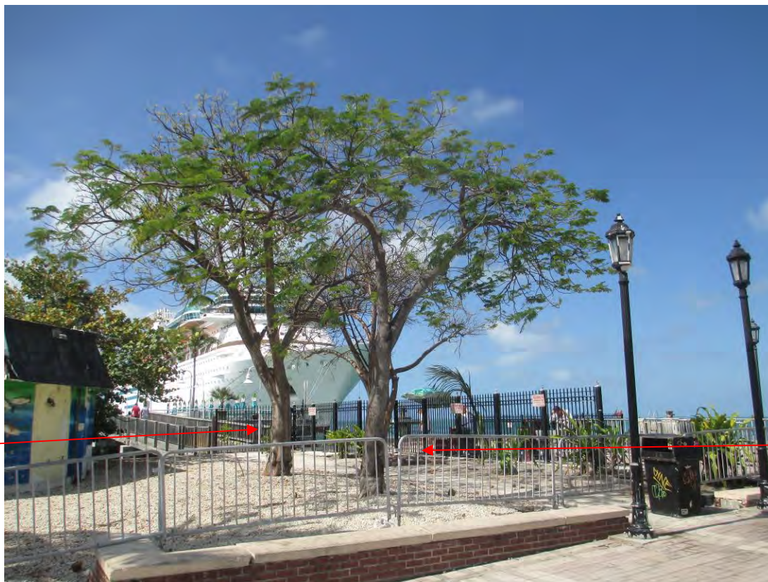
Tree #7 (Royal Poinciana) to remove