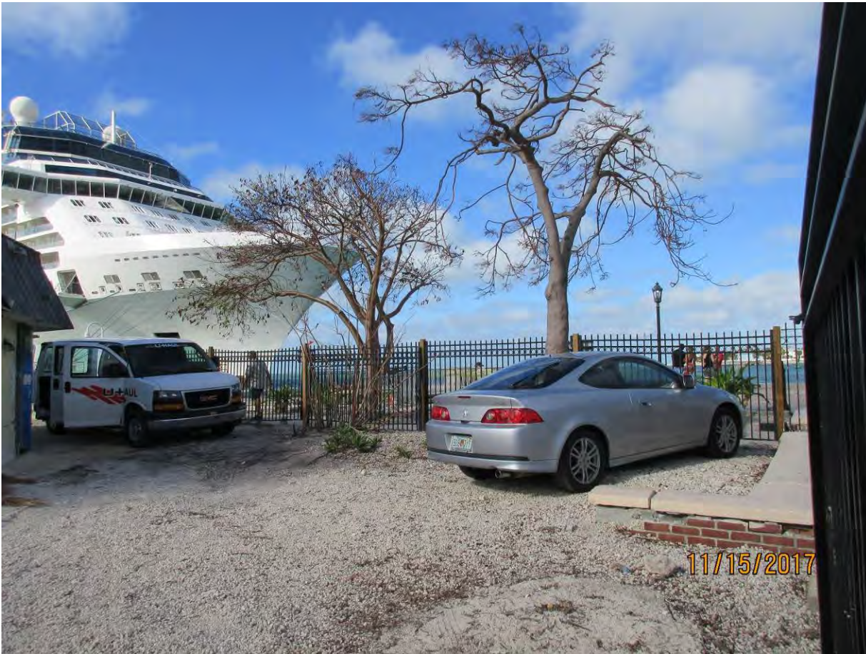
Trees 1 & 2