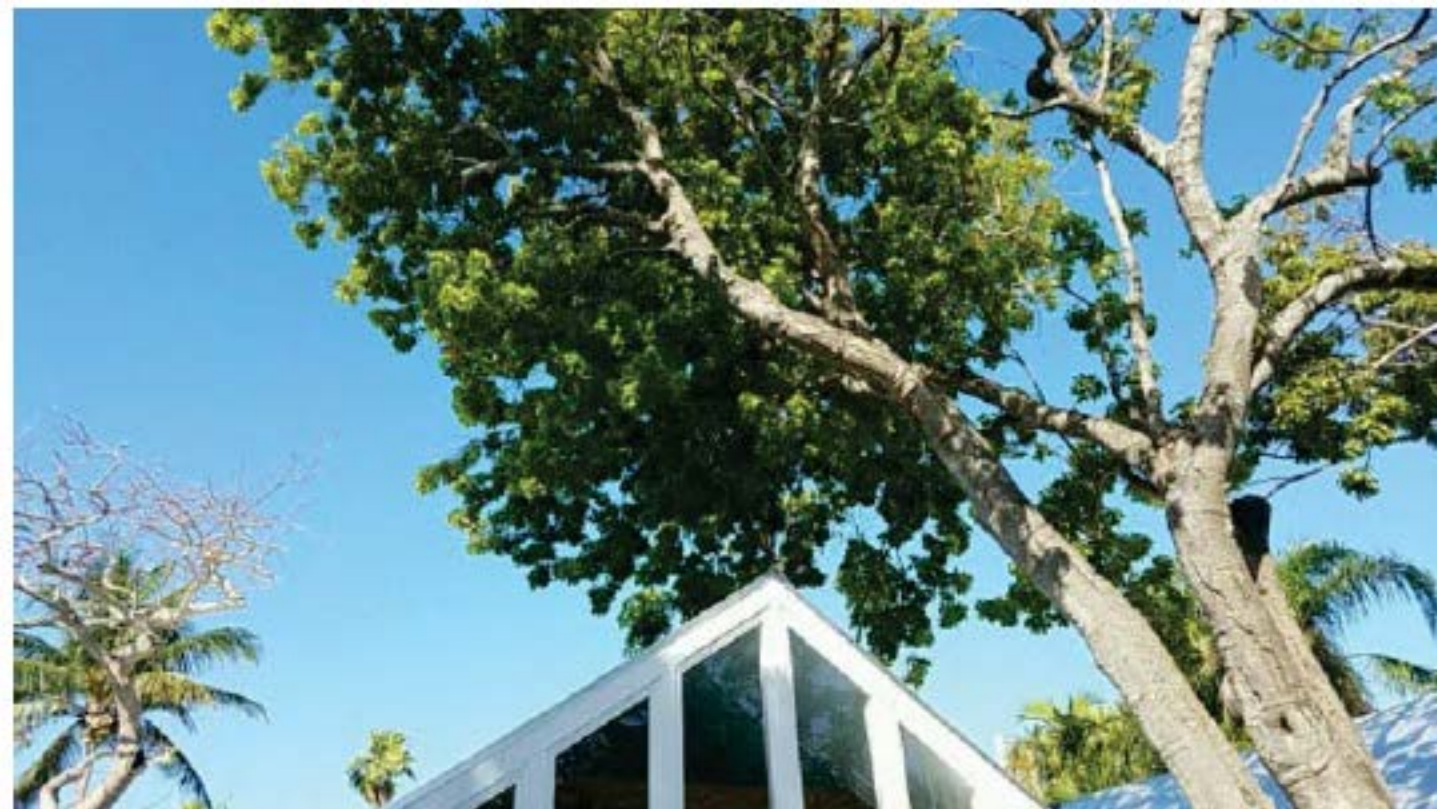
Tree: Branch Overhanging Roof, Tree, Rear, Tree overhanging dwelling