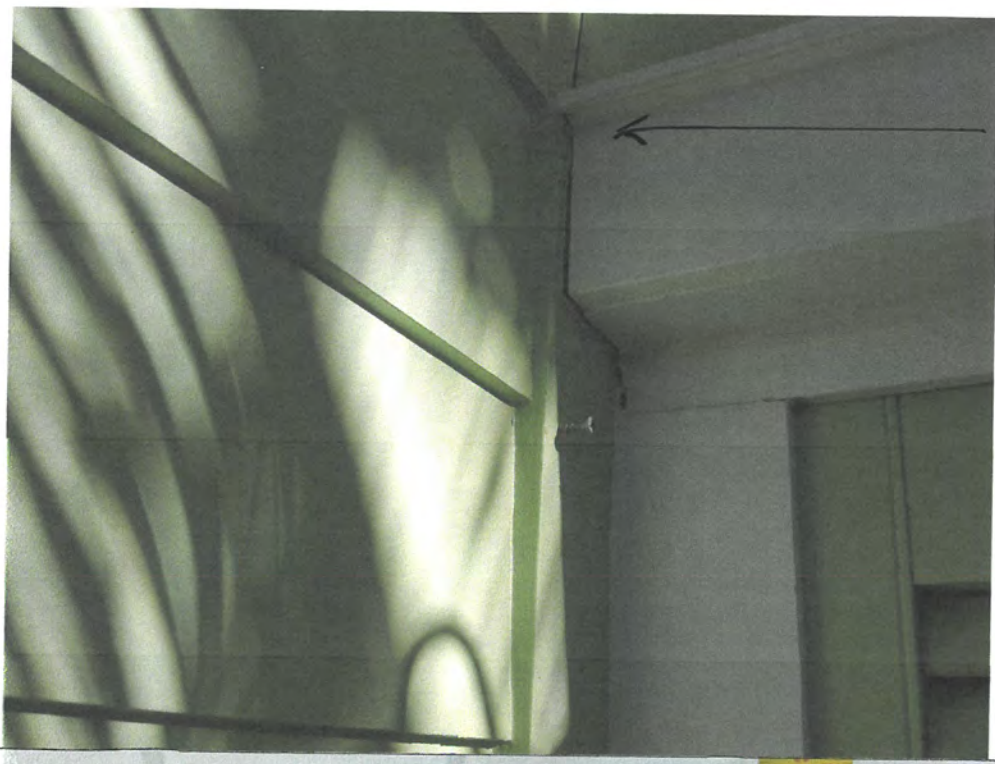
gap from uplift