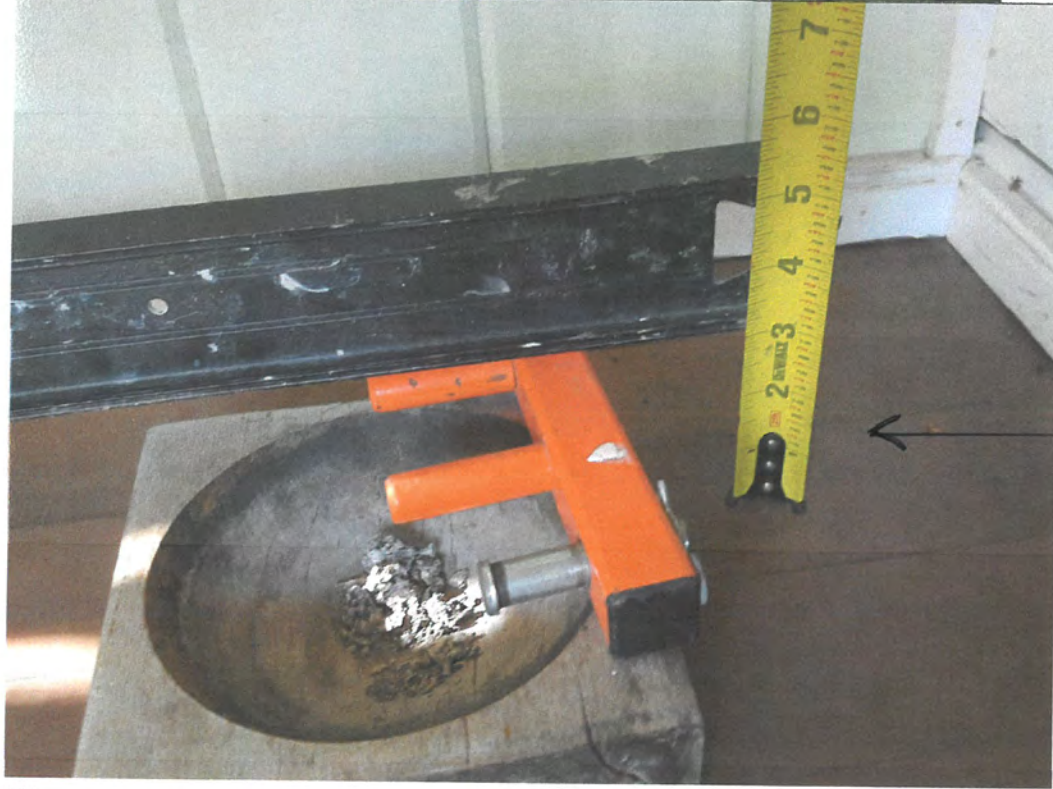
inside porch floor out 3"

Ale Helen Telen & Telen Inc. 200 Sector (seg Ame Raymen in 300m) (200) 849-9477