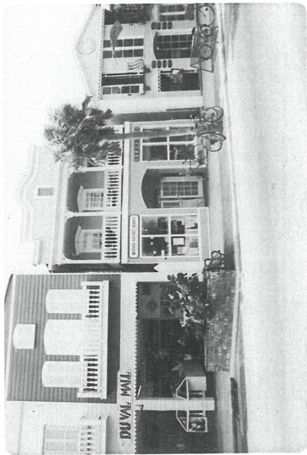
picture shows part of 618 Duval St. with balcony.