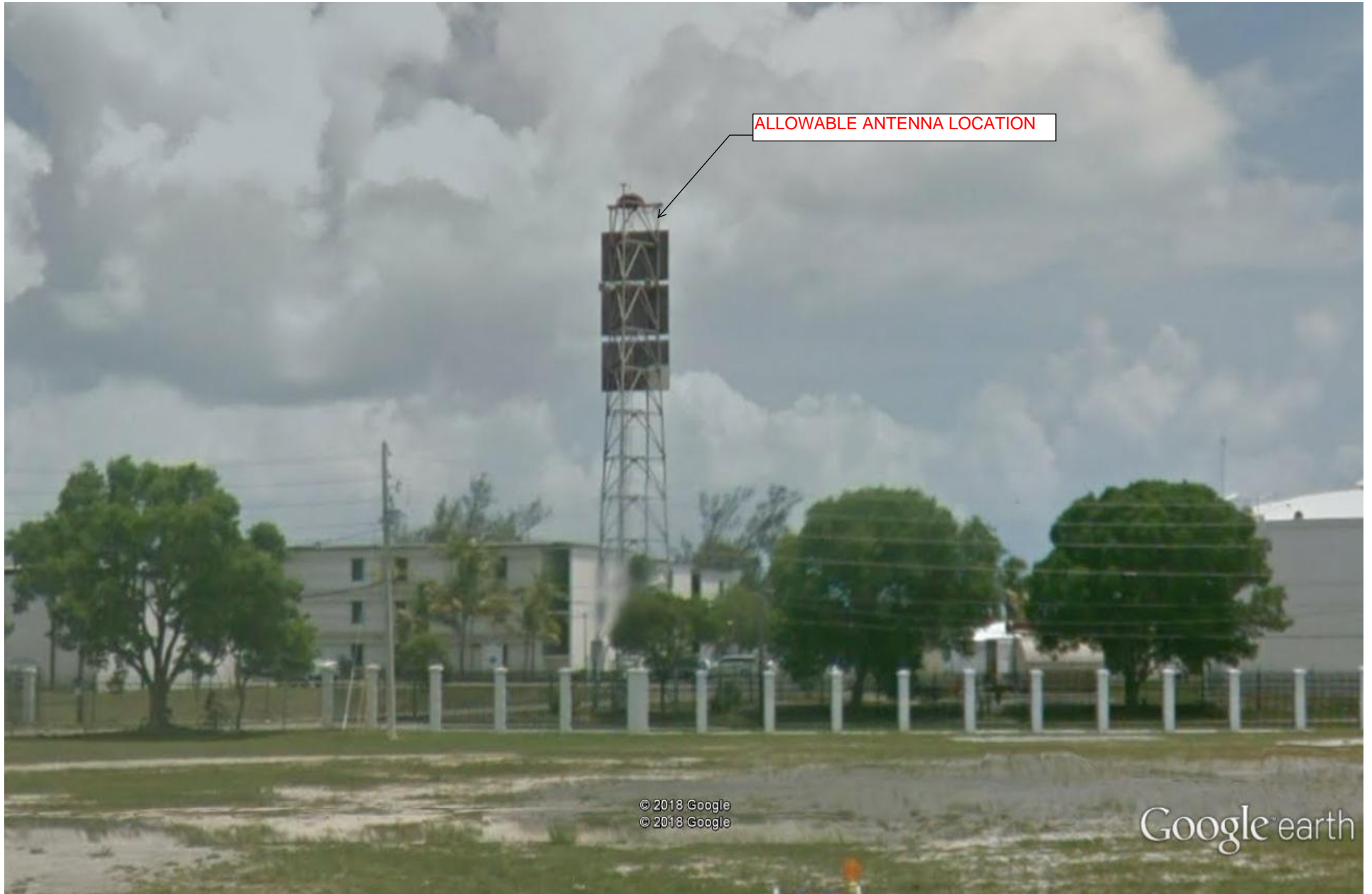
USCG RANGE MARKER