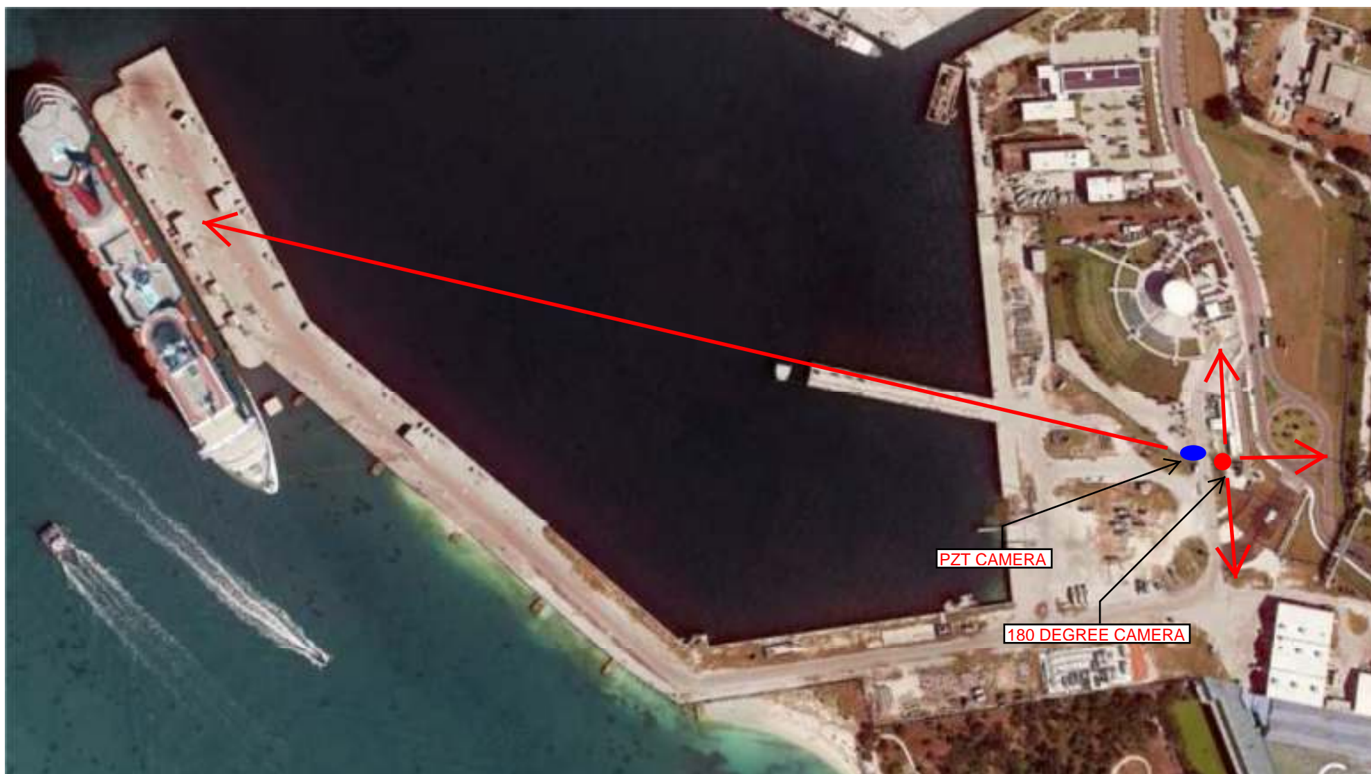
OUTER MOLE (CAMERA LOCATION MAP)