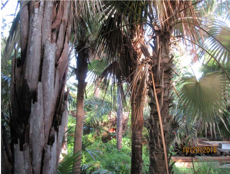
824 Thomas Street

Standing on the right of way area on 225 Olivia Street and looking over the fence at 824 Thomas Street, at least nine (9+) regulated and protected palms and one, protected Joewood tree (State Listed Endangered Species) was observed within the right of way area. Some of the smaller palms could be transplanted but cost and logistics would have to be reviewed regarding the transplanting of the taller, larger palms and the Joewood tree.