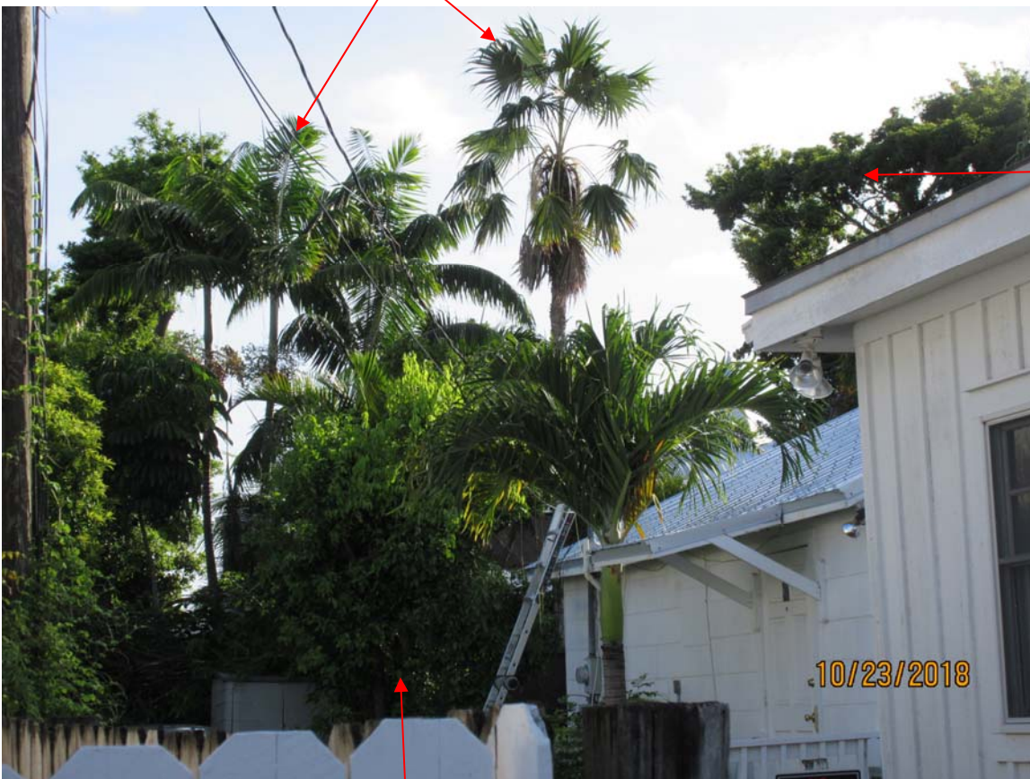
Regulated Palms outside of right of way area-828 Thomas Street

Standing in front of 1 Baptist Lane and looking toward the rear of the property. Regulated and protected trees observed near the right of way area included a Spanish Lime and Sapodilla tree