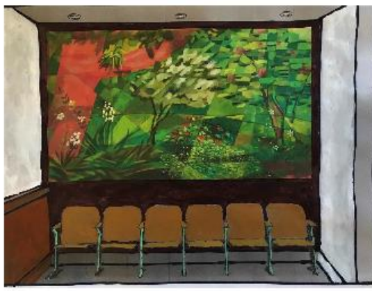
Wall Installation for Ten Native Trees and Flowers