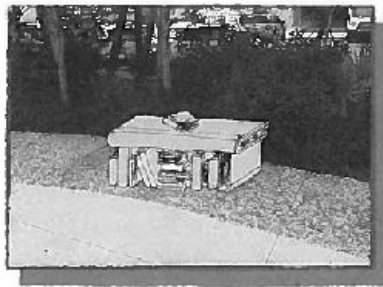
Concept C: Book Benches Craig Gray Key West, Florida Possible Location- United Street sidewalk

TWO (2) ORIGINAL BOOK BENCHES IN GRANITE AS DESCRIBED IN THE ARTIST’S PROPOSAL. EACH BENCH WILL MEASURE 60” long, 18” wide, and 18” high. BOOK TITLES TO BE DETERMINED BY THE AIPP BOARD ALONG WITH THE ARTIST. INSTALLATION AND SPECIFIC SITE IN THE BUTTERFLY GARDEN TO BE DETERMINED BY THE AIPP BOARD WITH THE CITY ENGINEER AND ARTIST.