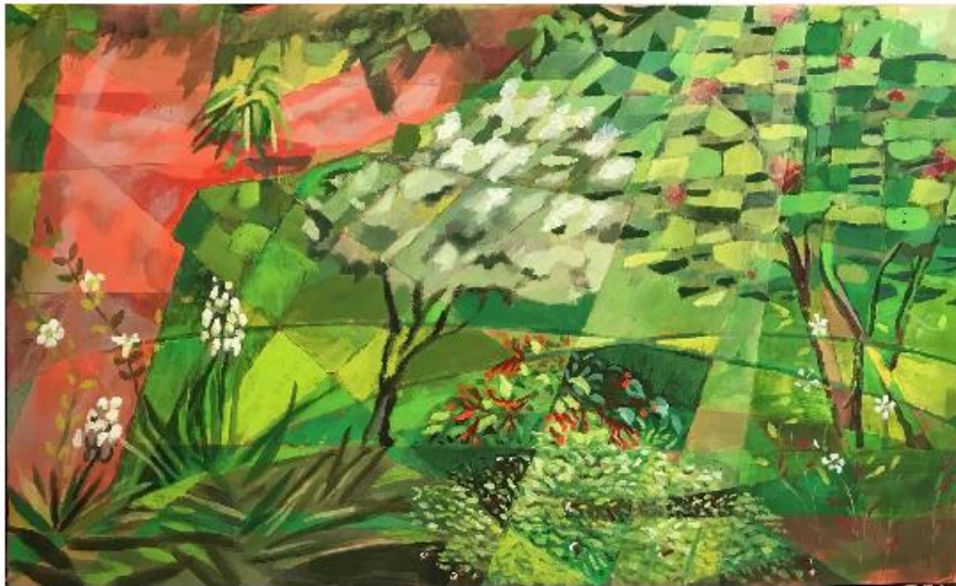
Ten Native Trees and Flowers

AN ORIGINAL FRESCO MURAL ON A 6' X 10' FOOT PANEL INSTALLED ON THE WALL WITH CHAIRS IN THE FRONT LOBBY OF CITY HALL. THE WALL WILL BE PAINTED BY ARTIST WITH BEHR PAINT HDC-AC-26 FROM FLOOR TO CEILING PRIOR TO PANEL BEING INSTALLED. THE MURAL WILL DEPICT 10 NATIVE TREES AND FLOWERS AS DESCRIBED IN THE PROPOSAL AND A LEGEND OF THE FLORA WILL BE INCLUDED AS AN EDUCATIONAL REFERENCE FOR THE PUBLIC.