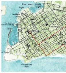
LOCATION MAP - NTS SEC. 6-T685-R25E