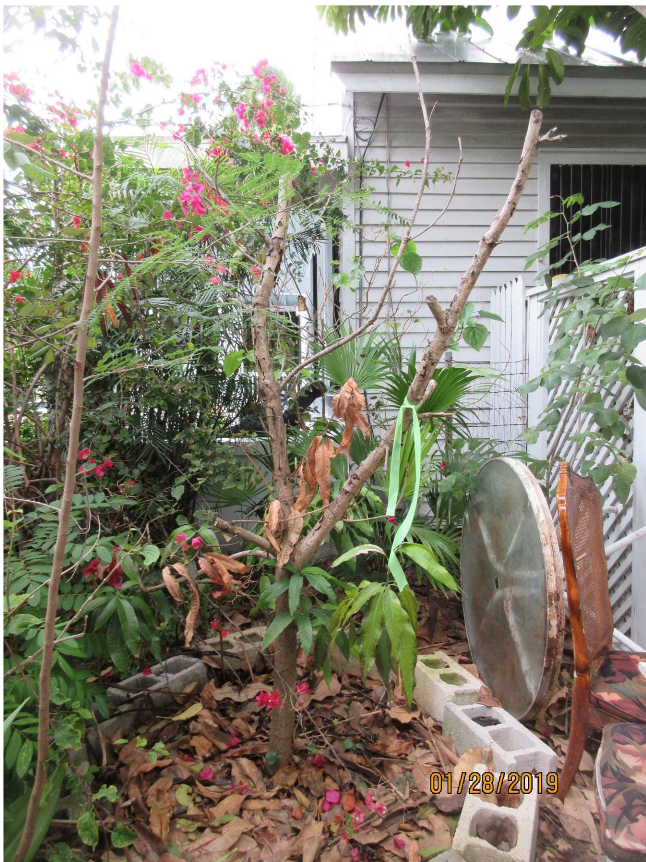
Tree Species: Mango ( Mangifera indica )