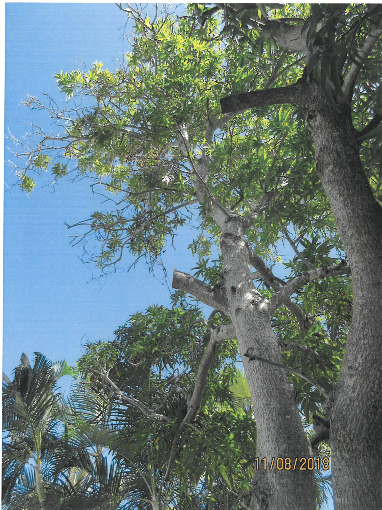
Key to the Caribbean – average yearly temperature 77 ° Fahrenheit.