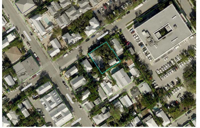
Proposed Receiver Site Location on Transient Rental Transfer Map: