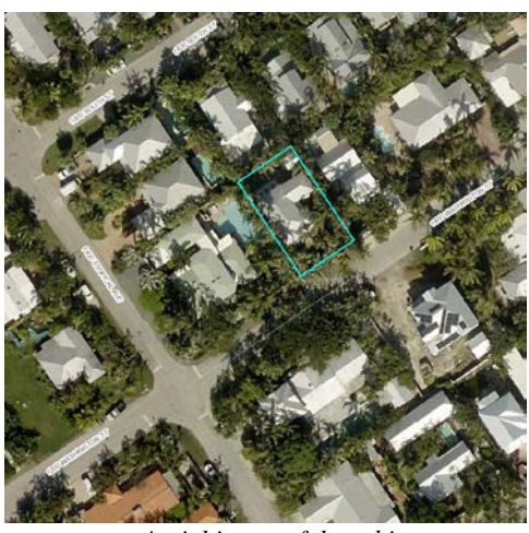
Aerial image of the subject property.