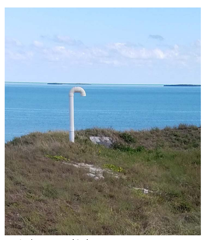
Typical gas vent (GV).

H_2S : 0 to 100 ppm in 0.1 ppm increments LEL Methane: 0 to 100% in 1% increments