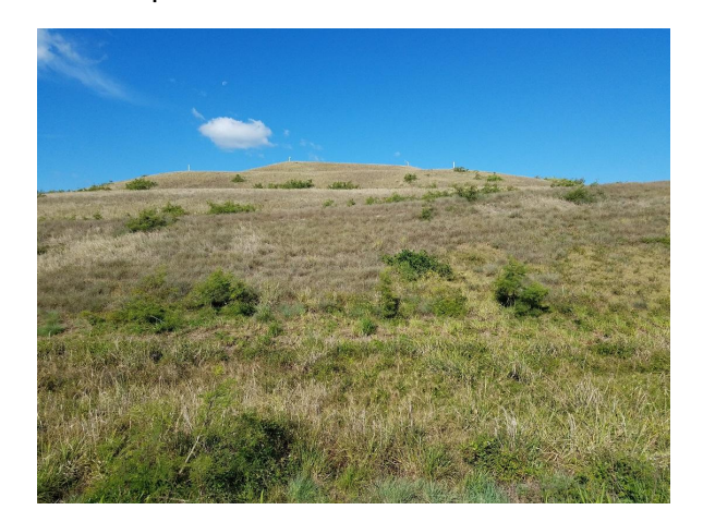
North Slope (2)