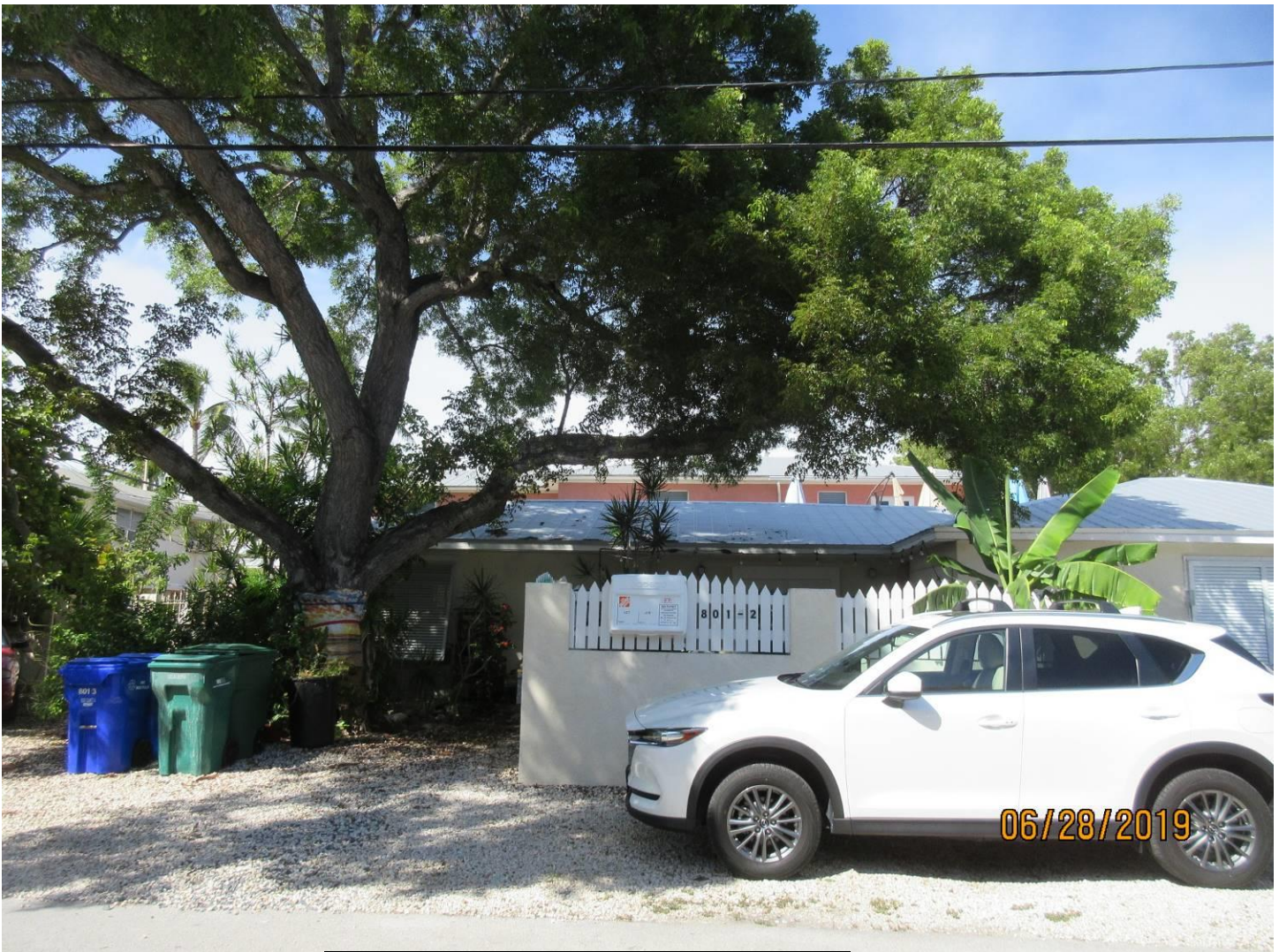
Street view photo of area, June 28, 2019.

The week of June 24, 2019, I received a complaint that a neighbor was going to cut down some trees at 801 Waddell Avenue. A site visit on June 28, 2019, determined that most of the vegetation in the area was ornamental or not regulated except for several thatch palms, a young Gumbo Limbo tree, and a large Mahogany tree. On July 2, 2019, Roberto Alvarenga called after finding my business card on the property and stated that he had cleaned the area and removed most of the vegetation including the young Gumbo limbo tree. He also sent an email stating what had happened and why (see email attached).