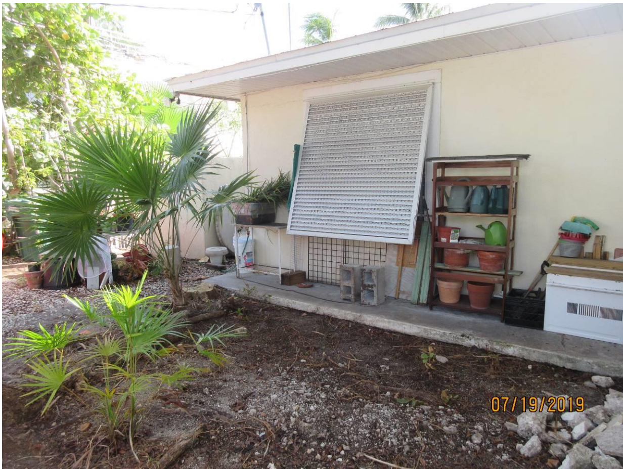
Photo of the area where Gumbo limbo tree was located, view 2, July 19, 2019.