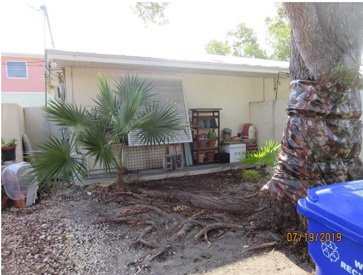
Photo of the area where Gumbo limbo tree was located, view 1, July 19, 2019.