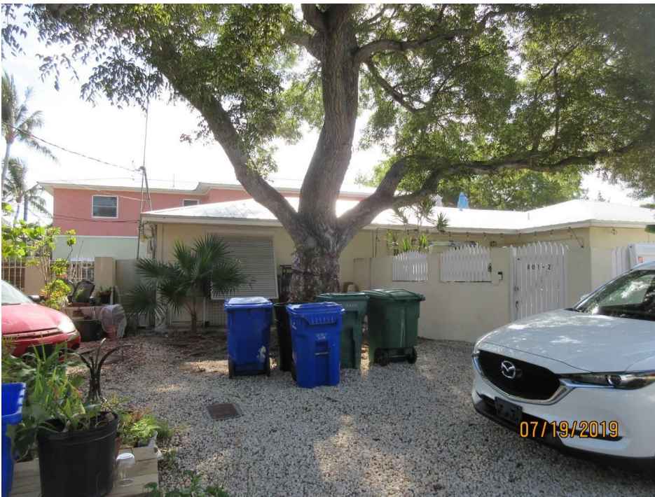
Streetview photo of area, July 19, 2019.

The diameter of the Gumbo Limbo tree was approximately 2-3" with a strong growth lean over the roof. It was a young tree growing under the canopy of the large mahogany tree. Recommend requiring replanting at least 3" of approved tree species on the property.