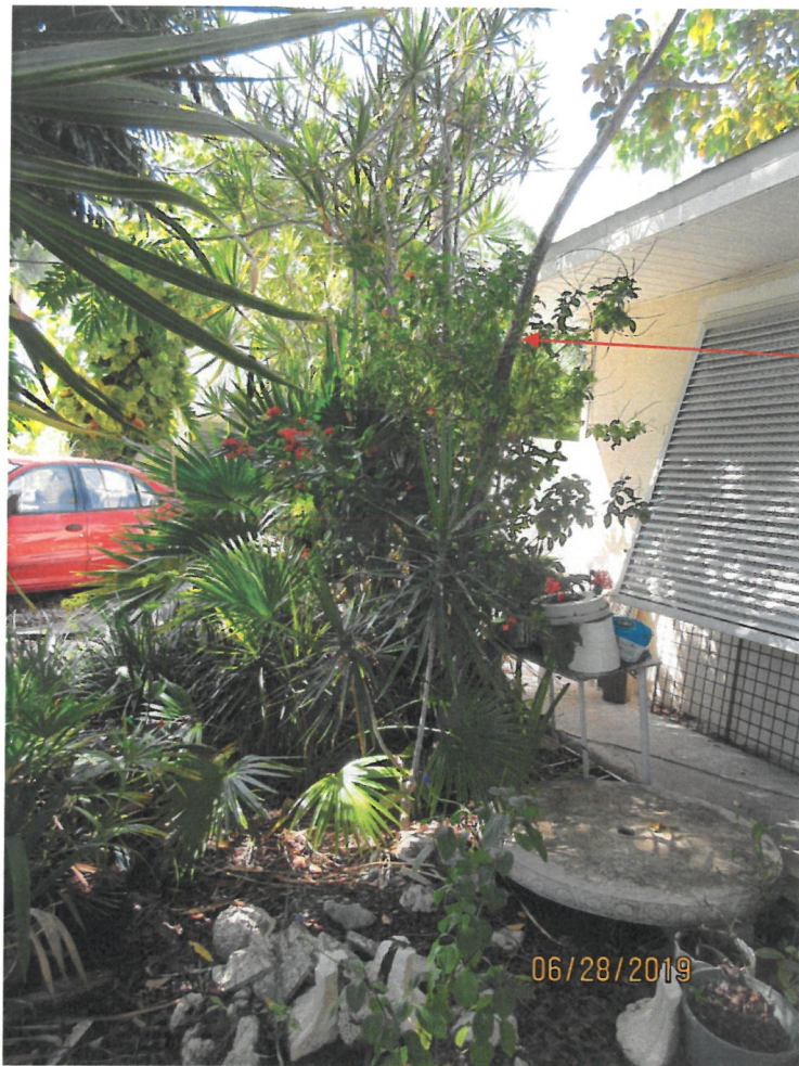
Gumbo Limbo tree