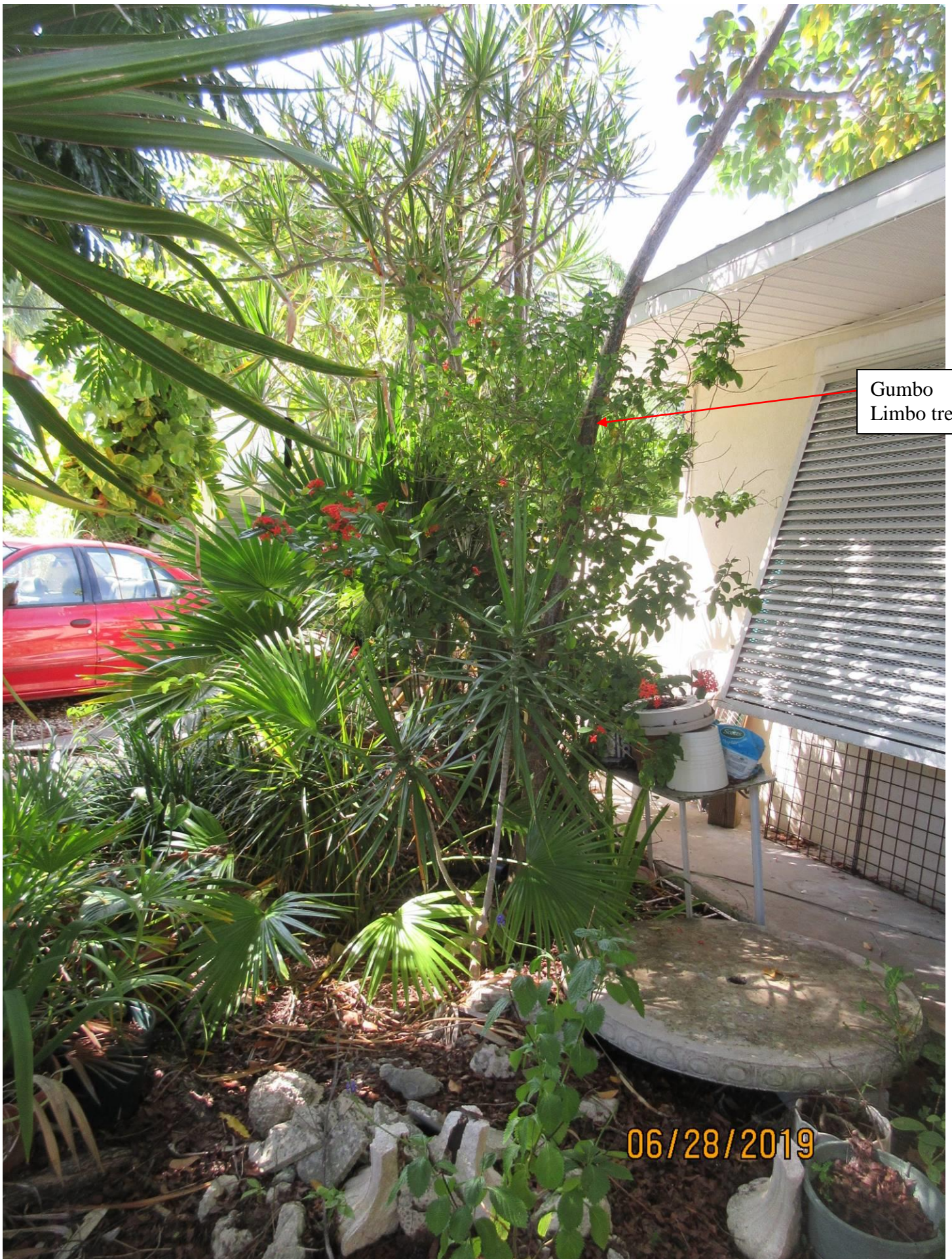
Gumbo Limbo tree