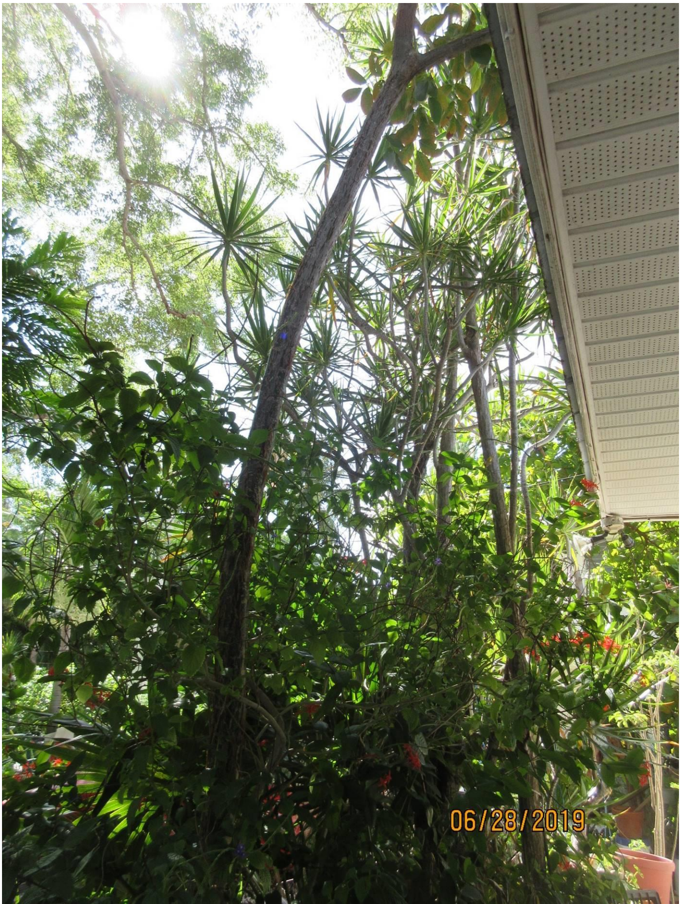
Photo of Gumbo limbo tree June 28, 2019.