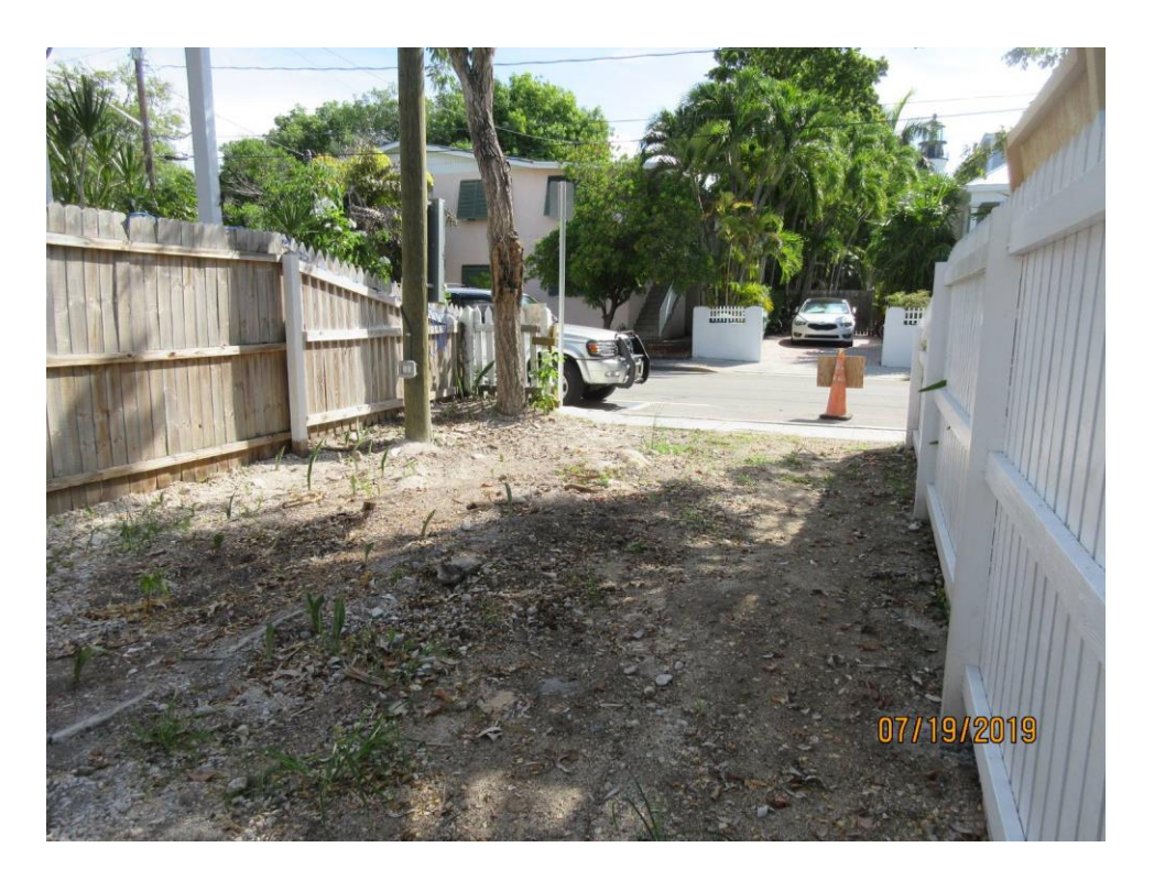
Photo showing location of removed trees, view 2 dated July 19, 2019.