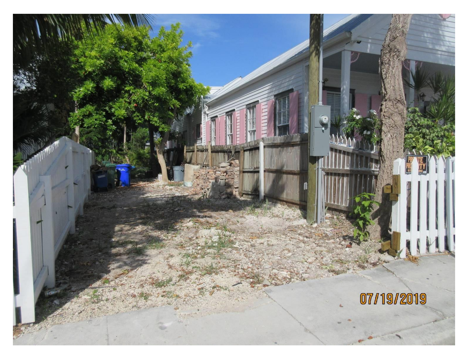
Photo showing location of removed trees, view 1 dated July 19, 2019.

On June 25, 2019 while inspecting a tree down the street, a chainsaw was heard and while walking toward the noise, a crew person from Blue Native was observed cutting down a Blolly tree (tree #7). Upon arriving at the actual property, it was documented that a Lignum vitae (tree#8) and a Jasmine tree (tree#6) had already been cut down. These trees were authorized to be transplanted under permit T2018-0042, issued November 9, 2018.