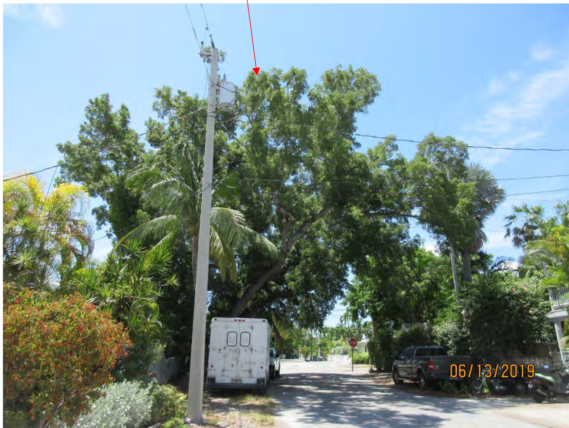
Street view of tree