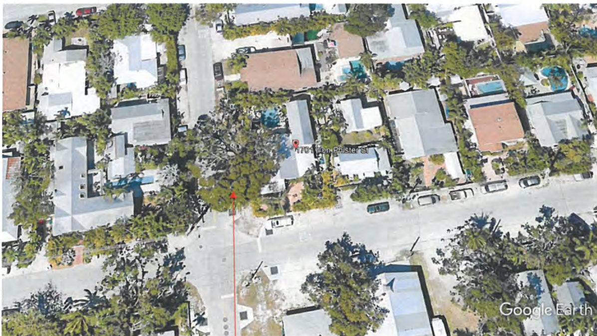
1701 Von Phister Mahogany tree-Ashby Street side