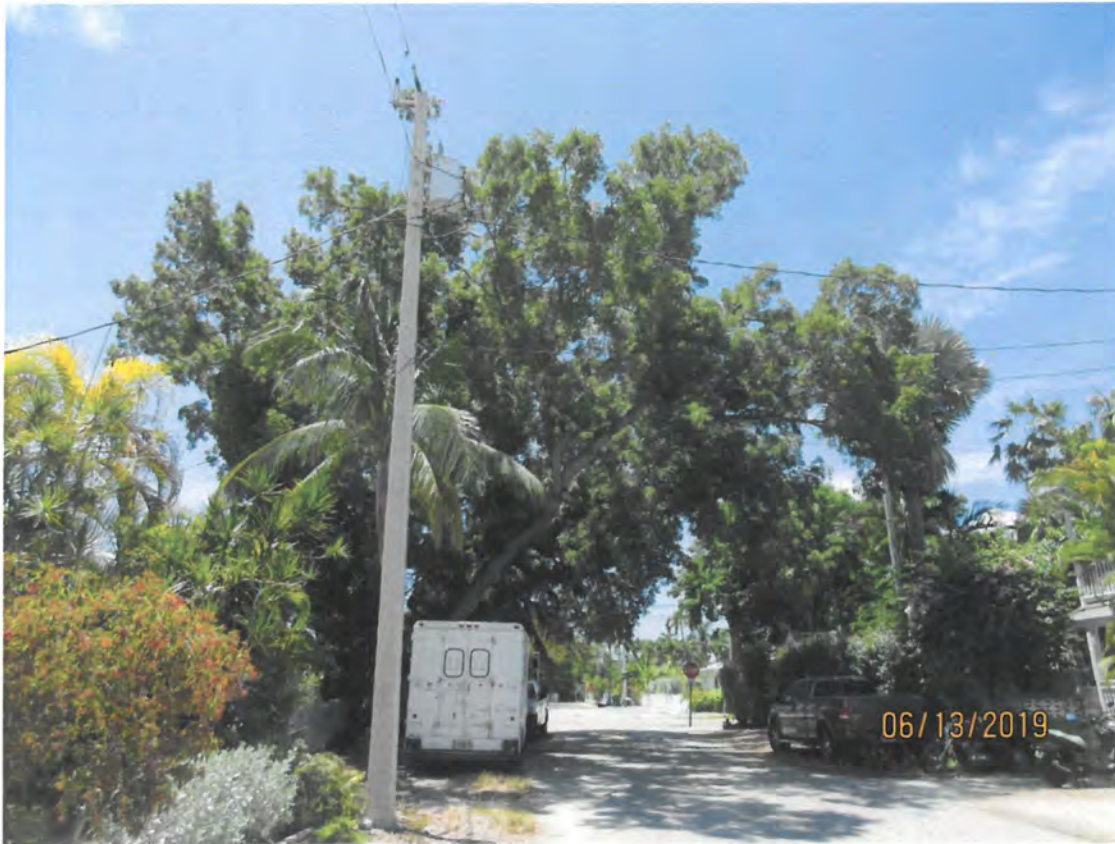
1703 South Street-Ashby Street Mahogany