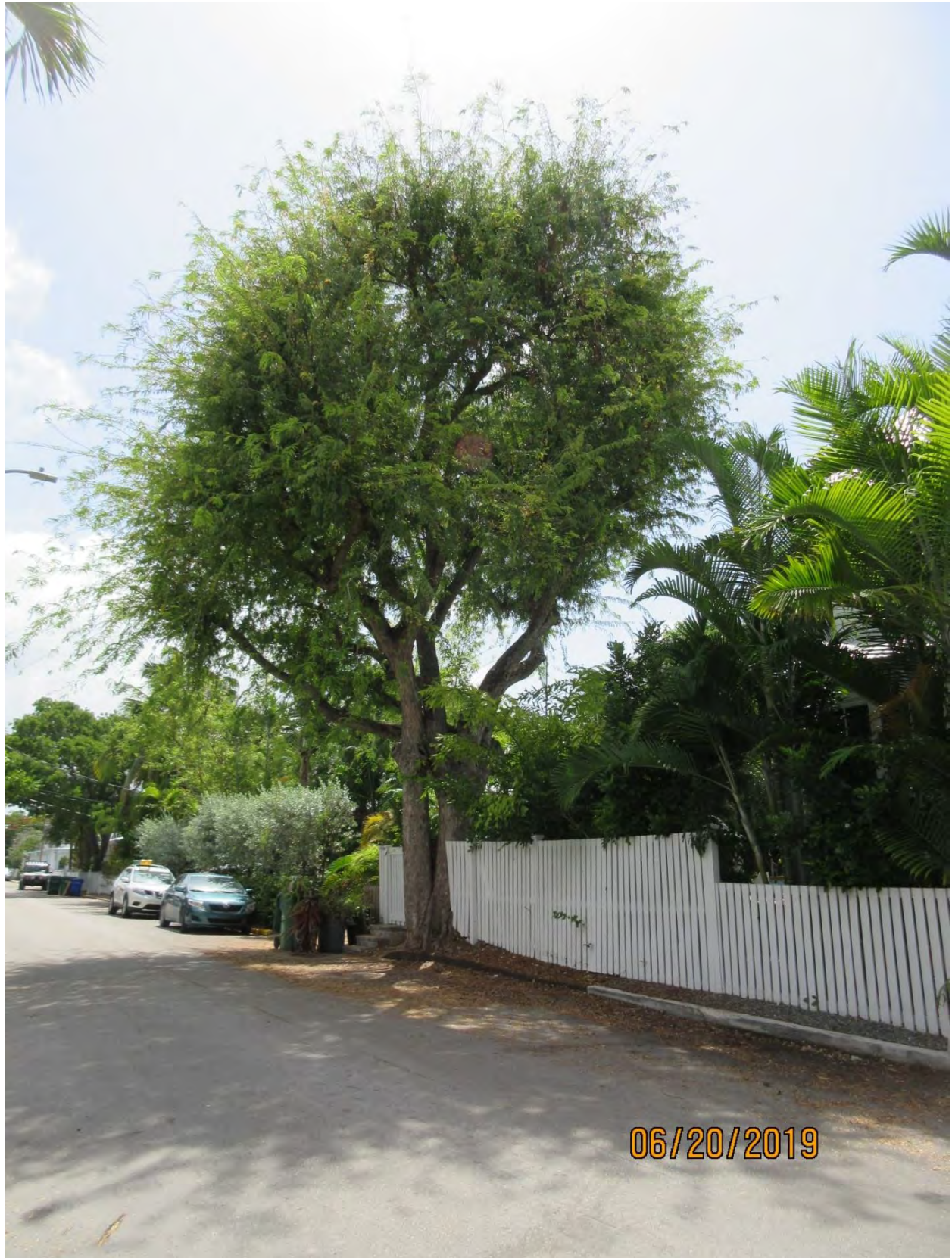
Street view of tree