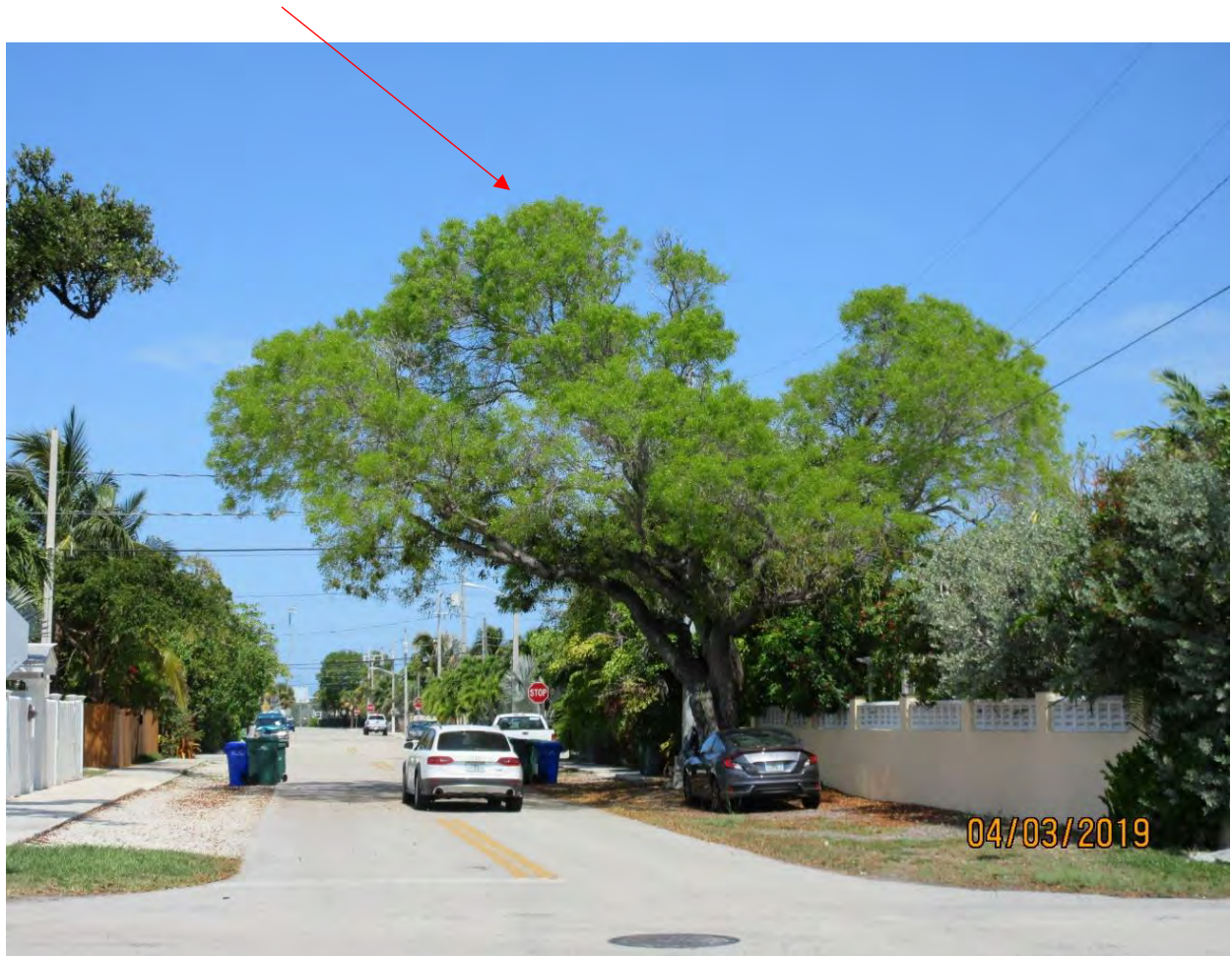
Street view of tree