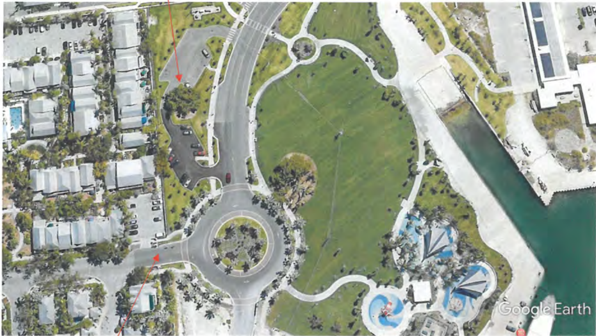
Southard Street entrance