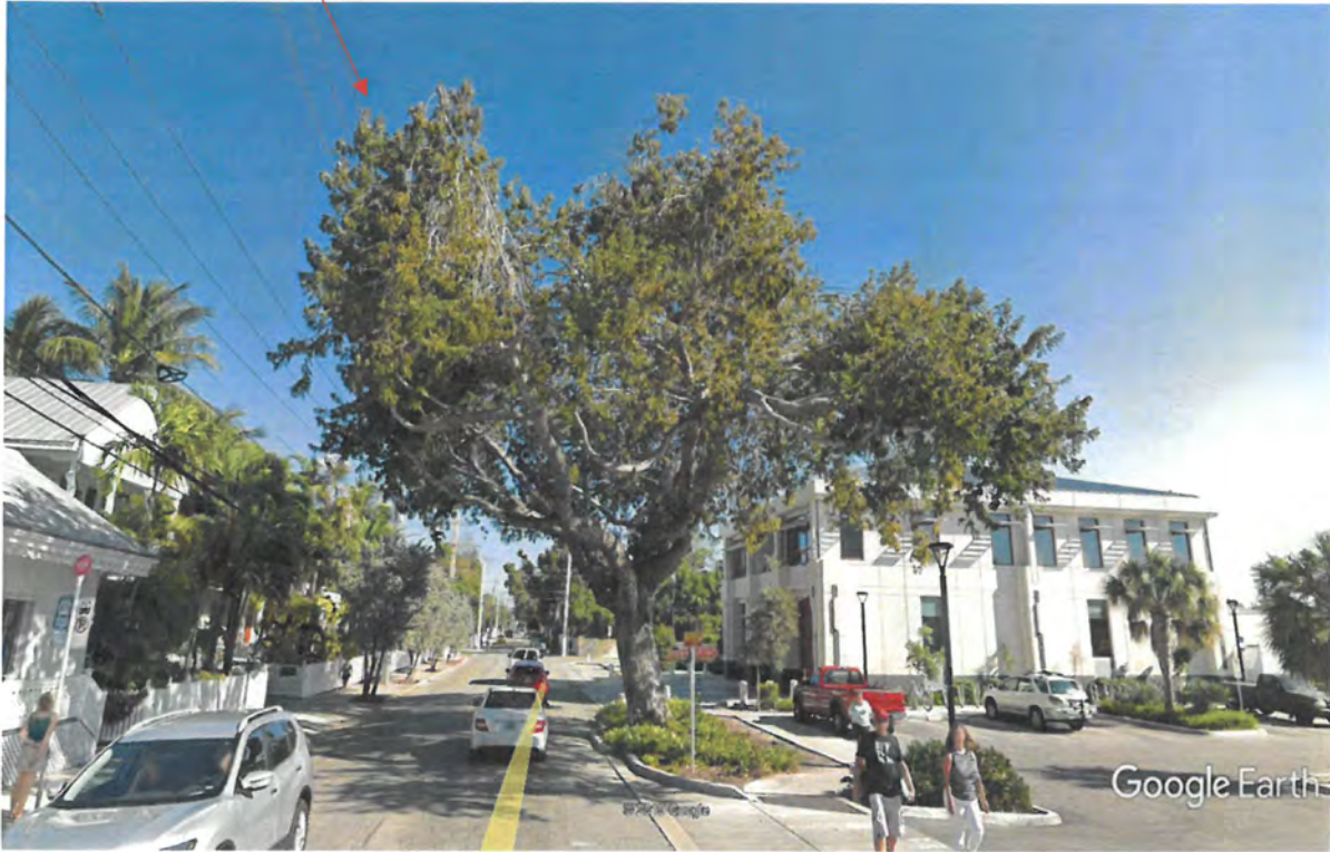
Truman Waterfront Park Seagrape view 1