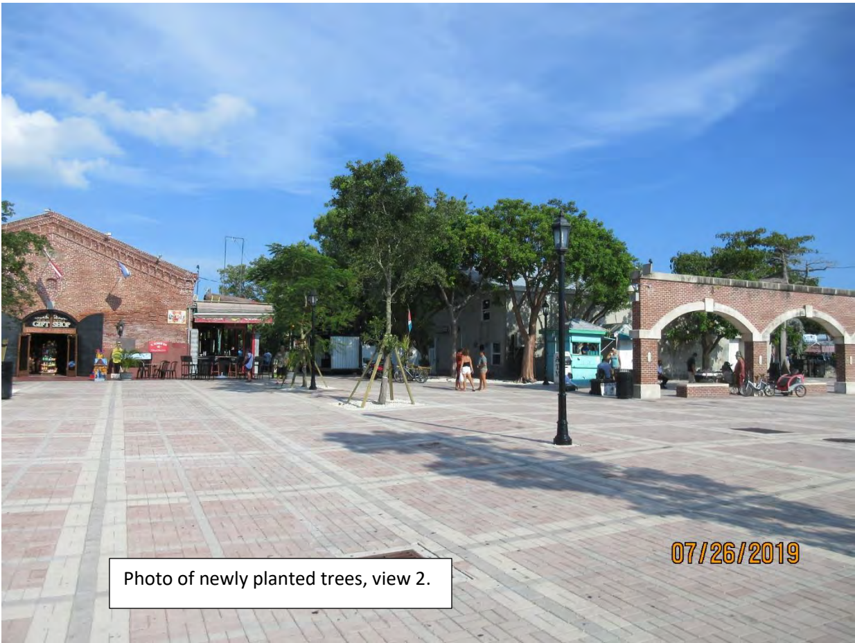
Photo of newly planted trees, view 2.