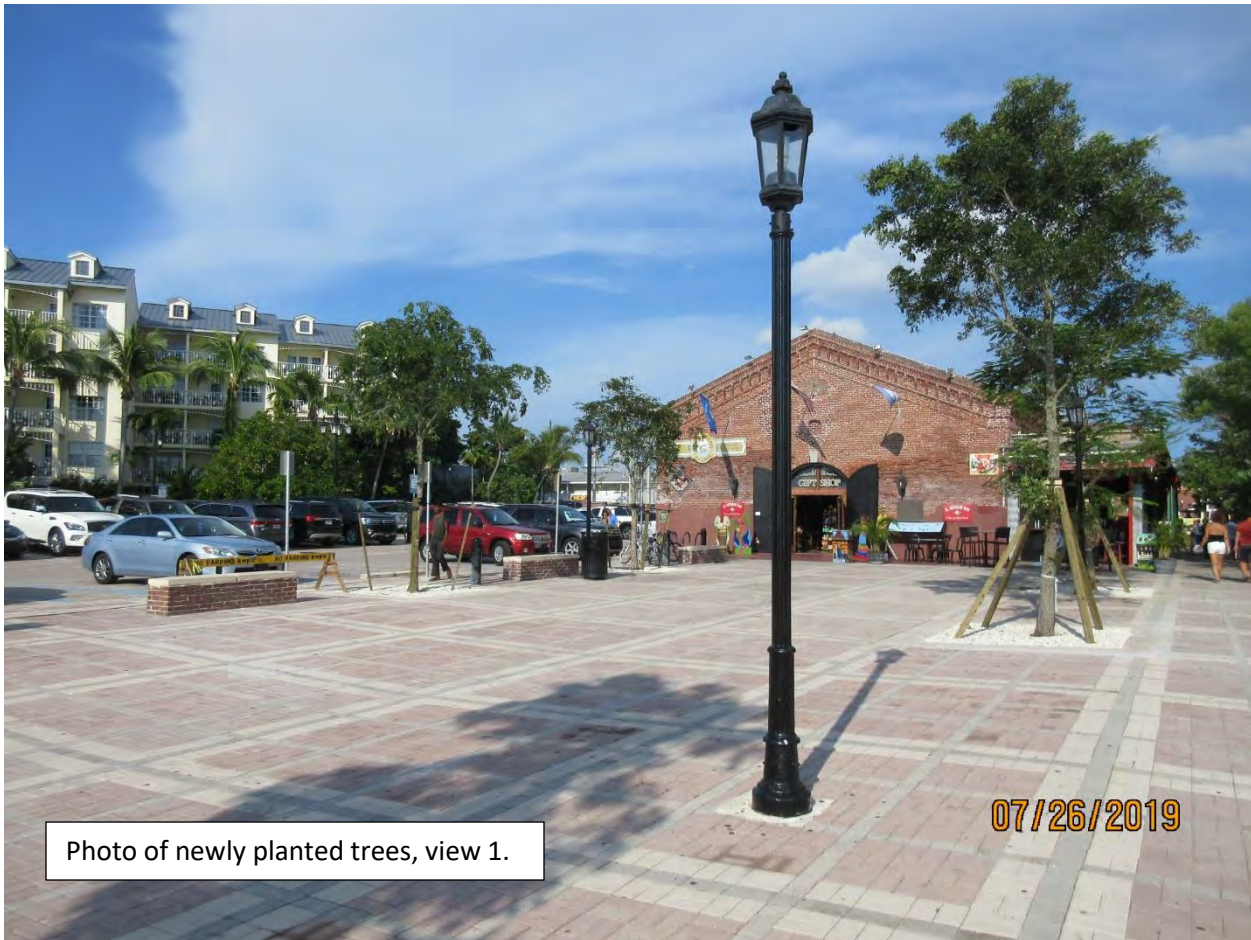
Photo of newly planted trees, view 1.