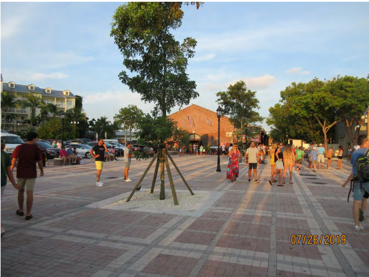
Photo of planted tree area view 4 during sunset celebration.