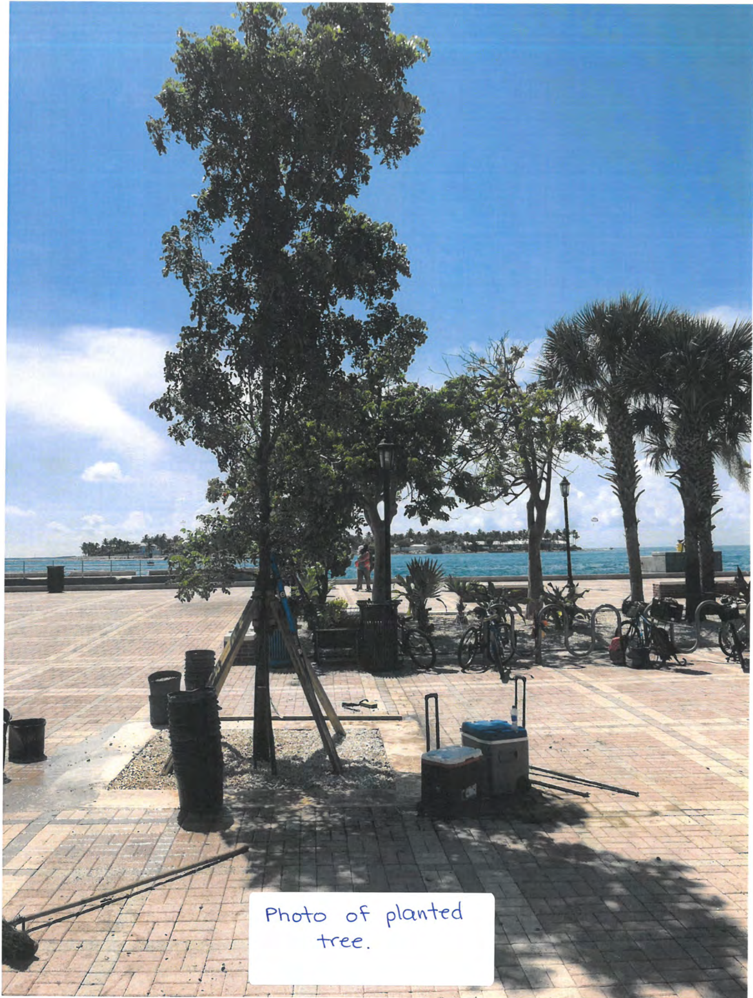
Photo of planted tree.