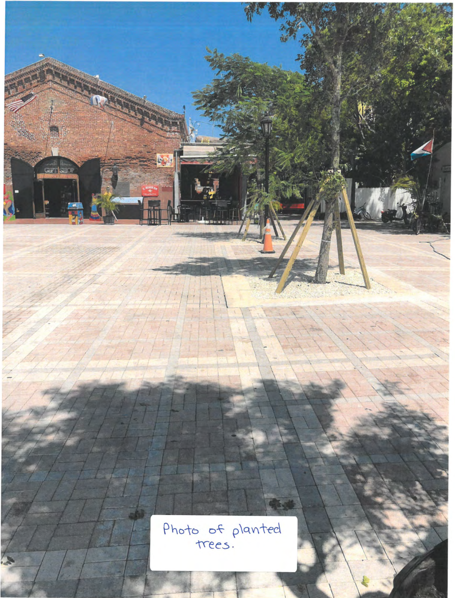
Photo of planted trees.