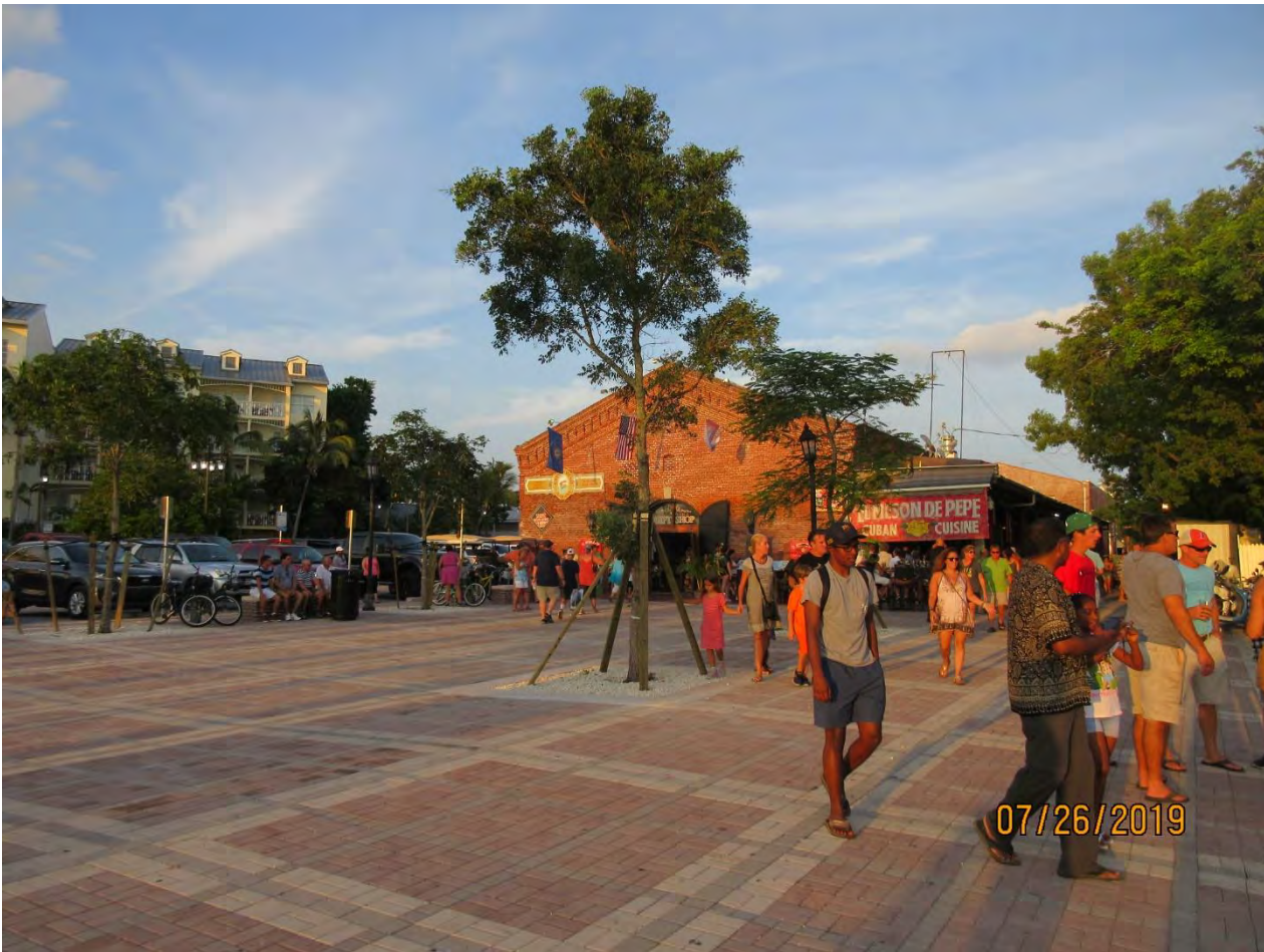
Photo of planted tree area view 3 during sunset celebration.