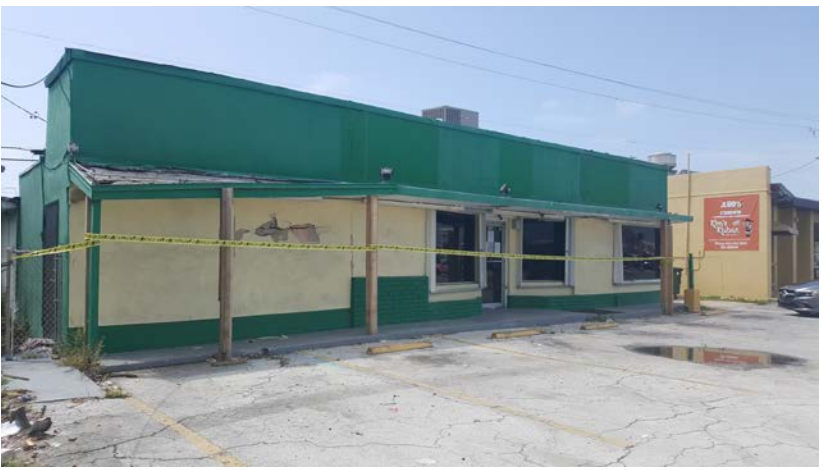
Image of the existing, damaged structure, with yellow "caution" tape wrapped around it.

The commercial structure was heavily damaged on December 28, 2018 when an automobile traveling east on North Roosevelt Boulevard went over the curb and into the parking lot of the subject property. The vehicle collided with a boat parked in the lot, knocking it off its trailer and into the structure. On May 2, 2019, the Chief Building Official for the City of Key West declared the structure unsafe and not habitable.