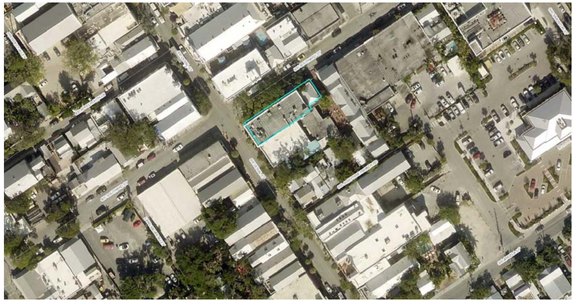
Image of an aerial of the subject property and neighboring properties.