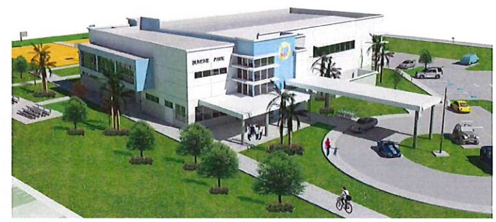
BIRDSEYE VIEW FROM NORTH EAST