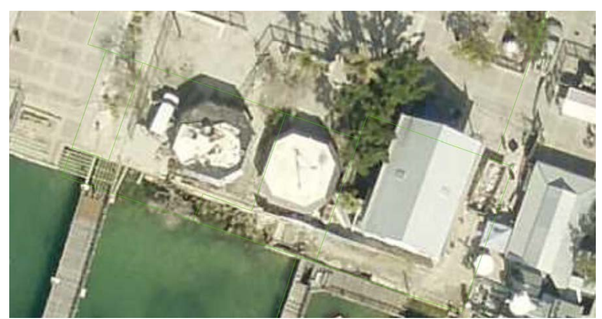
Aerial of the subject properties