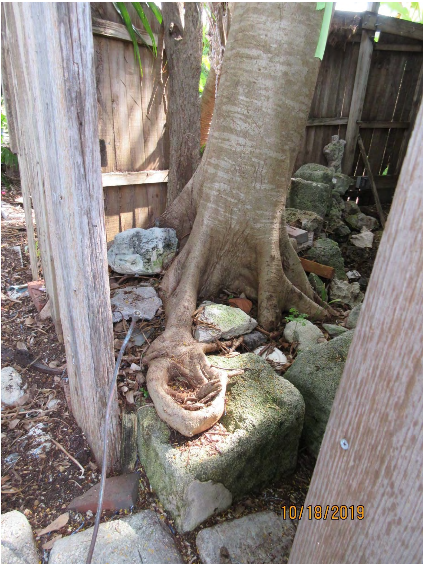
Photo of tree trunk, view 6.