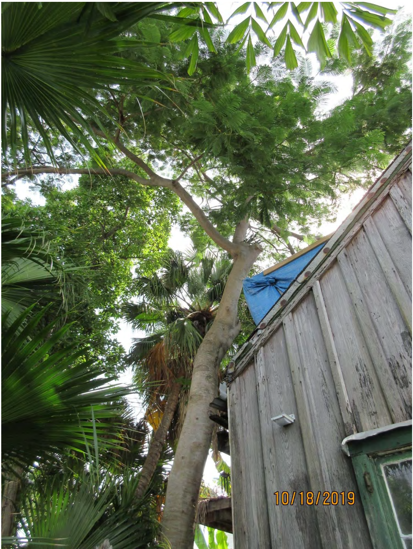
Photo of tree trunk close to structure.