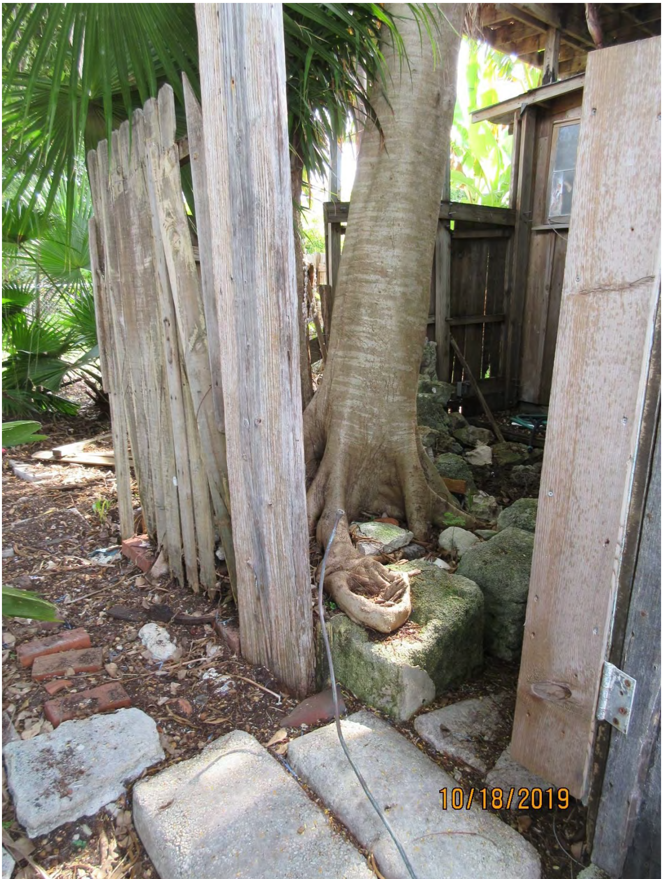
Photo of tree trunk, view 2.