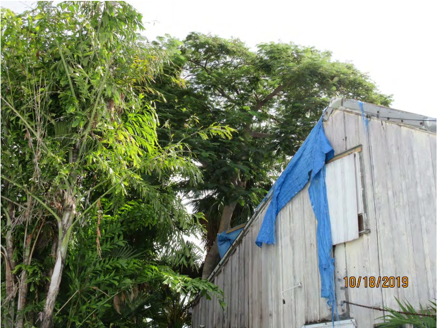
Photo of entire canopy.