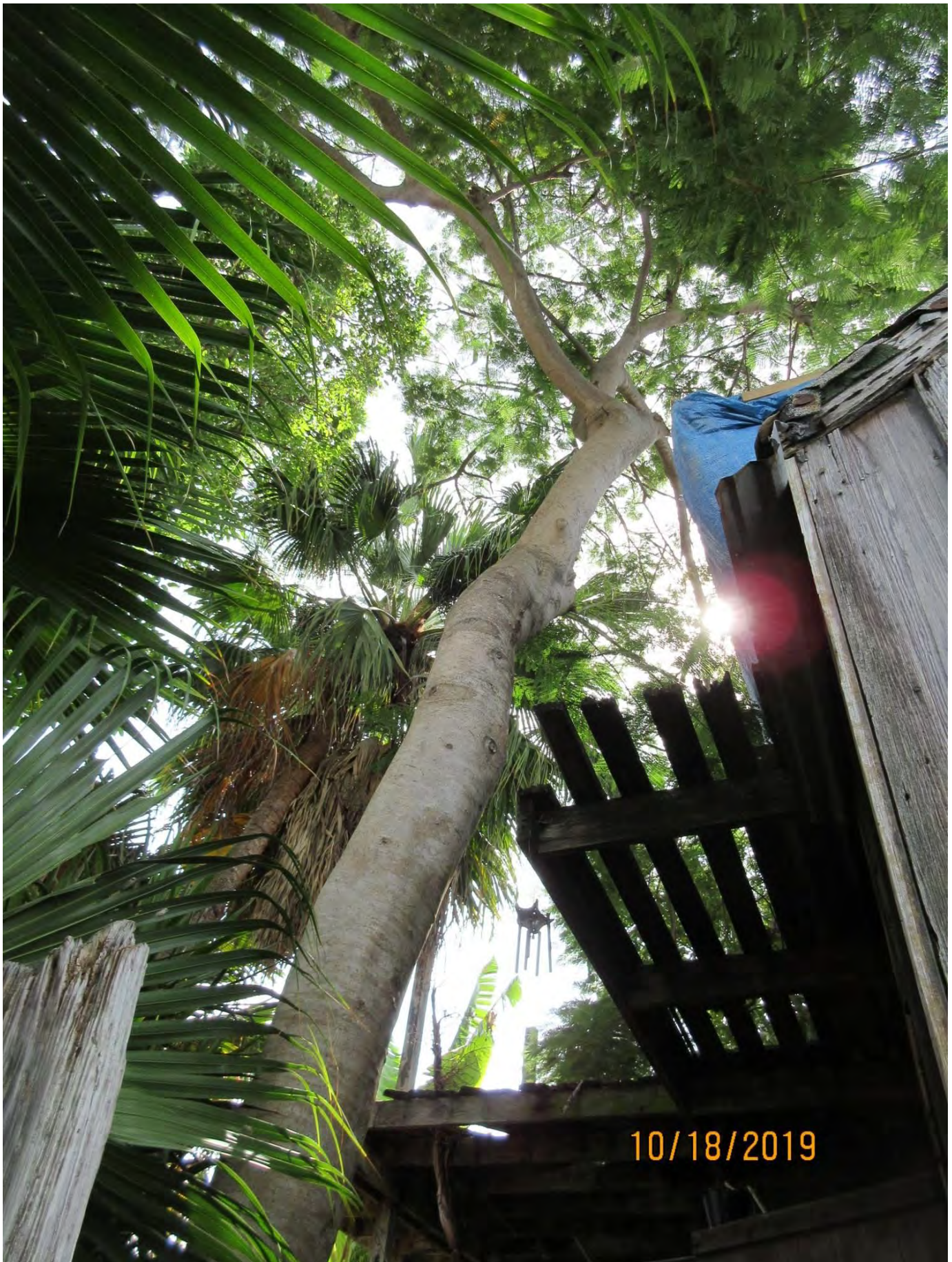
Photo of tree trunk, view 3.