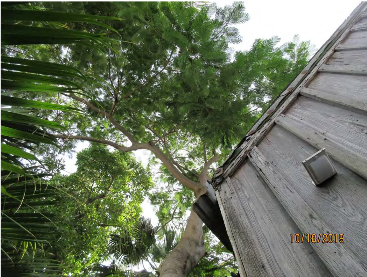
Two photos of tree canopy.