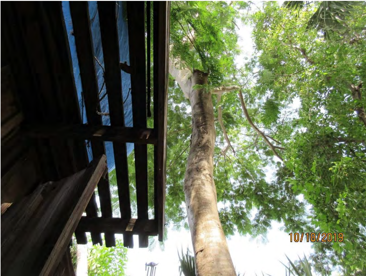
Photo of tree trunk, view 5.