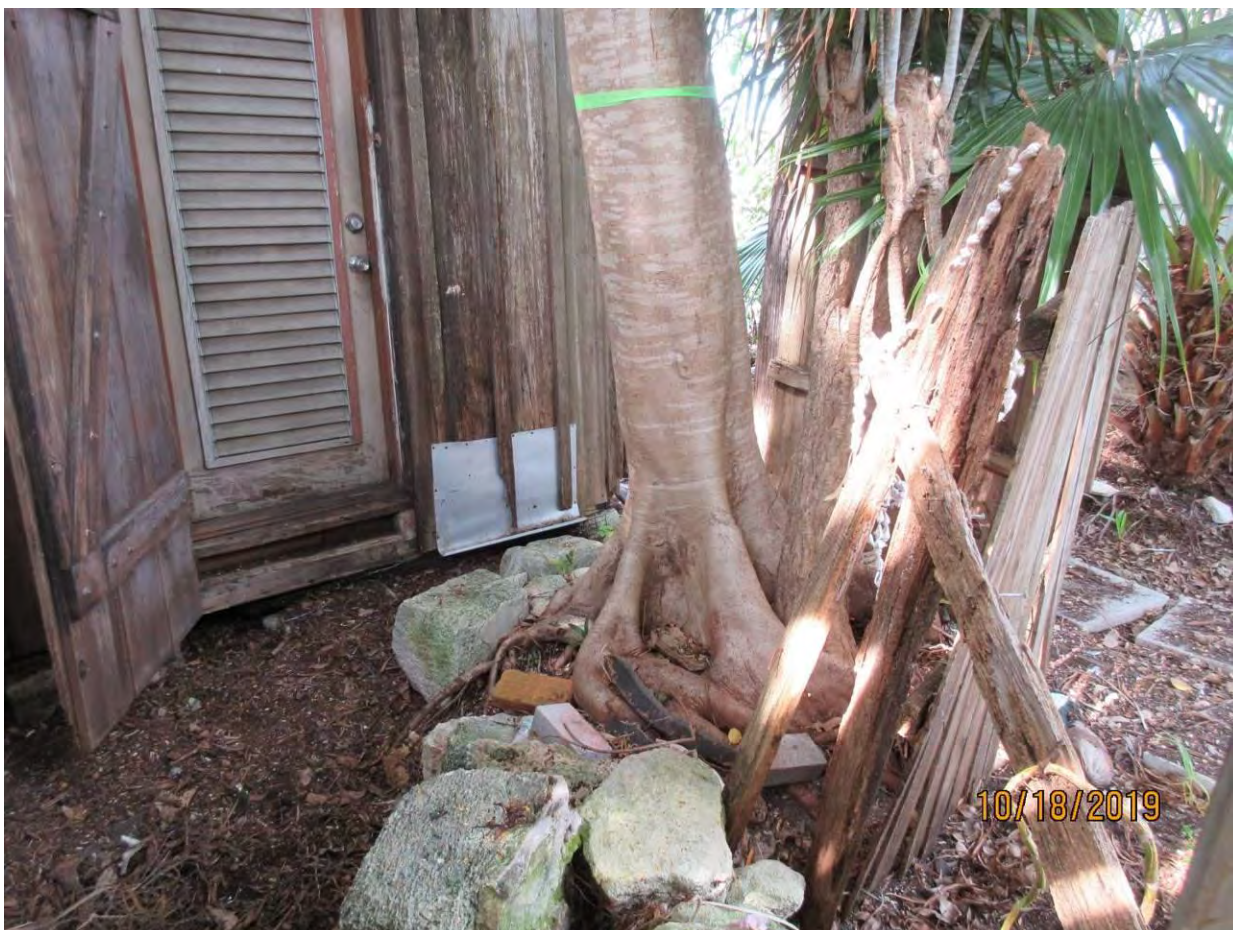
Photo of tree trunk, view 8.