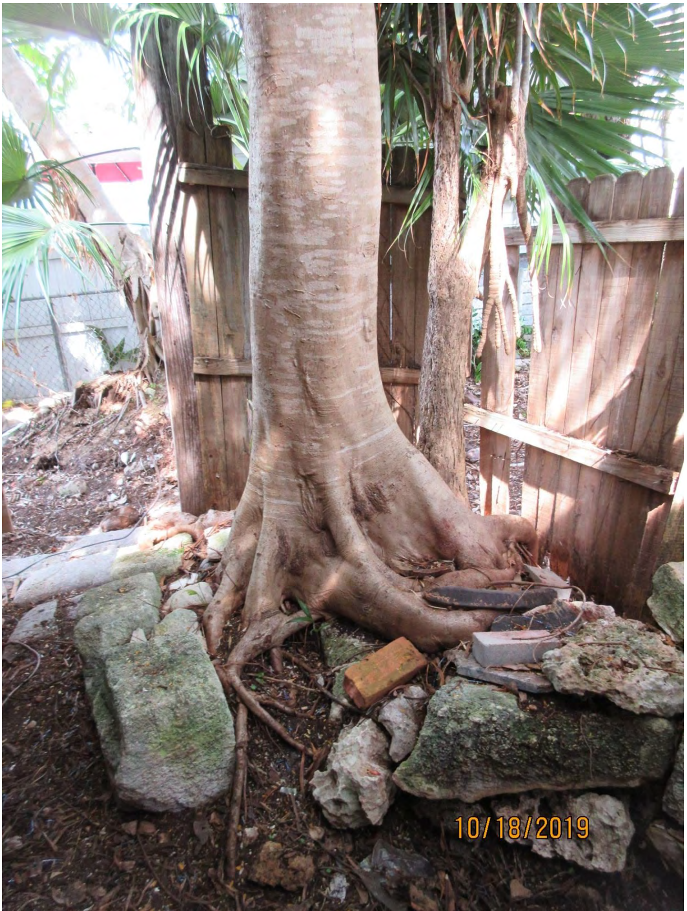
Photo of tree trunk, view 4. Note base of tree growing on soil and rock pile.