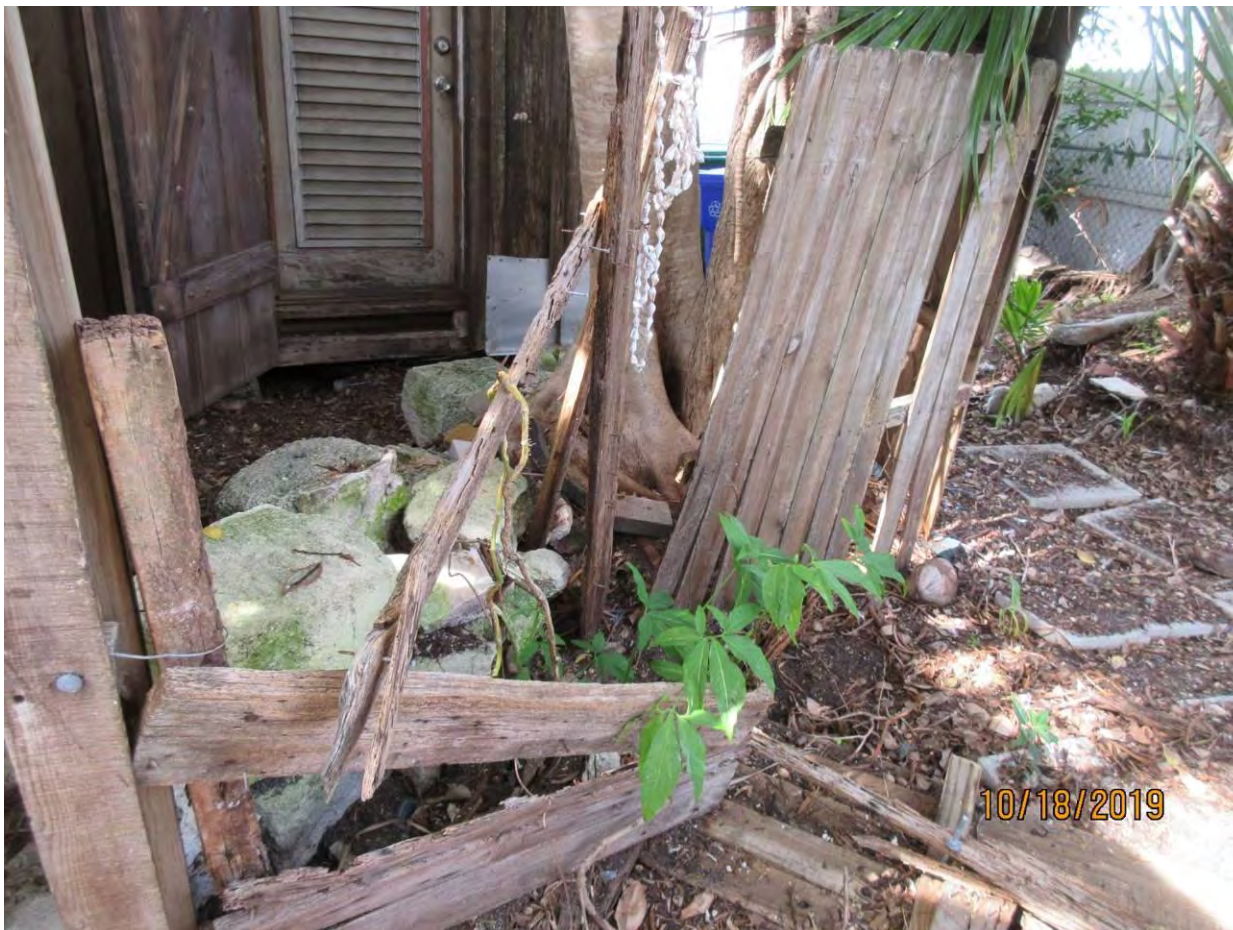
Photo of tree trunk view 7.