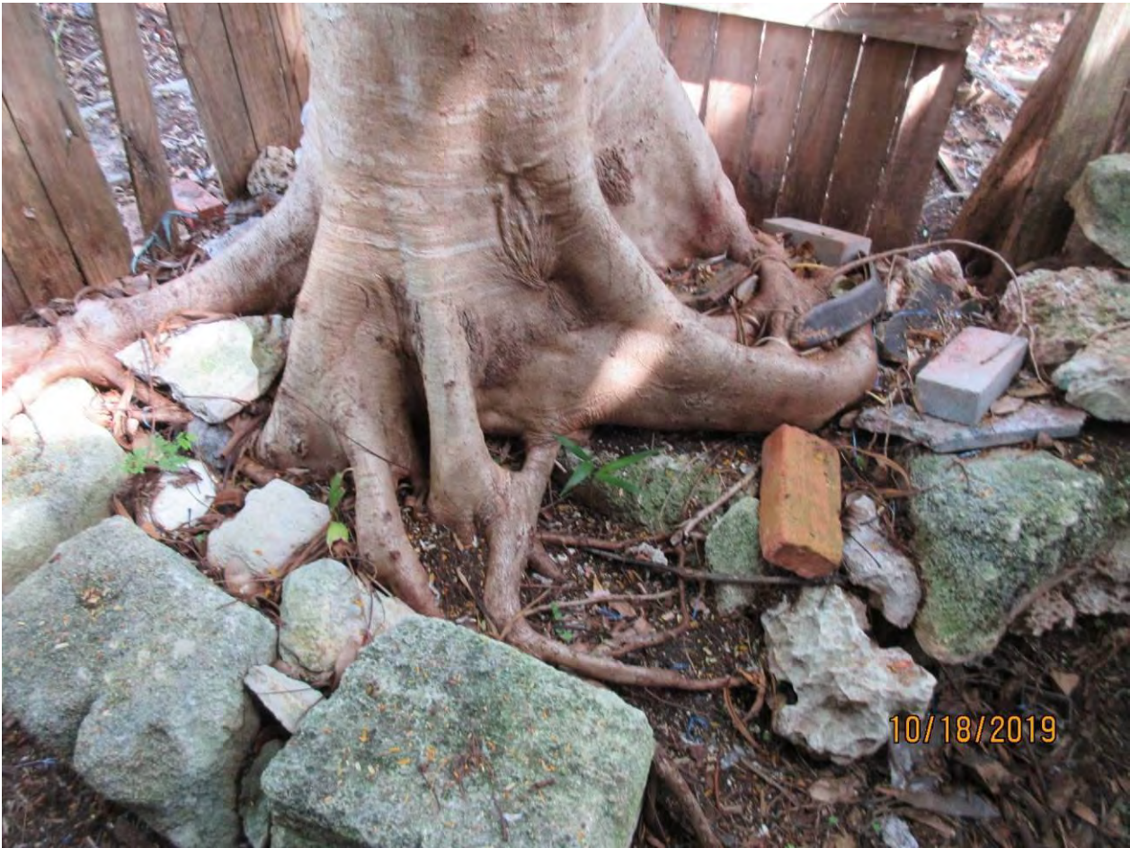
Photo of base of tree, view 1.