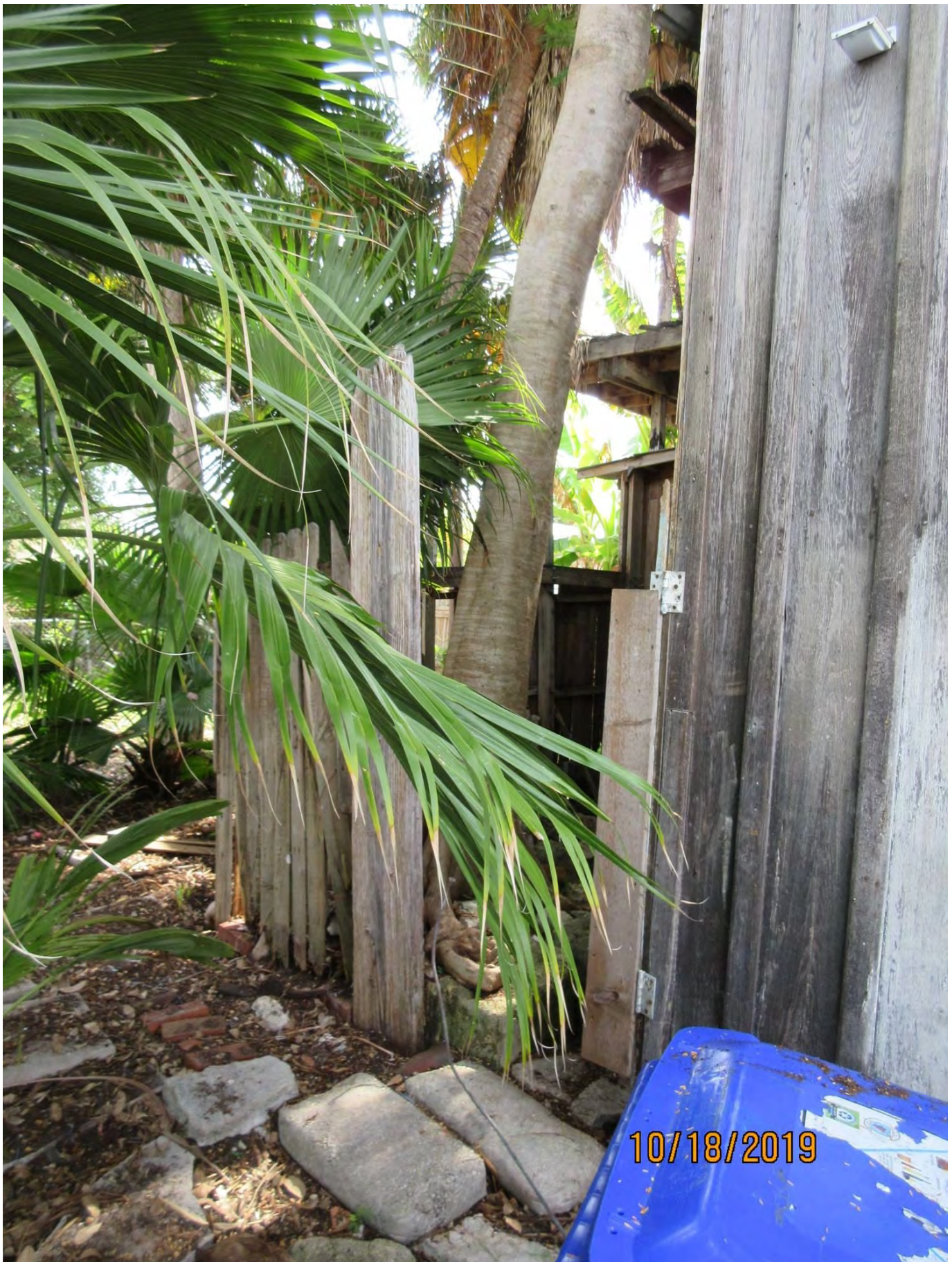
Photo of tree trunk, view 1.