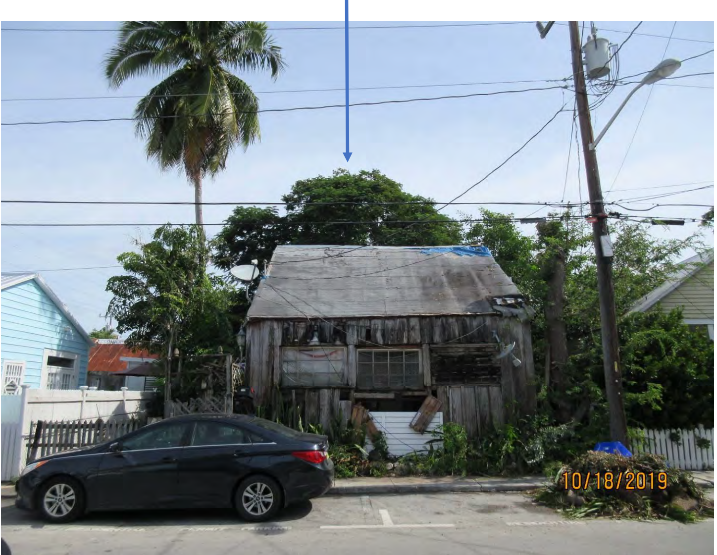
Photo showing tree location.

Tree Species: Royal Poinciana ( Delonix regia )