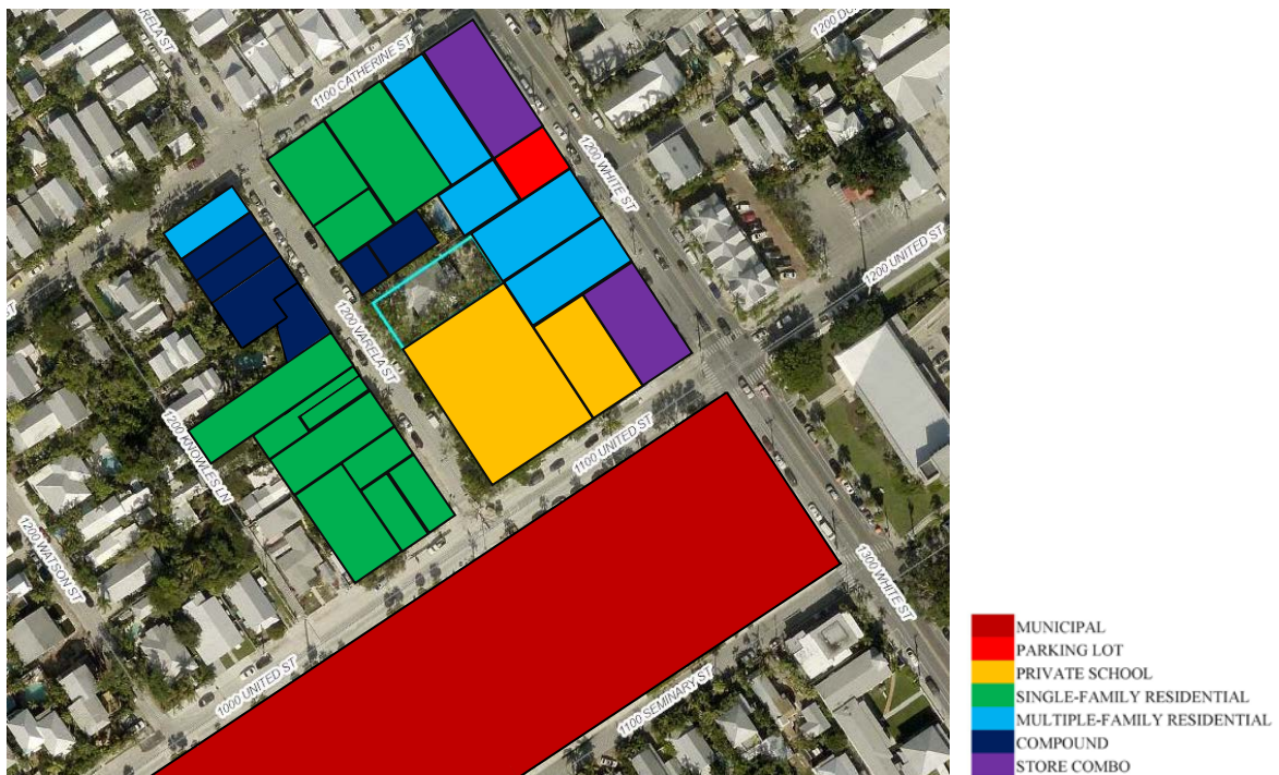
Image of an aerial view of the subject property with the surrounding uses identified.

North: Residential South: Business and professional offices (City of Key West City Hall) West: Residential East: Mixed-use commercial & residential, residential