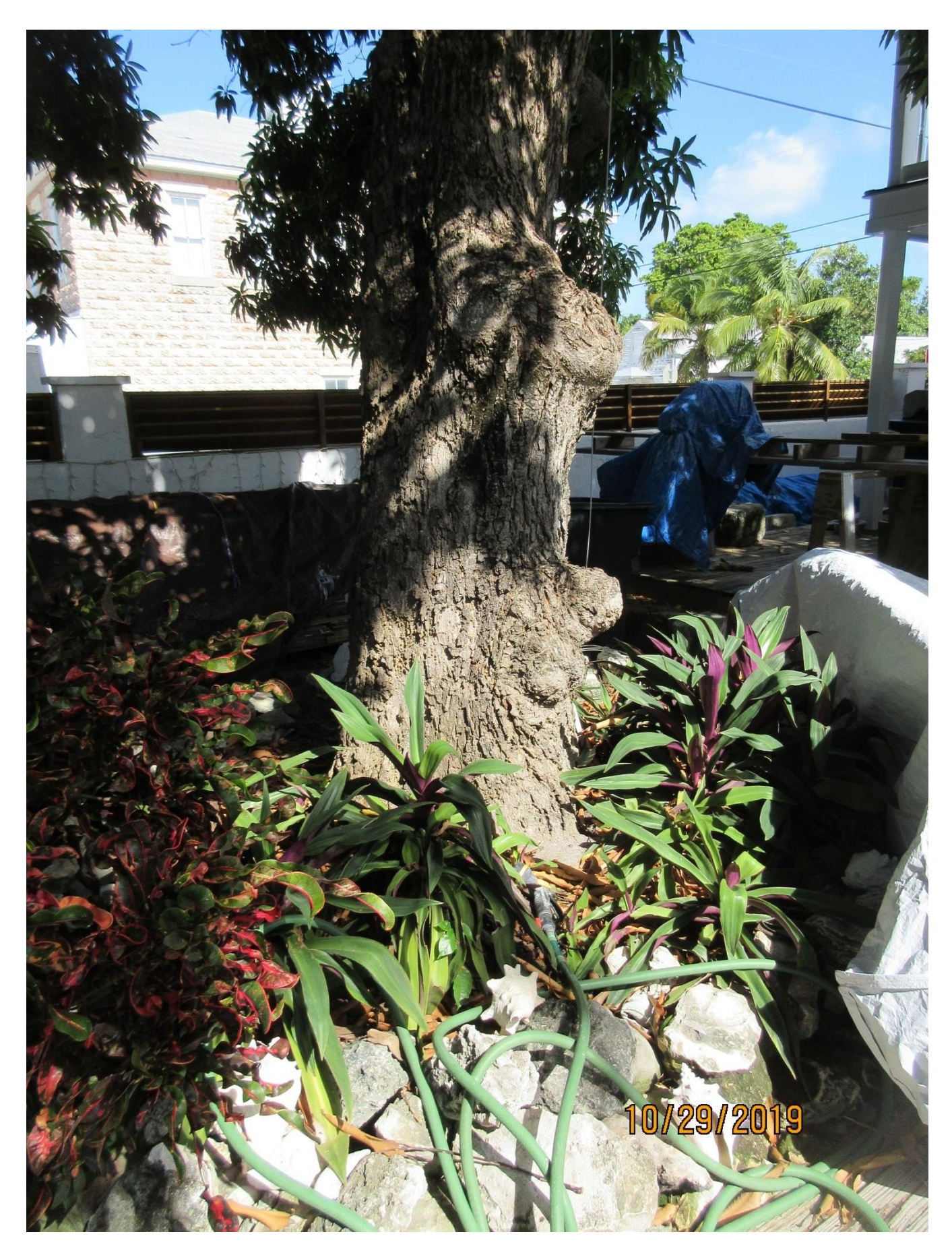
Looking at base and trunk of tree.