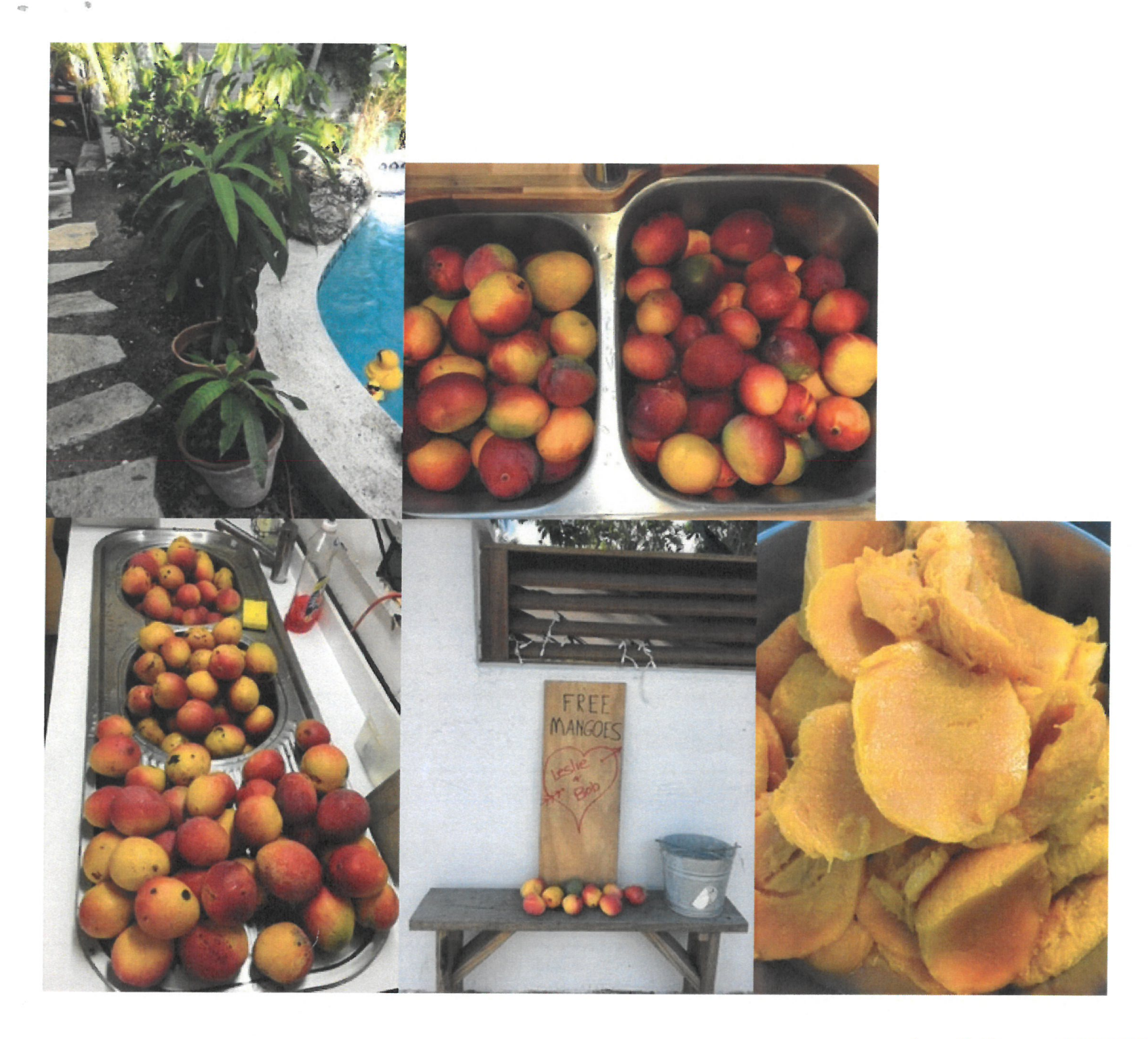
we give away most of the mangos