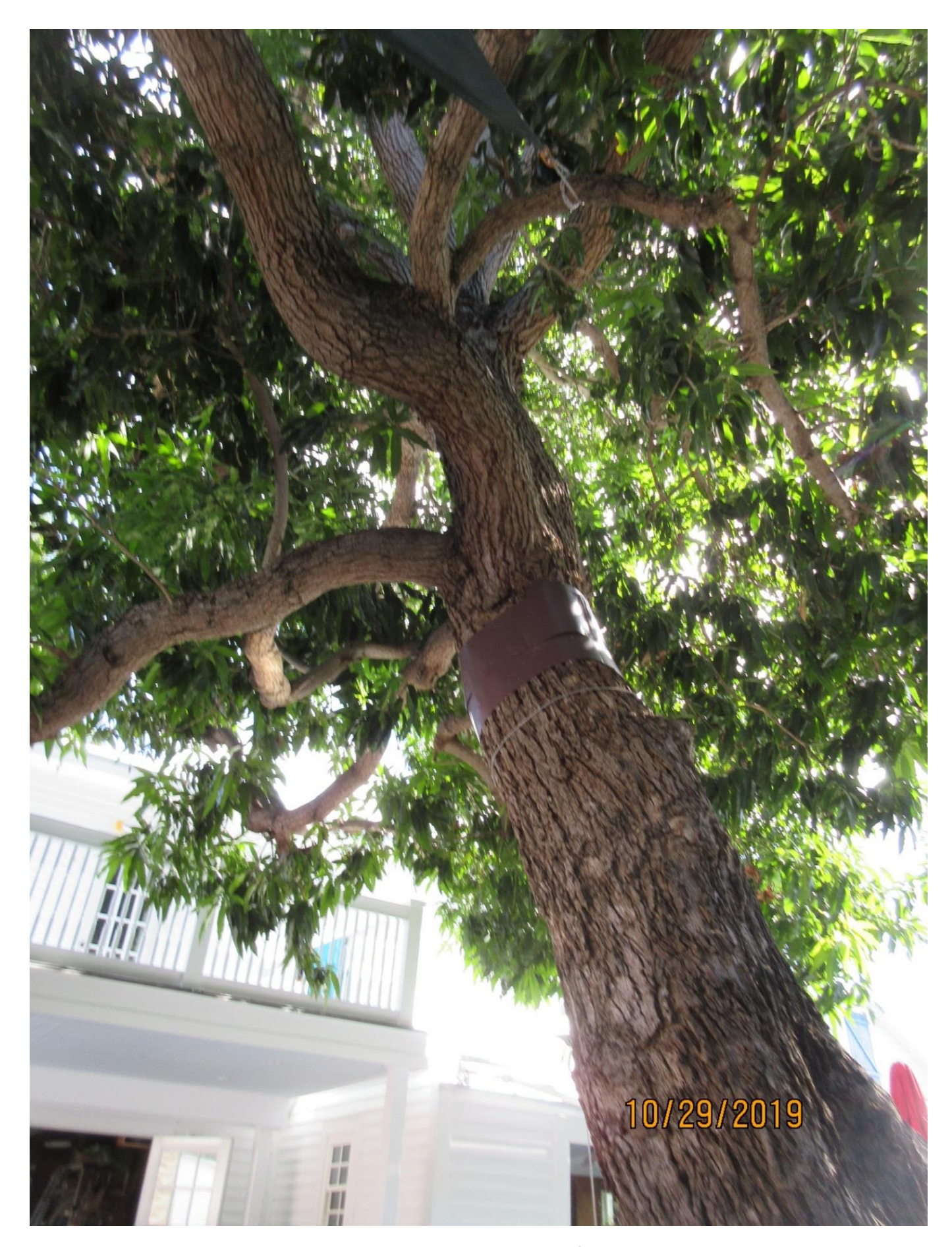
Looking at trunk and interior canopy of tree.