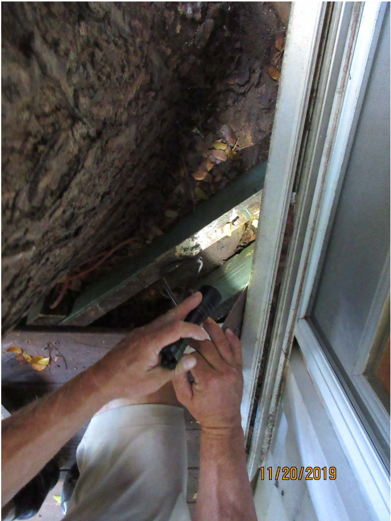
Photo of base of tree under deck boards showing tree roots, view 1.