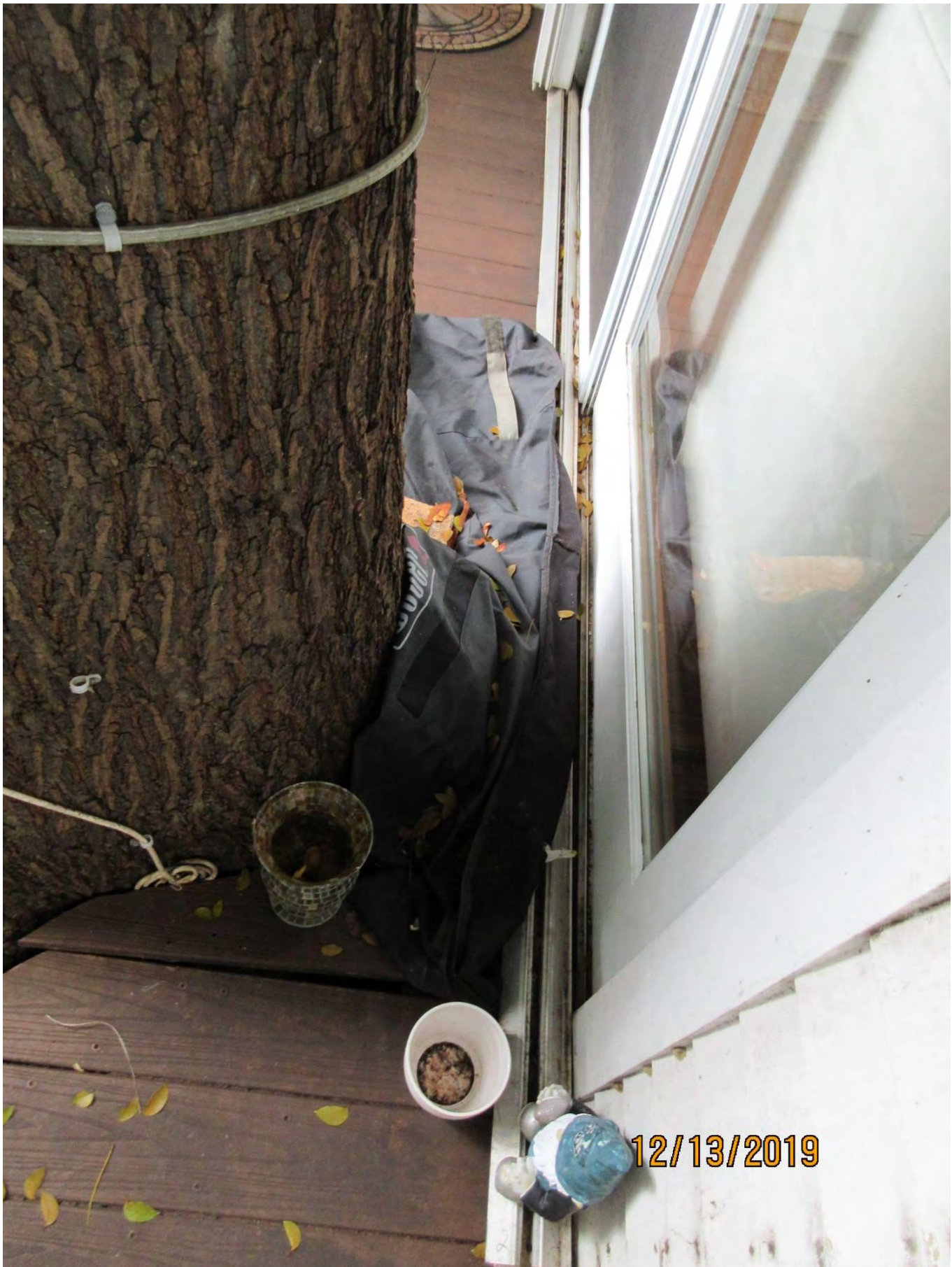
Photo showing distance between base of tree and house wall.