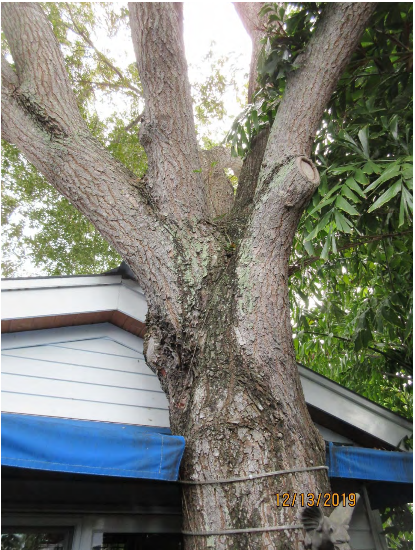
Photo of tree trunk and main branches.