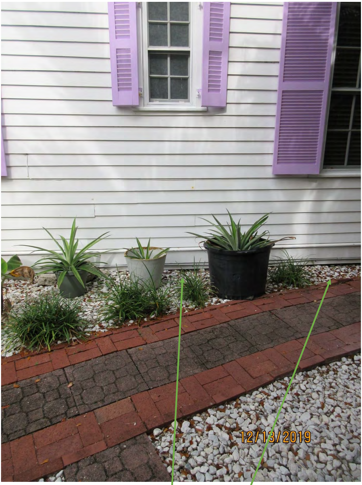
Standing in front yard, photo showing where tree roots are growing from under house, view 2.