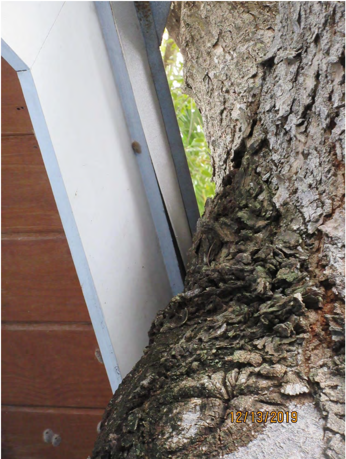
Close up photo of tree trunk and roof eve damage area, view 2.