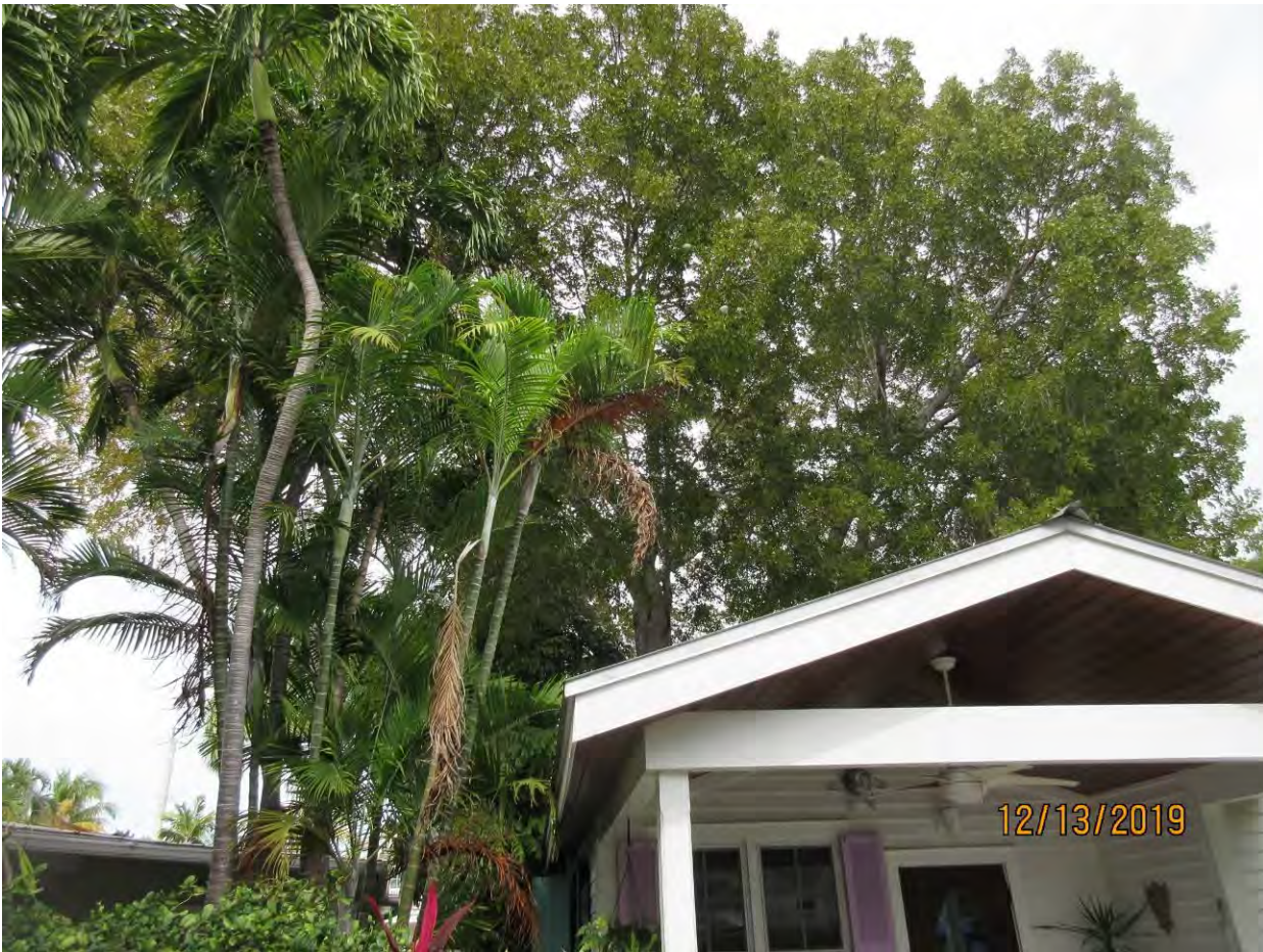
Standing in front of the house, two photos showing canopy of tree, view 1.