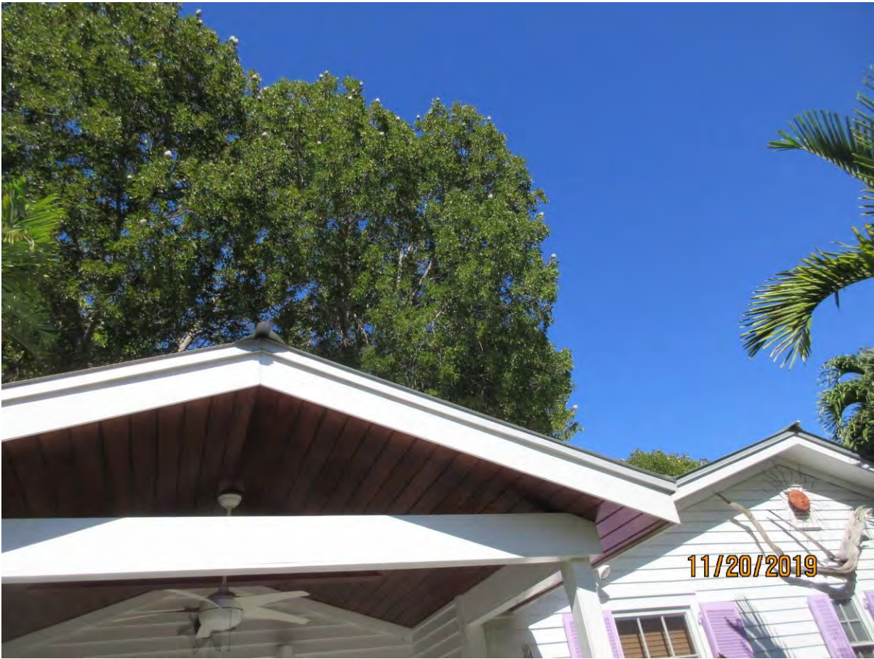
Standing in front of the house, one additional photo of the tree canopy, view 3.