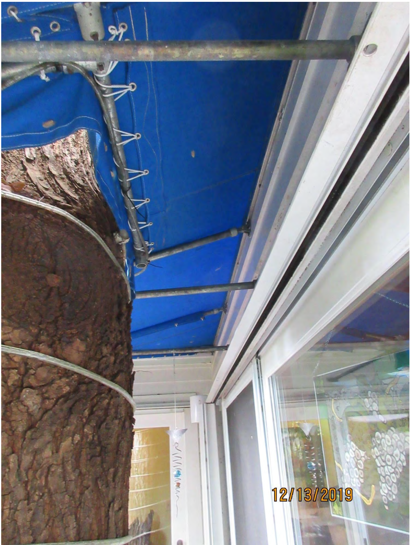
Photo showing distance between tree trunk and house wall.