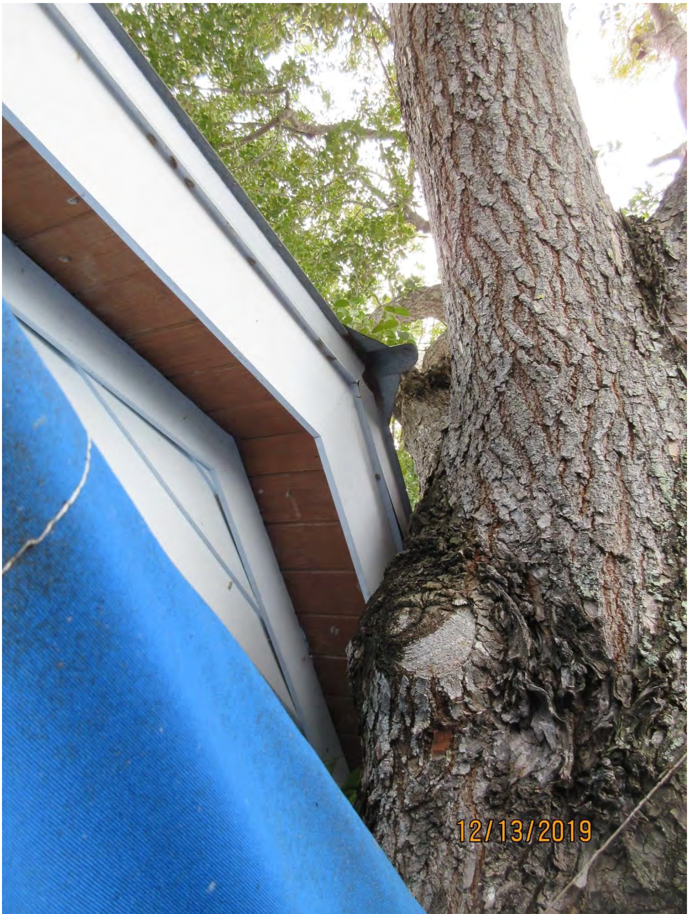
Photo of tree trunk and roof eve damage area, view 2.