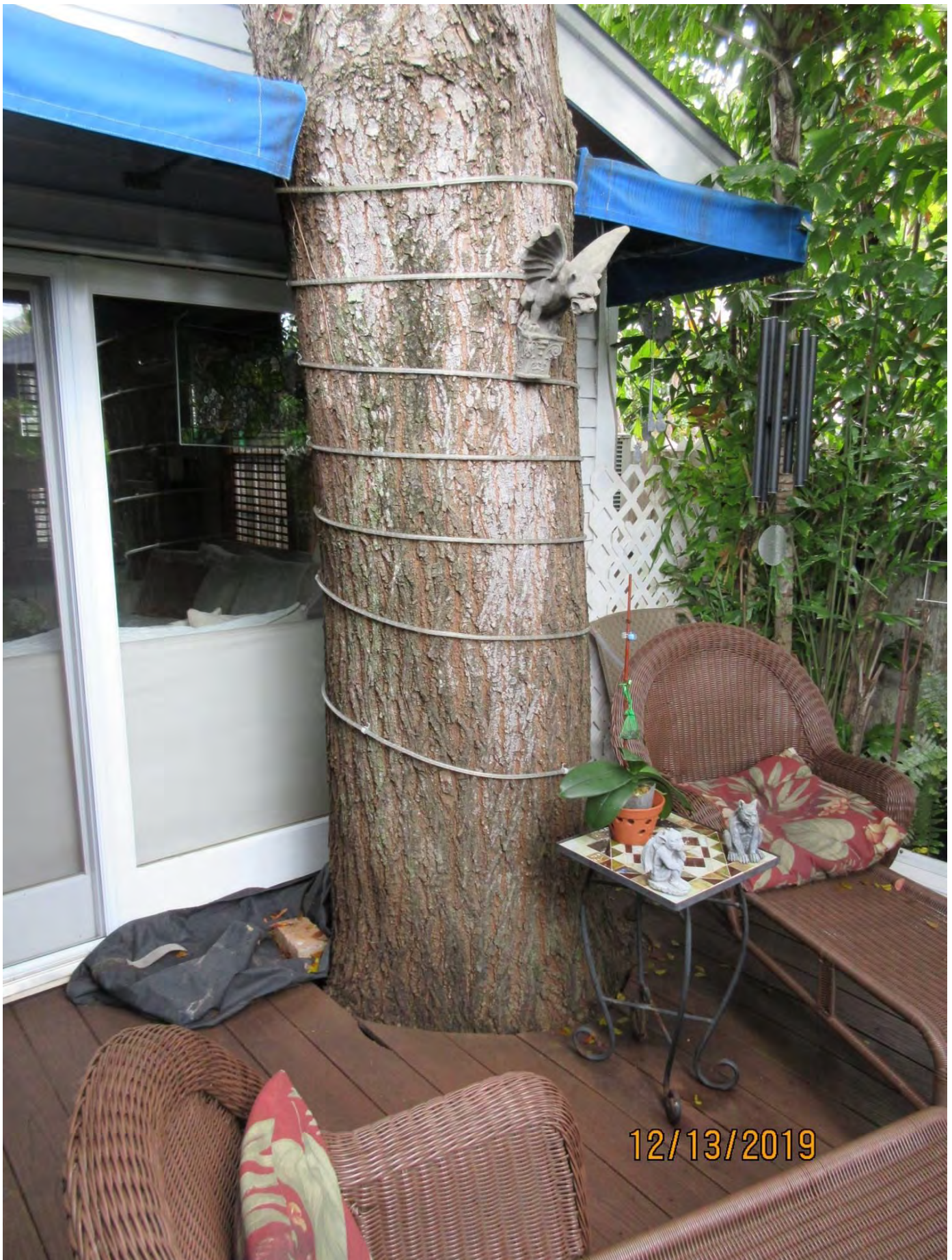
Photo of base of tree and trunk, view 2.