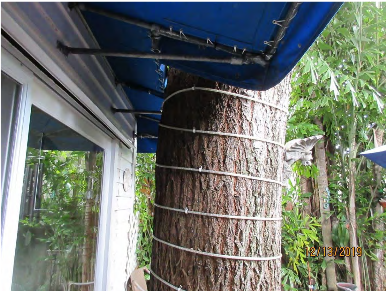
Photo showing tree trunk and location related to wall of house.