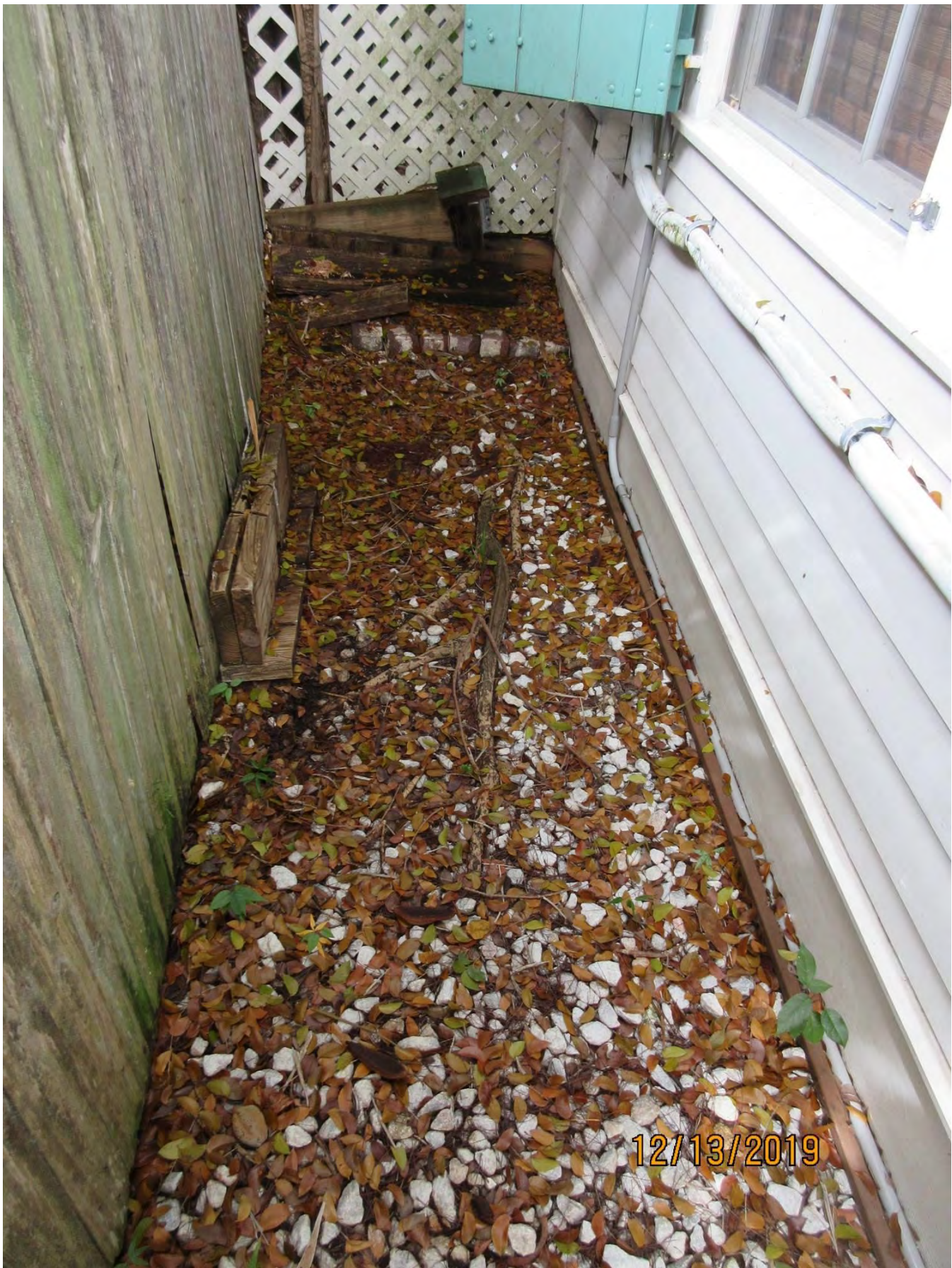
Standing on the left side of the house, photos shows roots from mahogany tree.