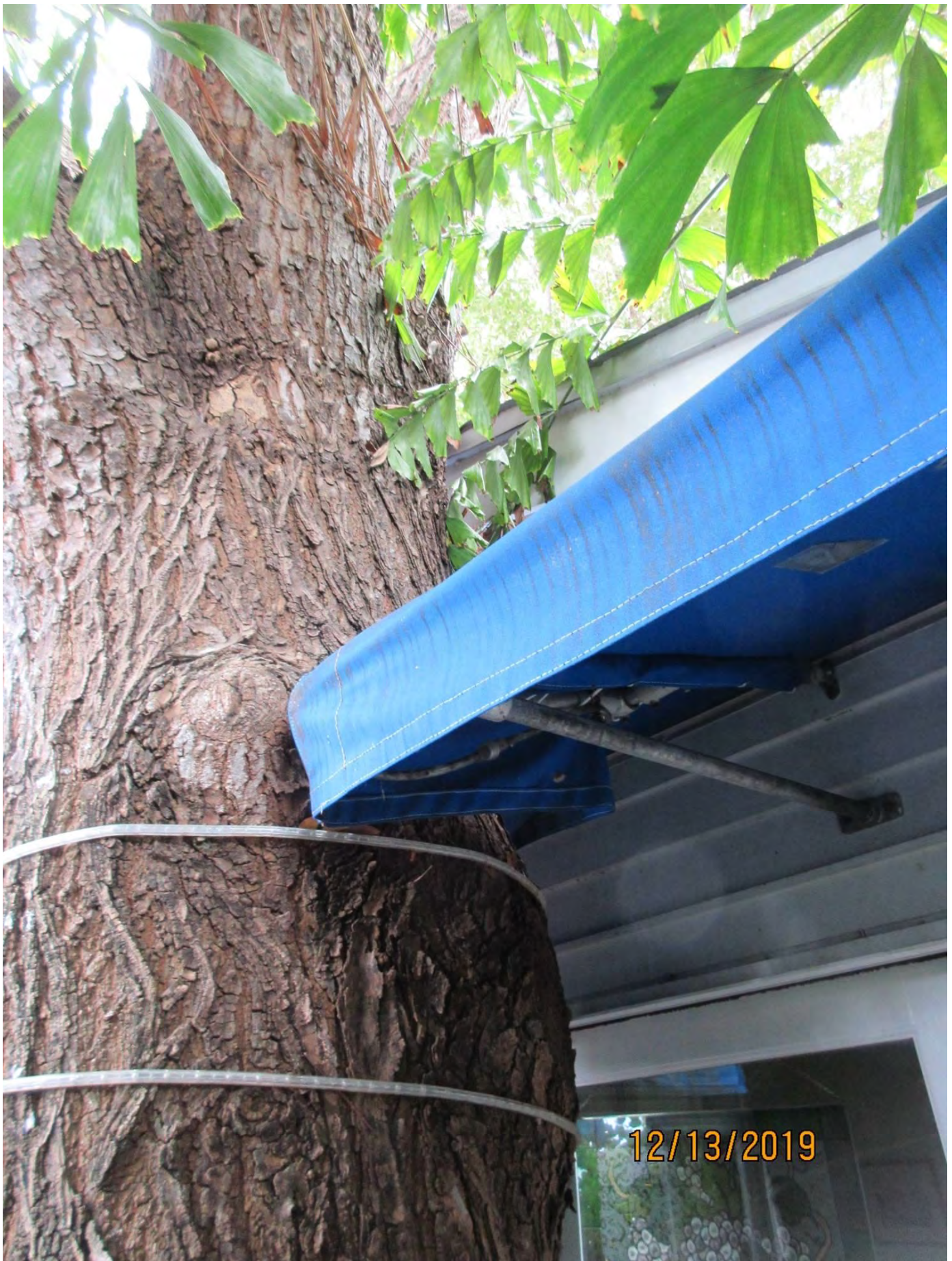
Photo of tree trunk and roof eve damage area, view 1.