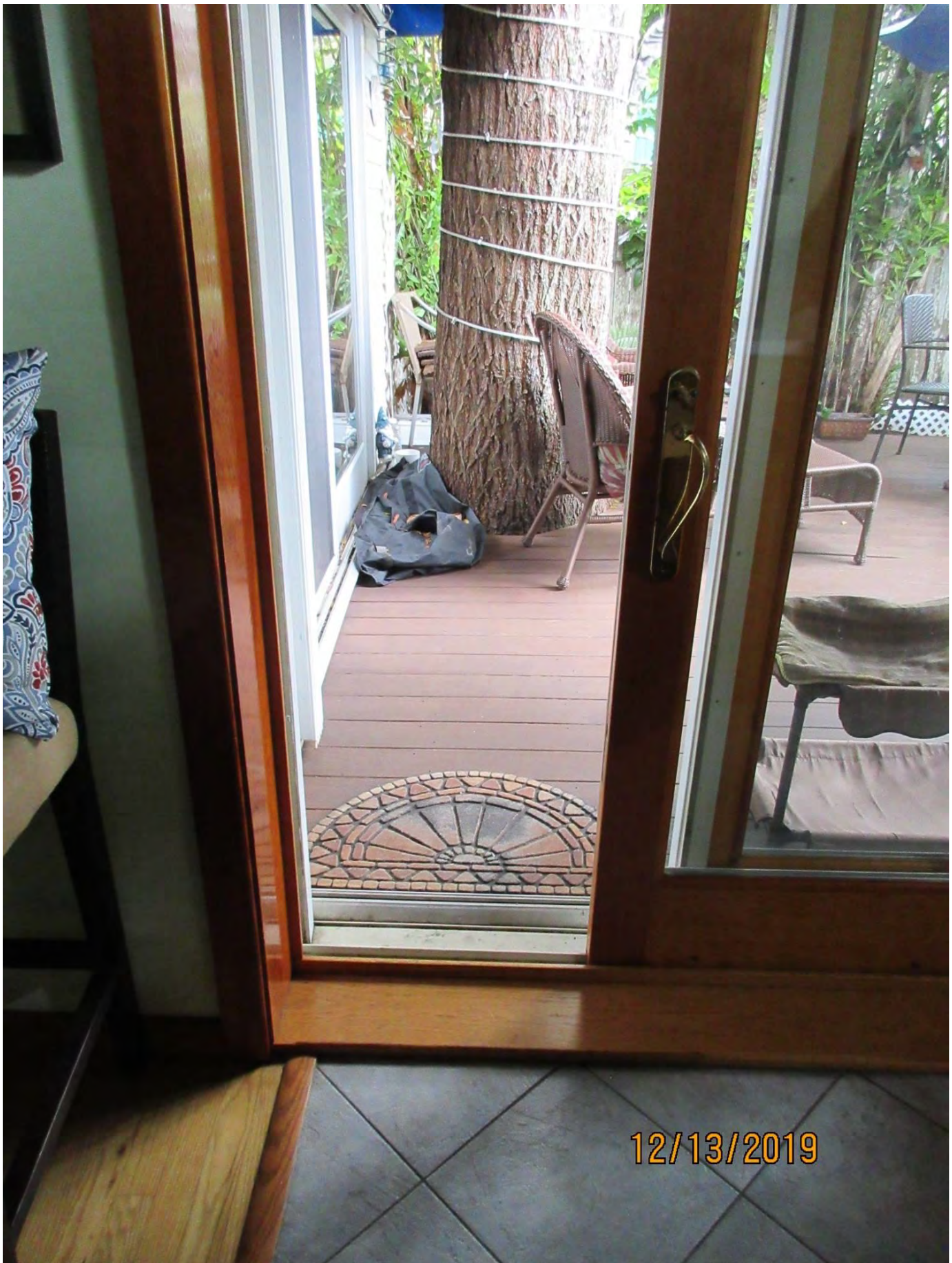
Standing in kitchen area, photos looking at base of tree and trunk.