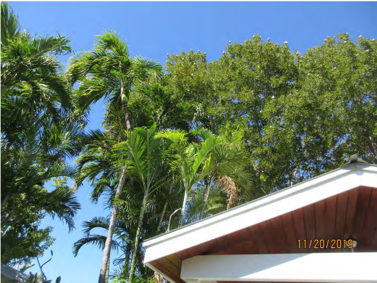
Standing in front of the house, two additional photos of the tree canopy, view 2.