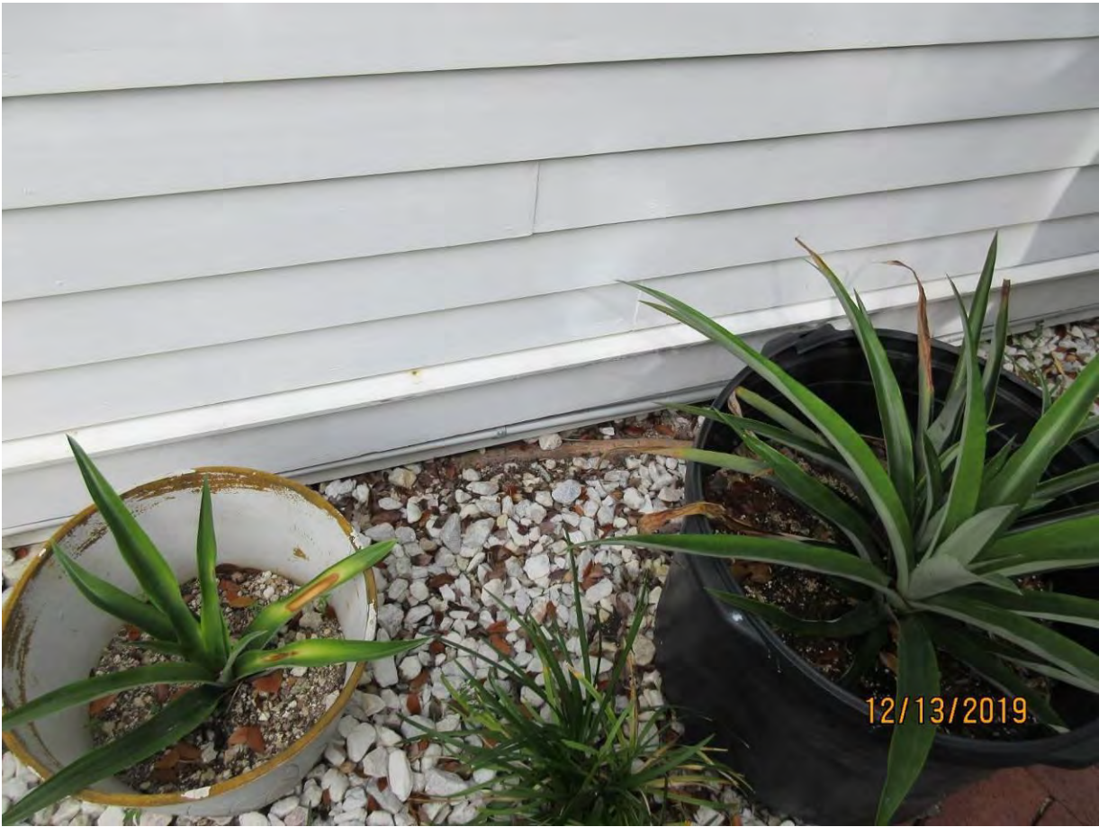
Standing in front yard, photo showing tree roots growing from under house, view 1.