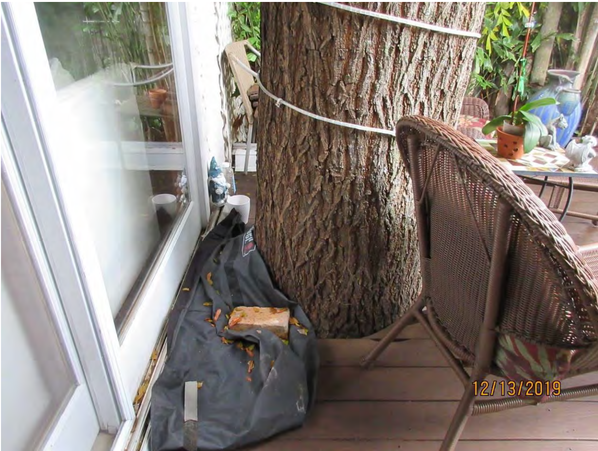
Photo showing base of tree next to sliding glass doors/house wall.