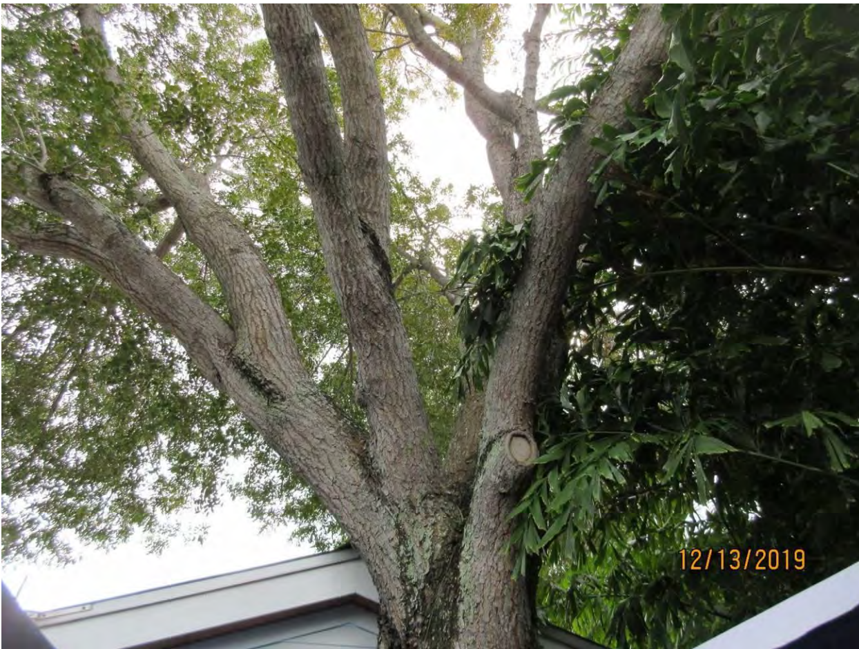
Photos of tree canopy from rear deck area.