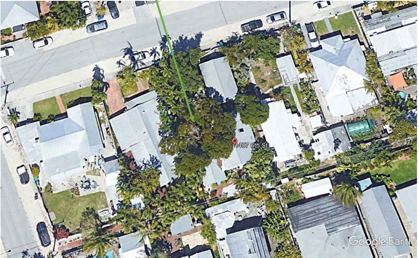
Aerial photo showing tree location.

Tree Species: Mahogany (Swietenia mahagoni)