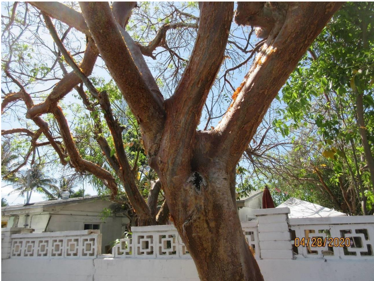
Photo showing crotch of tree, view 1.