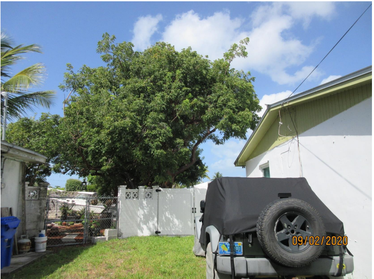
Photo showing location of Gumbo Limbo tree on property.