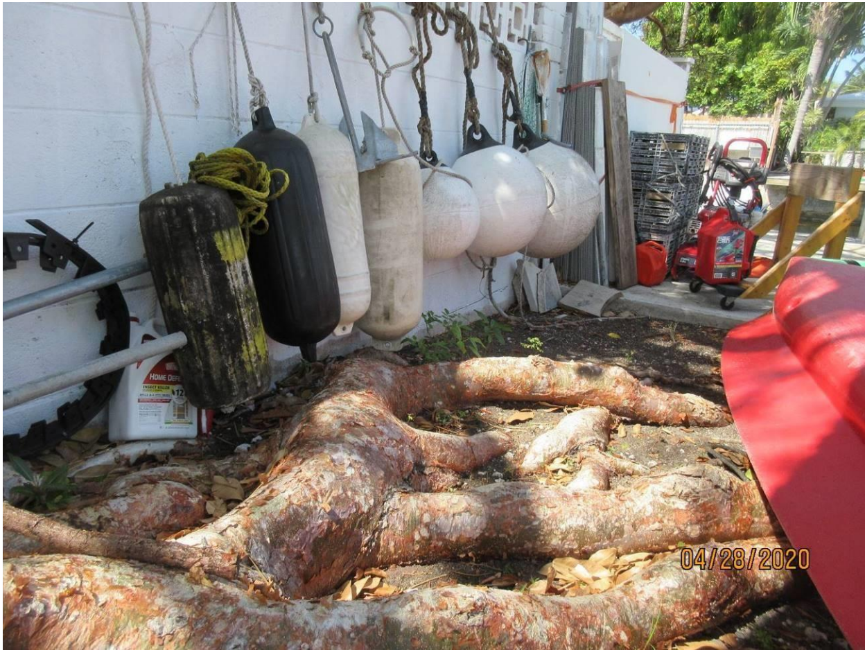
Photo showing surface roots and property line wall, view 2.