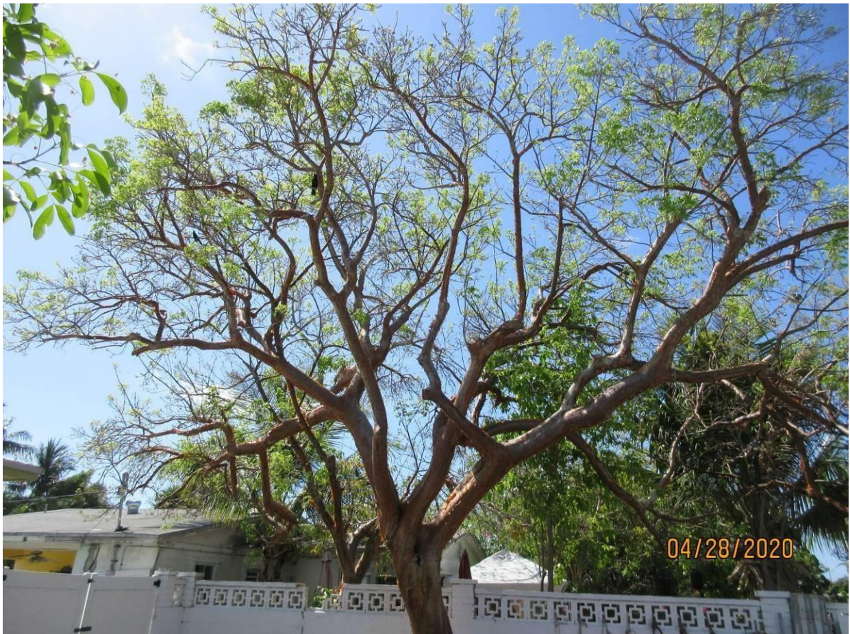
Photo showing tree canopy.