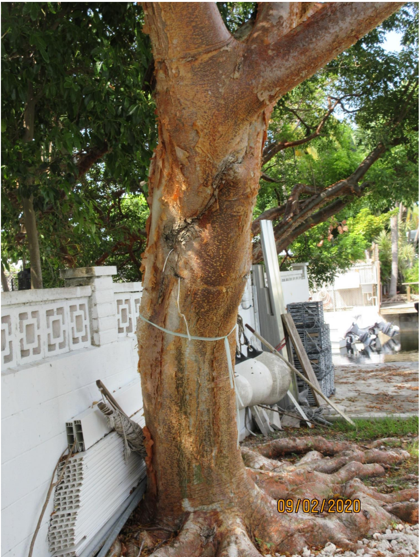
Photo showing base, trunk and crotch of tree.