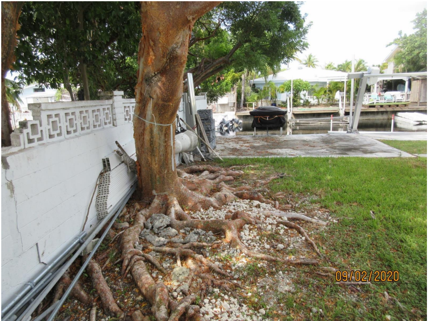
Photo showing base of tree and surface roots.