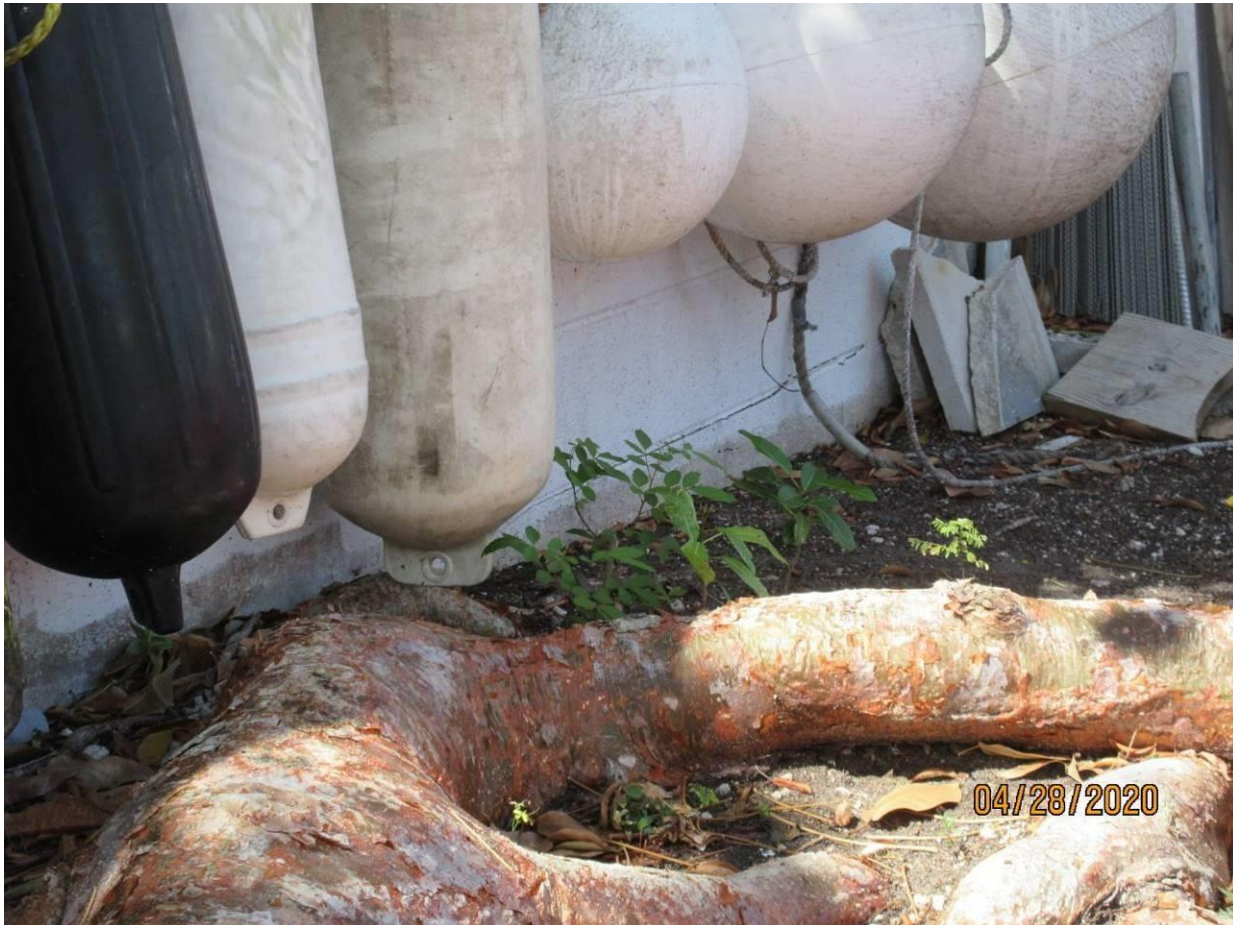
Photo showing surface roots and property line wall, view 3.