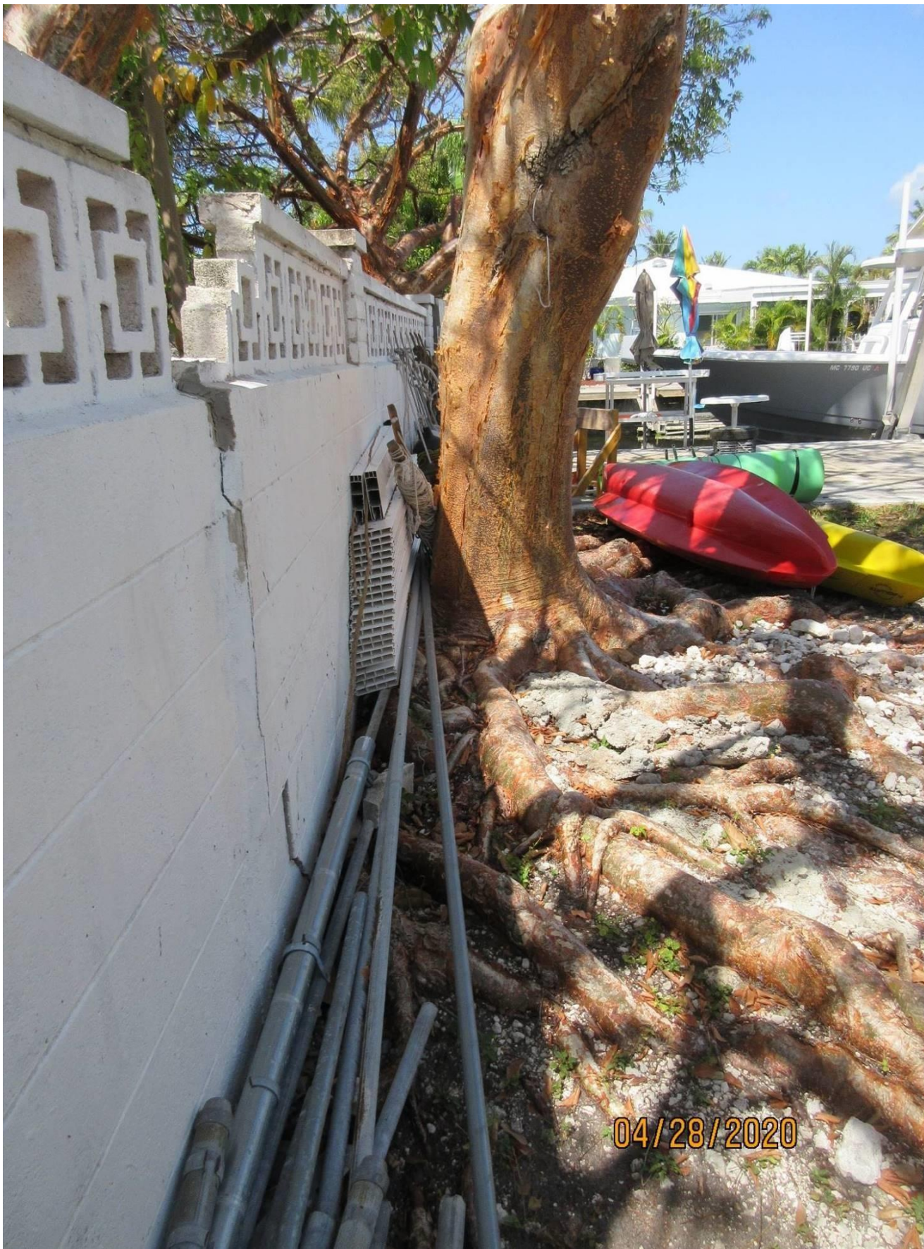
Photo showing base and trunk of Gumbo Limbo tree. Note the extensive surface roots.