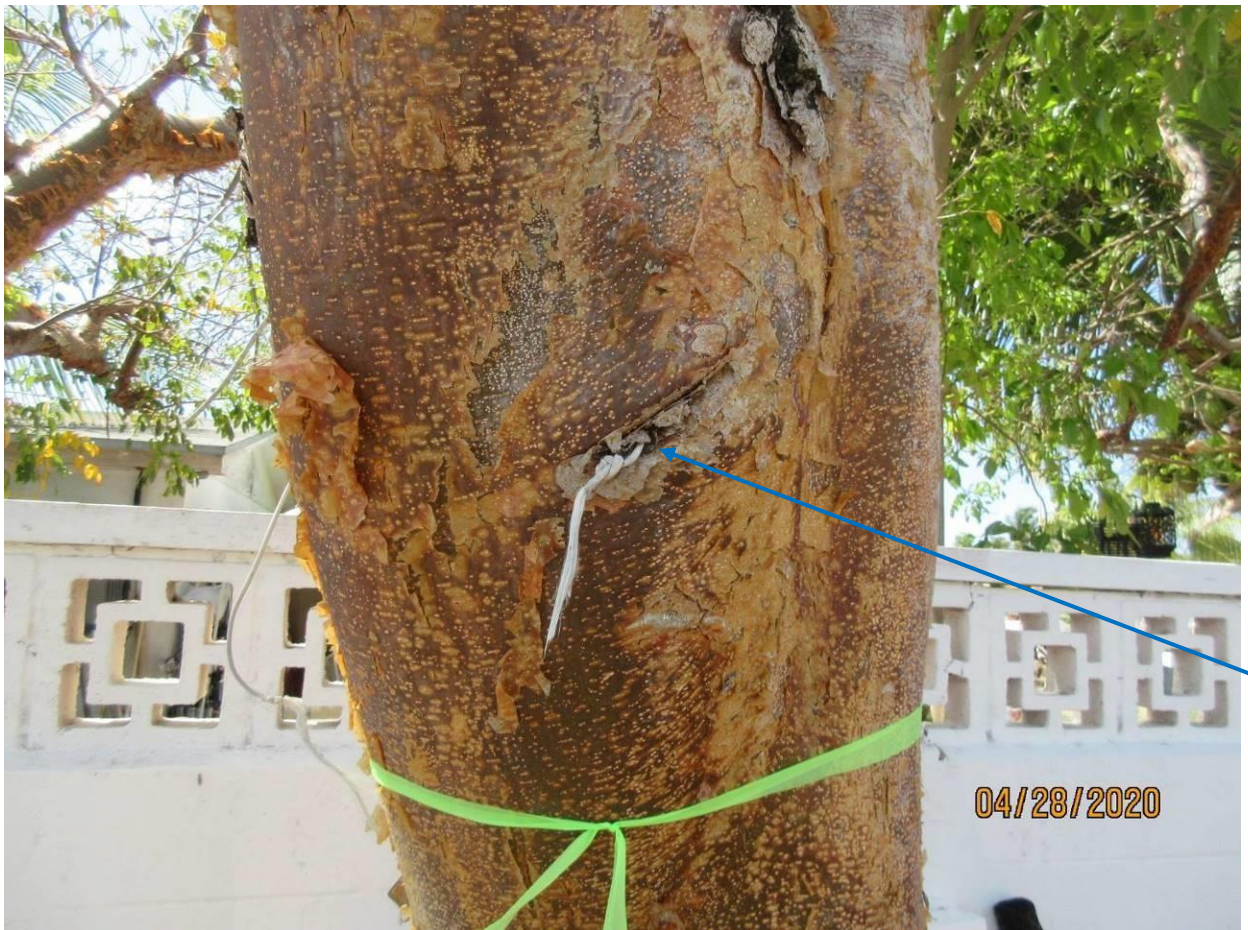
Photo showing tree trunk just below crotch, view 1.