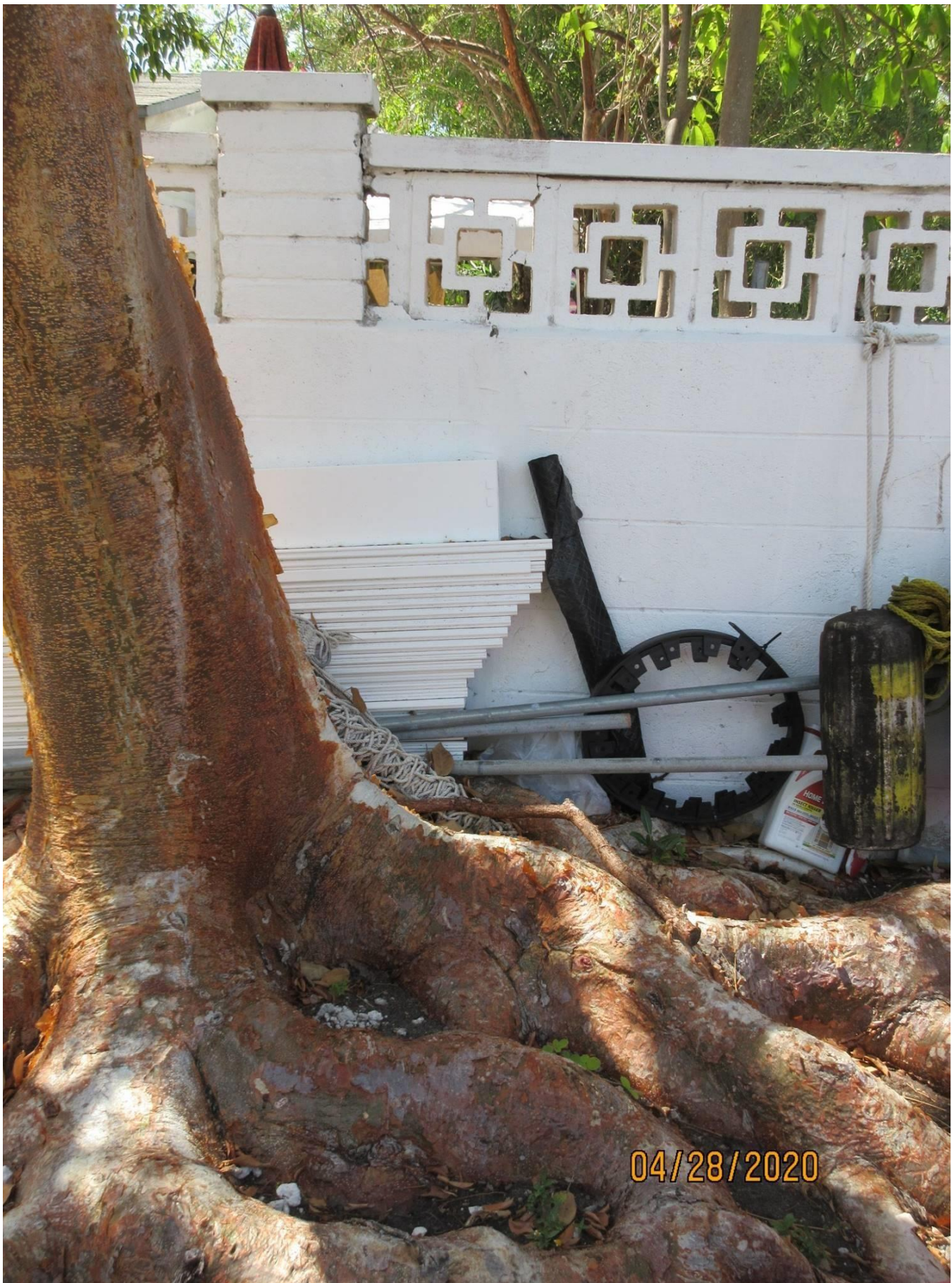
Photo showing base of tree, surface roots and property line wall.