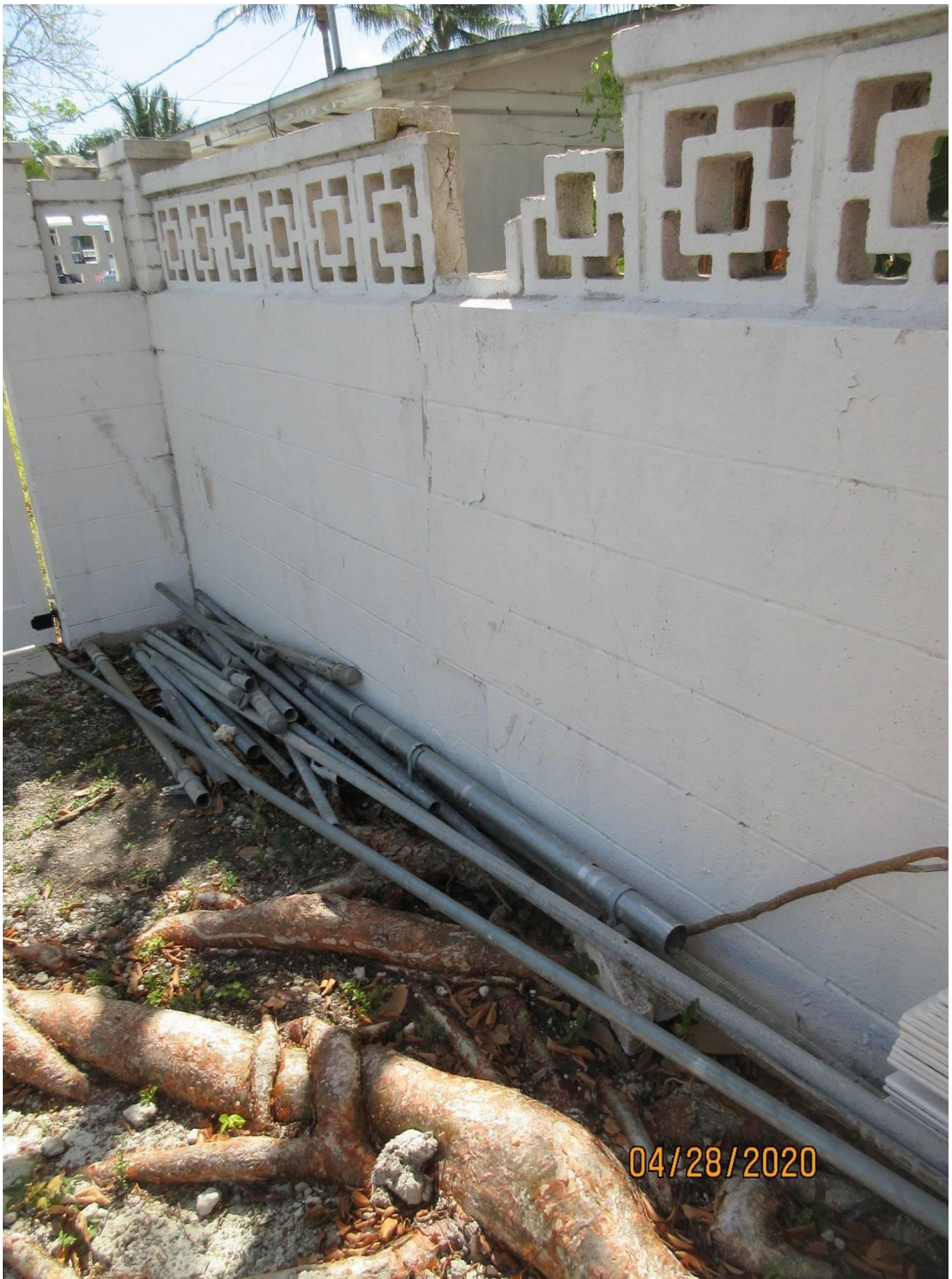
Photo showing surface roots and property line wall, view 1.