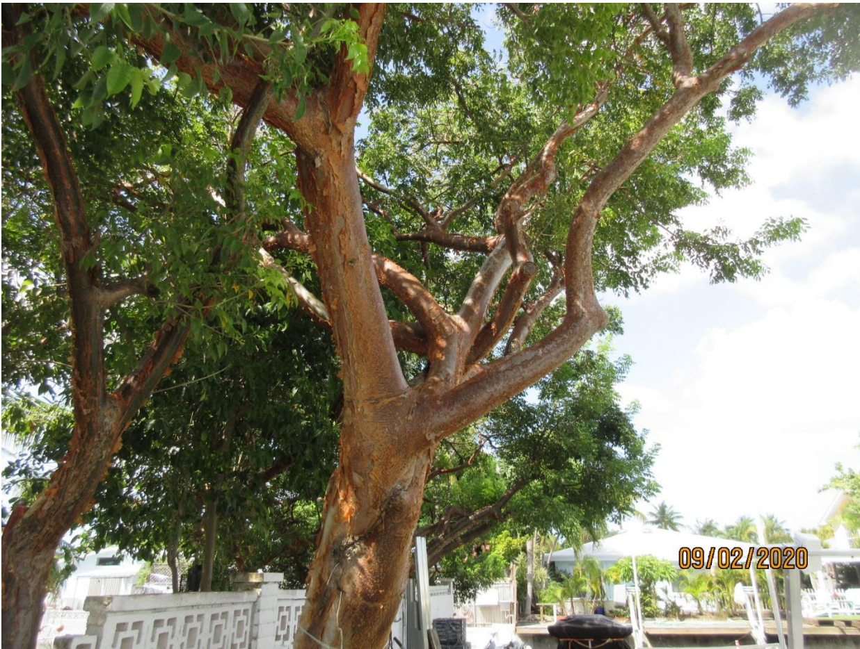
Photo showing tree trunk and canopy.