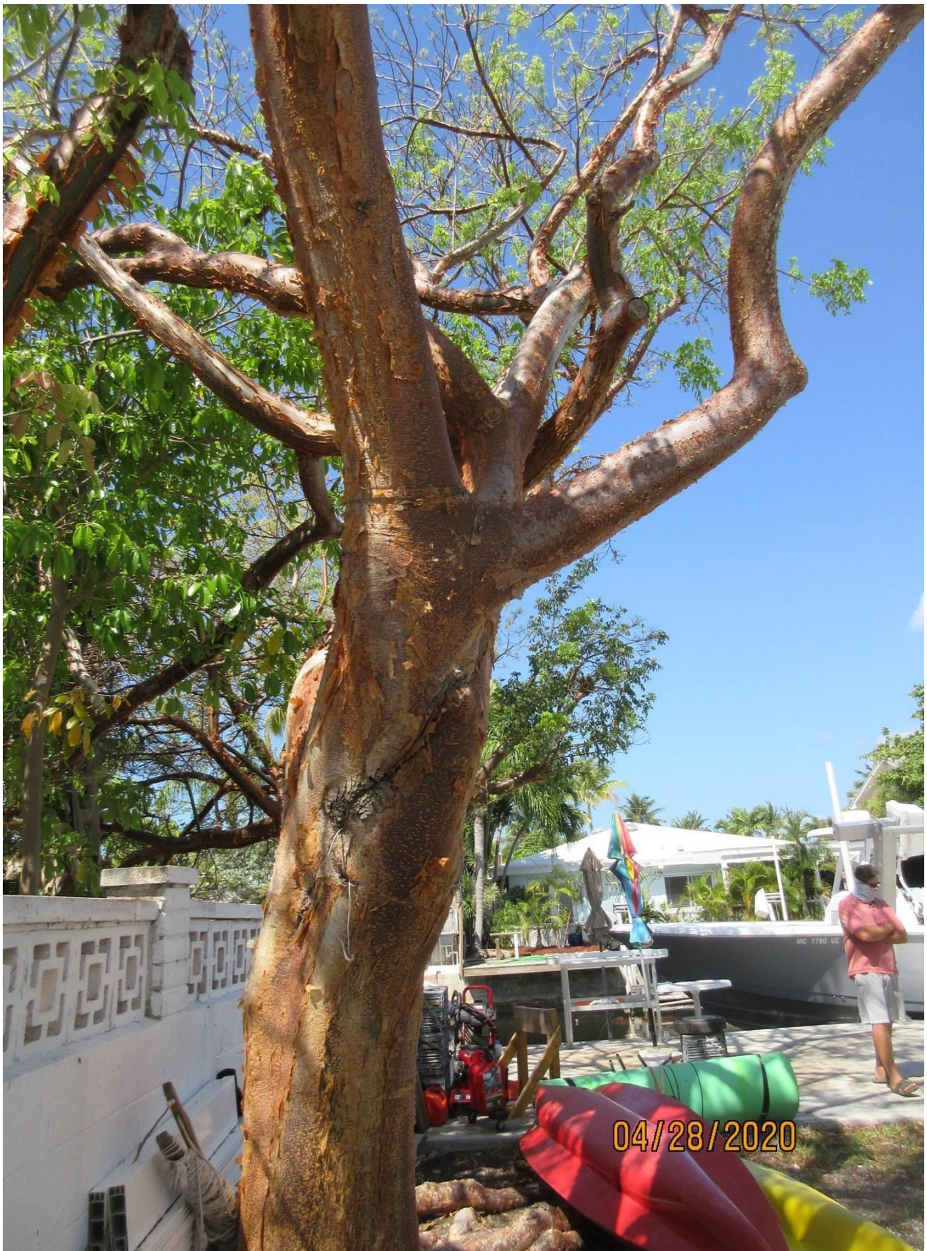
Photo showing crotch of tree, view 2.