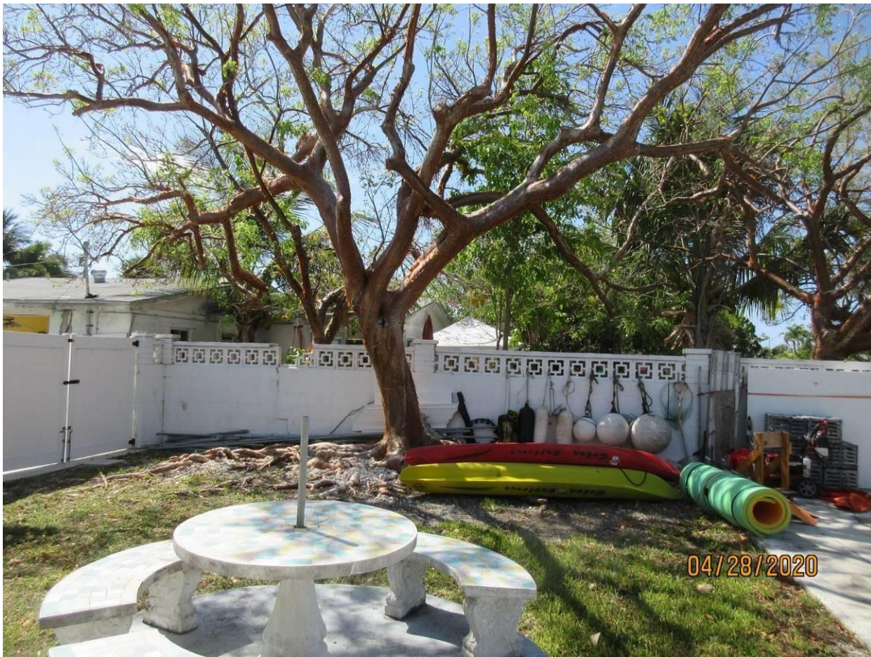
Photo showing whole tree, view 1.