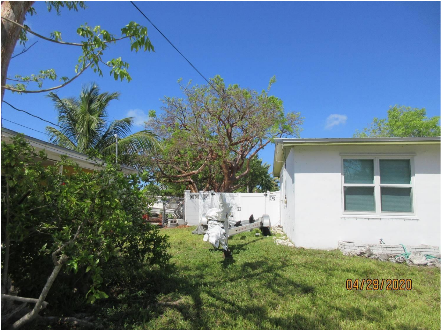
Photo showing location of Gumbo Limbo tree on property.

Tree Species: Gumbo Limbo (Bursera simaruba)