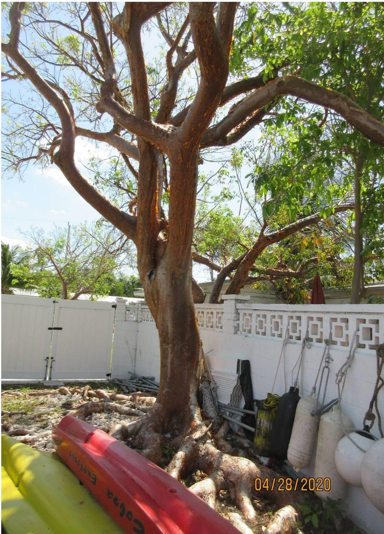
Photo showing whole tree, view 2.