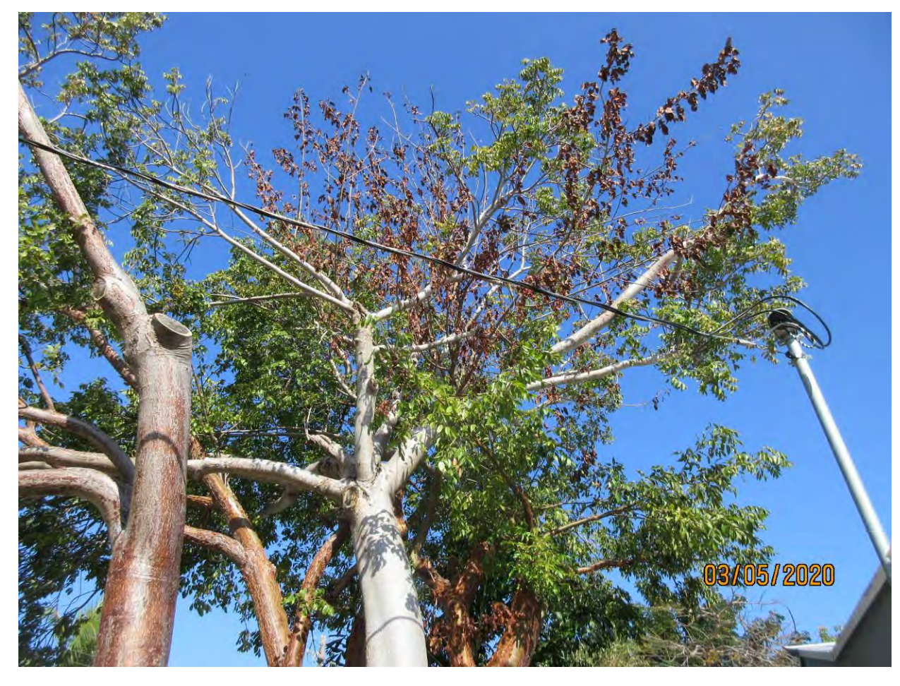
Photo showing canopy of Gumbo limbo tree clump, 3-5-20. Dead branches are from a cut branches that was not fully removed.

Pool equipment installed at base of Gumbo Limbo clump (protective root zone)