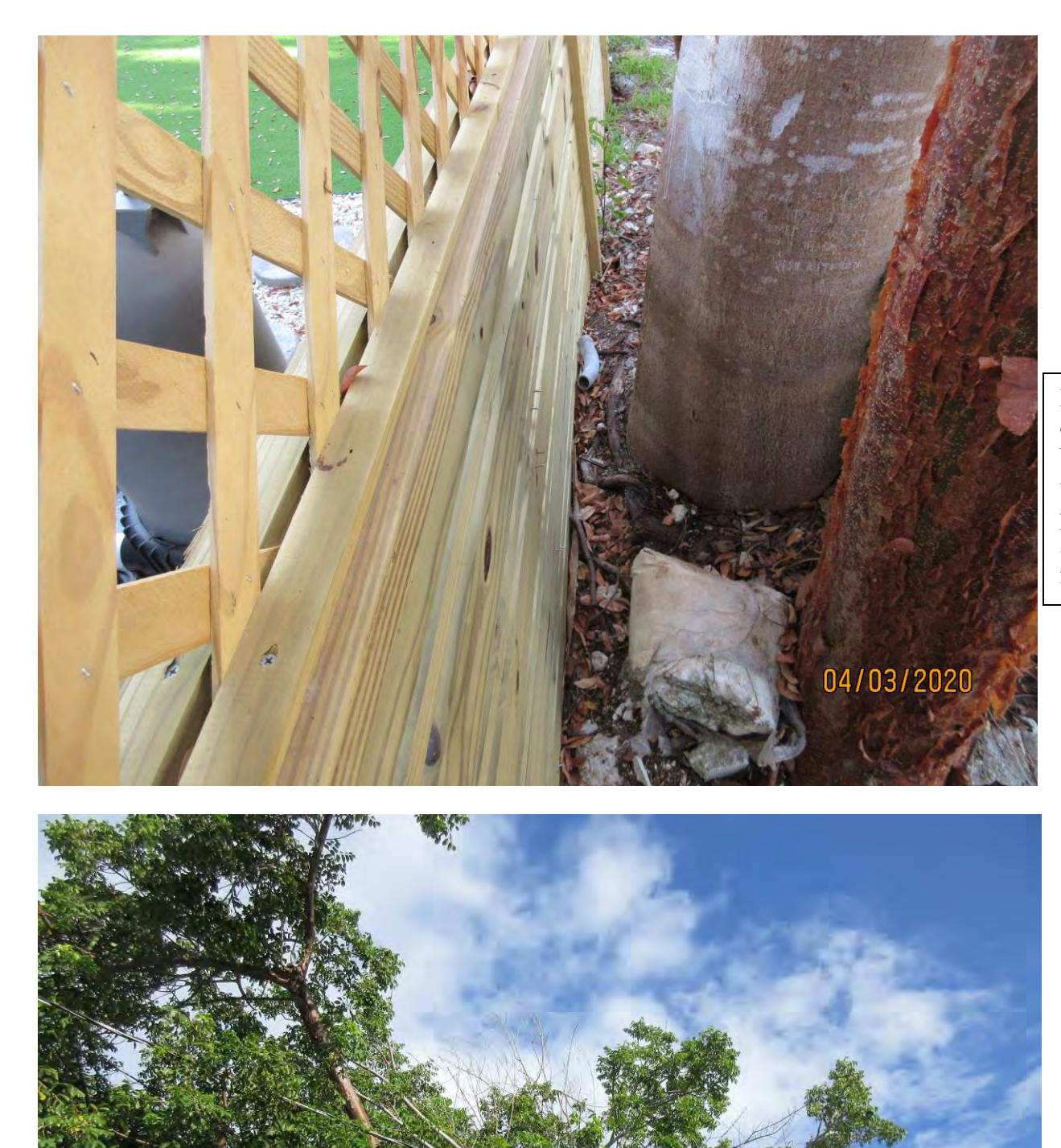
Photo showing distance between base of tree trunks and pool equipment, approximately 3 ft.