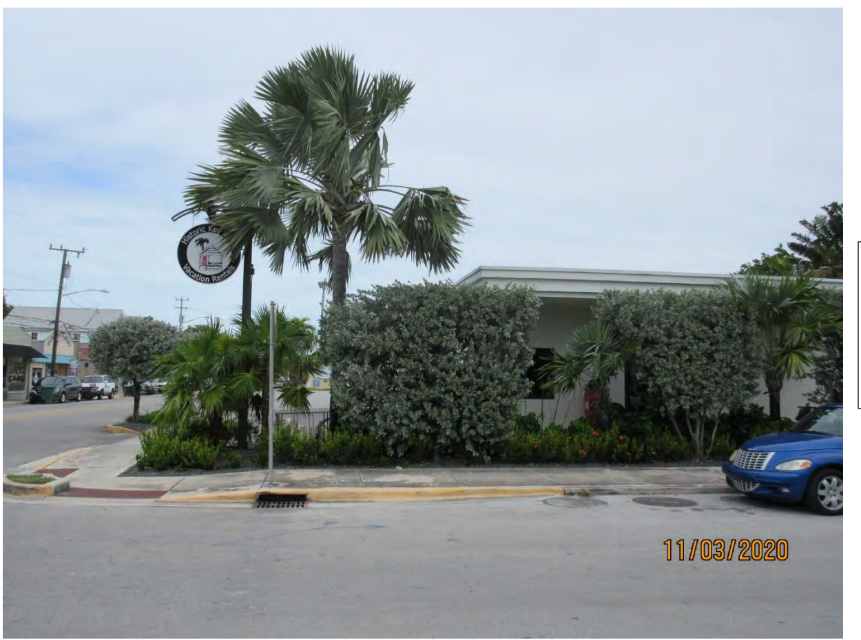
Photo showing the southeastern property line area--along Catherine Street