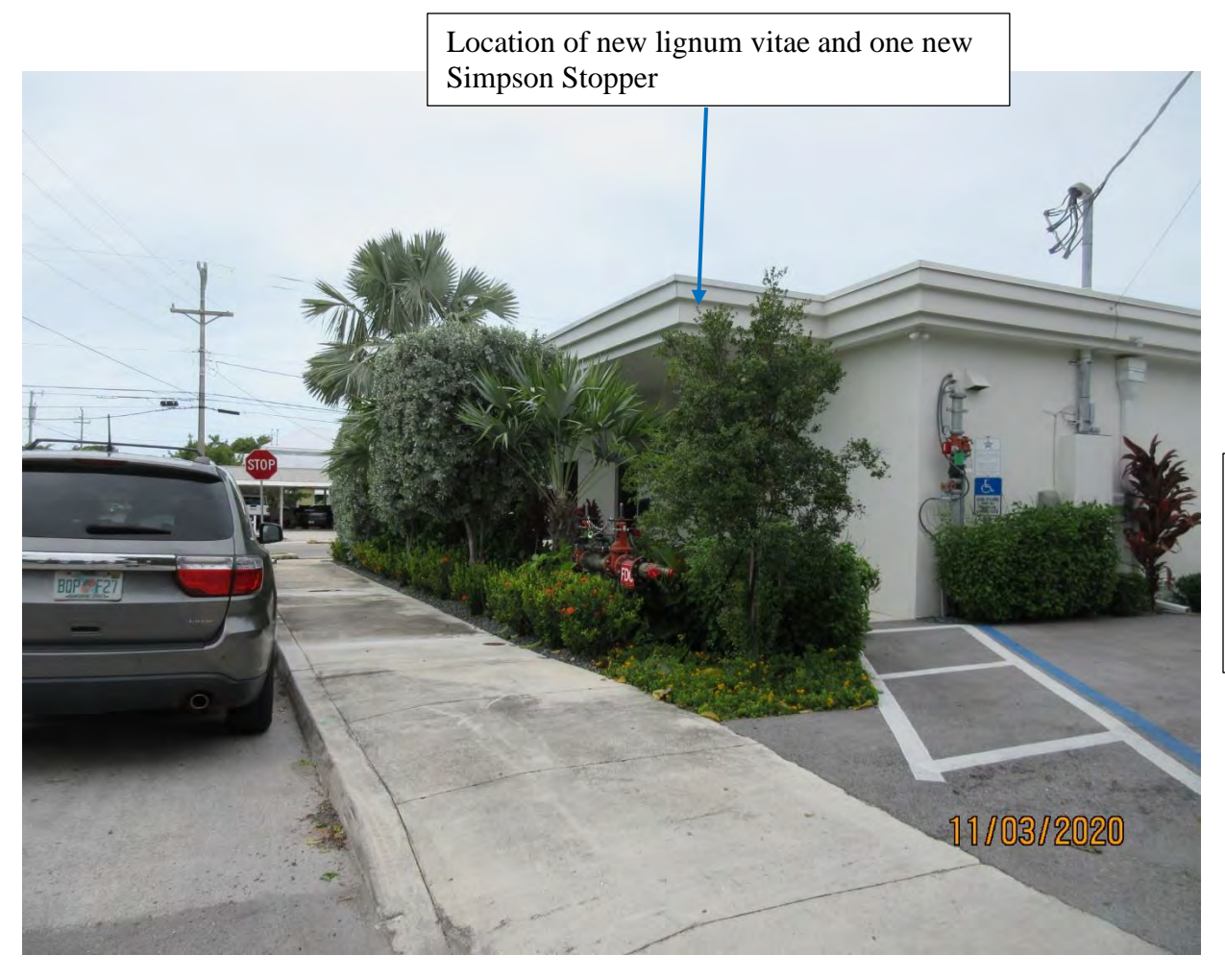
Photo showing the southeastern property line area--along Catherine Street