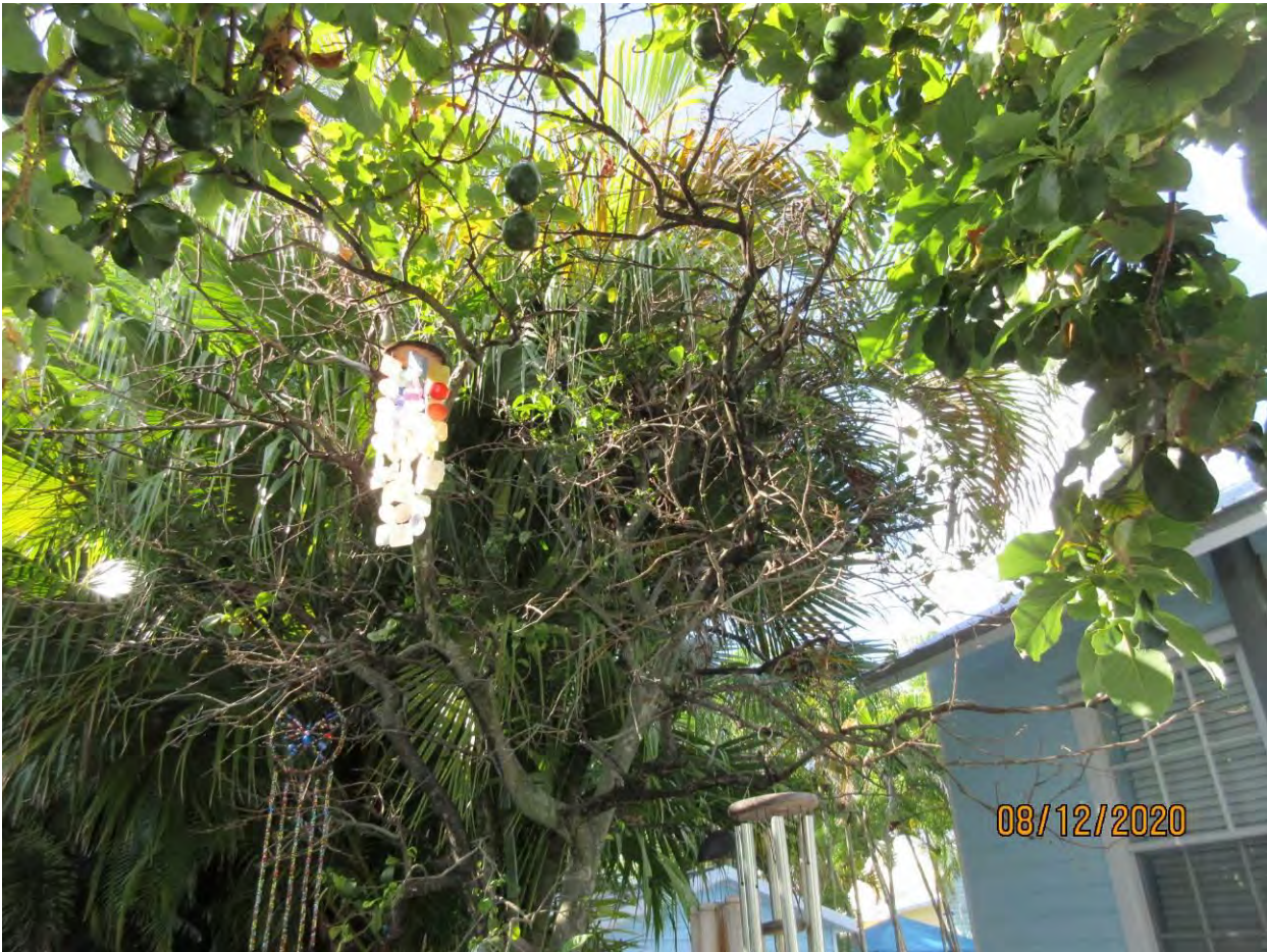
Photo of tree canopy, view 4.