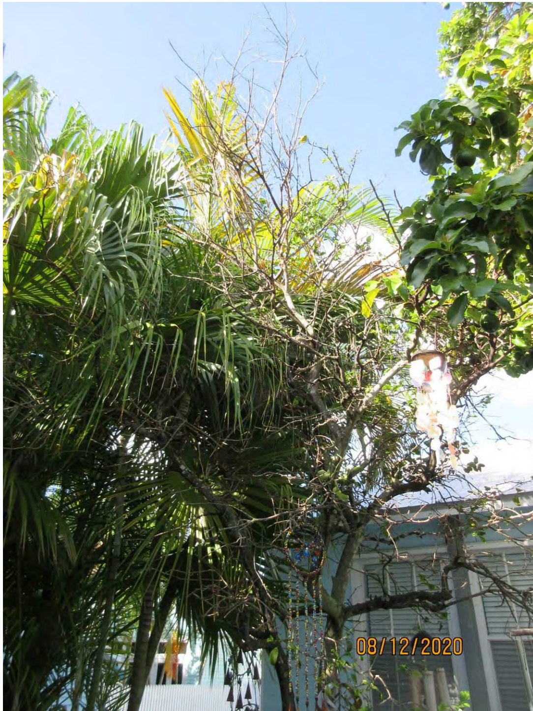
Photo of tree canopy, view 5.