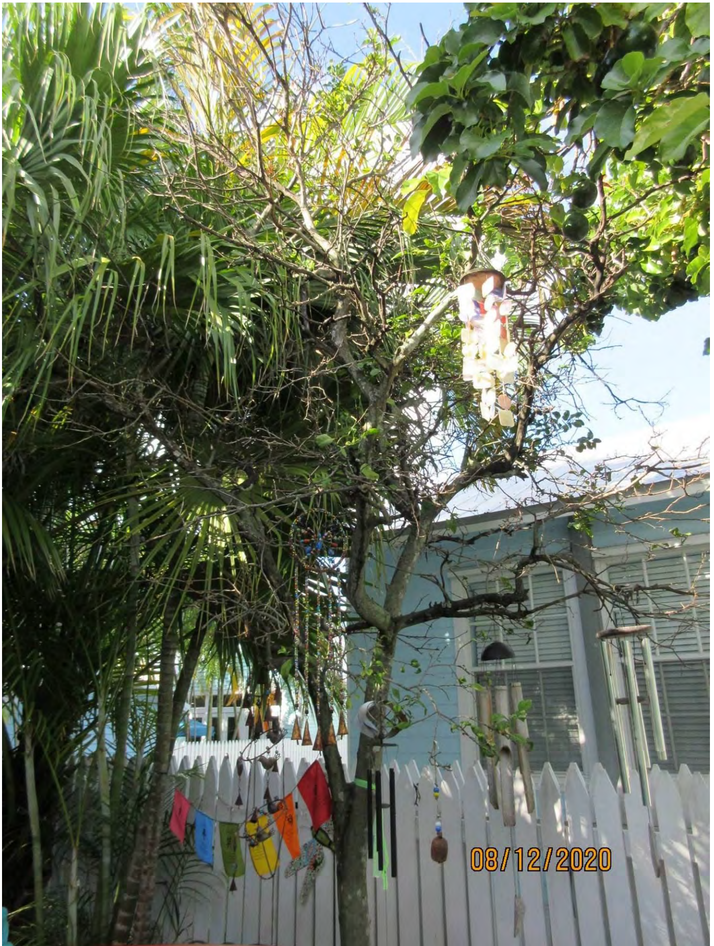
Photo showing canopy of tree, view 1.