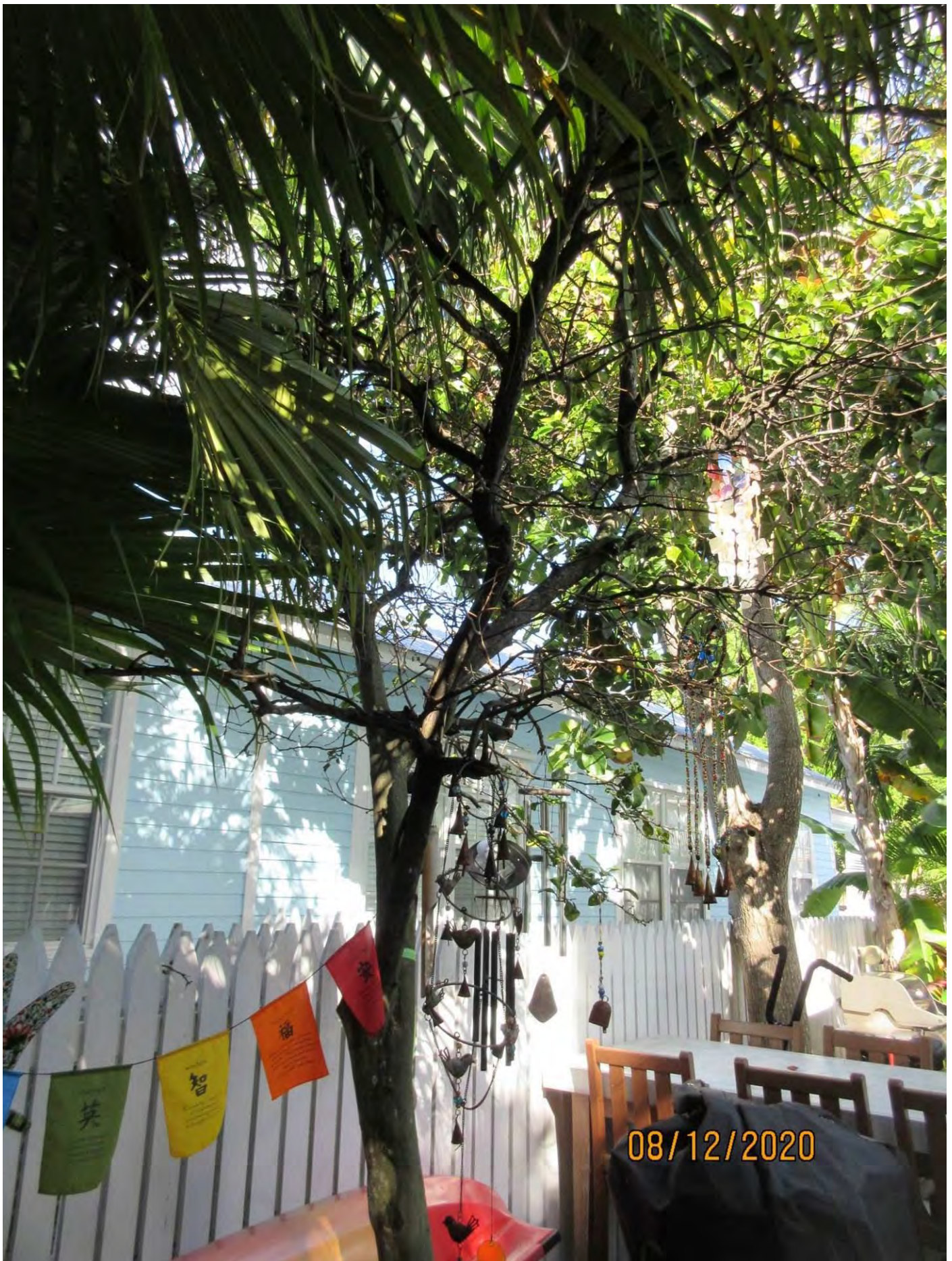
Photo of tree trunk and canopy, view 2.