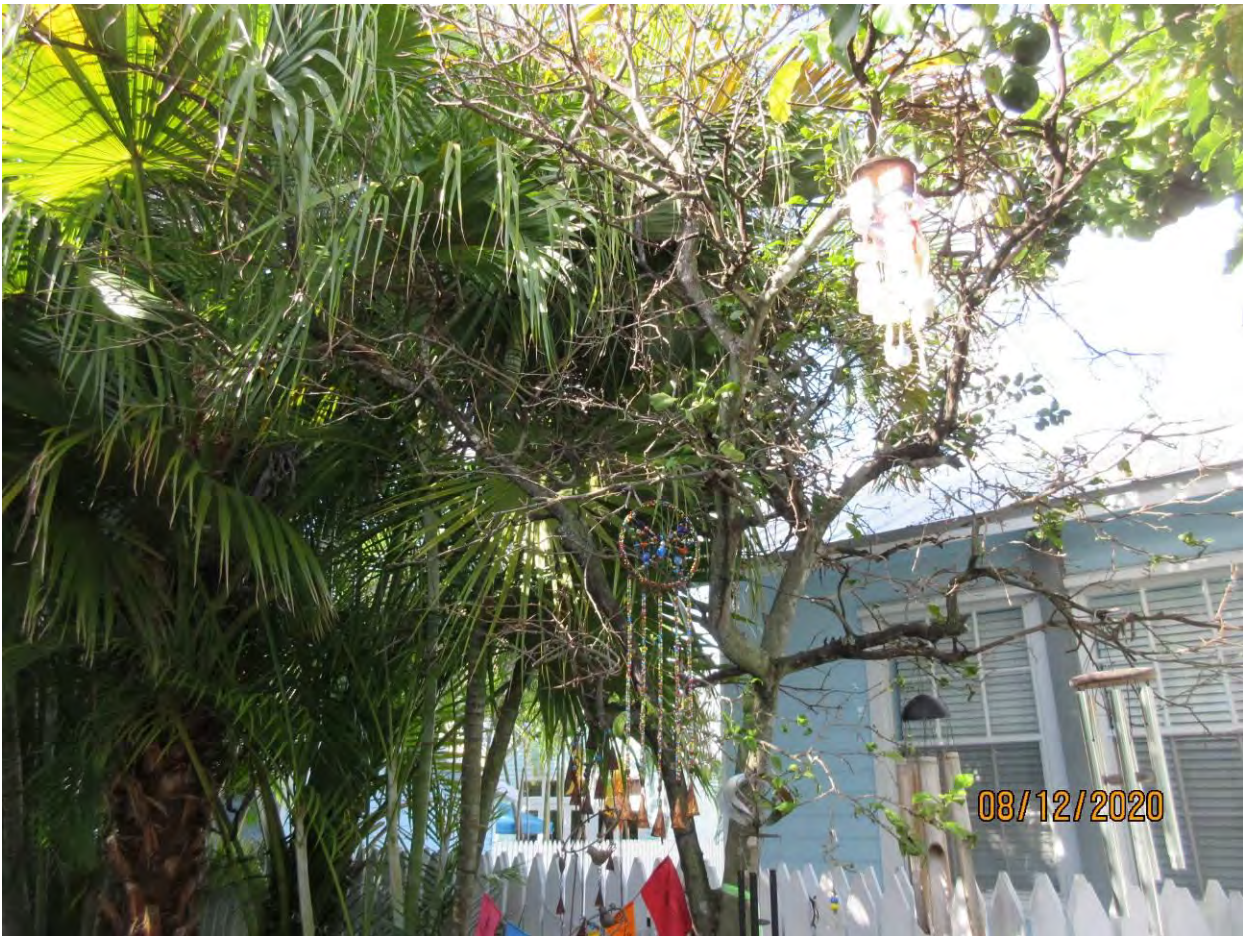
Photo of tree canopy, view 3.