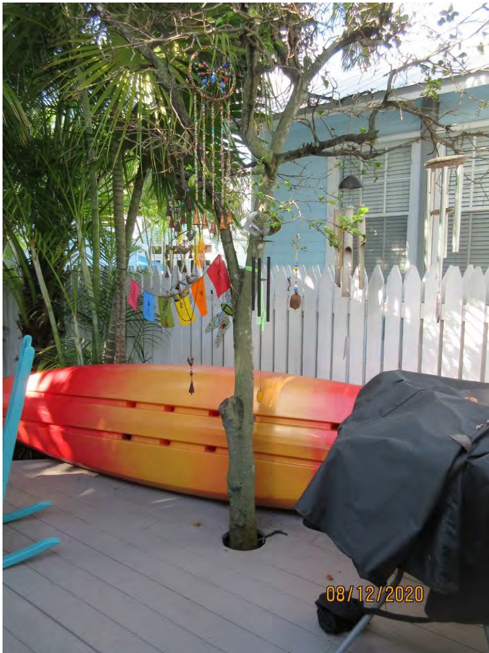
Photo showing location of tree.

Tree Species: Sour Orange ( Citrus aurantium )