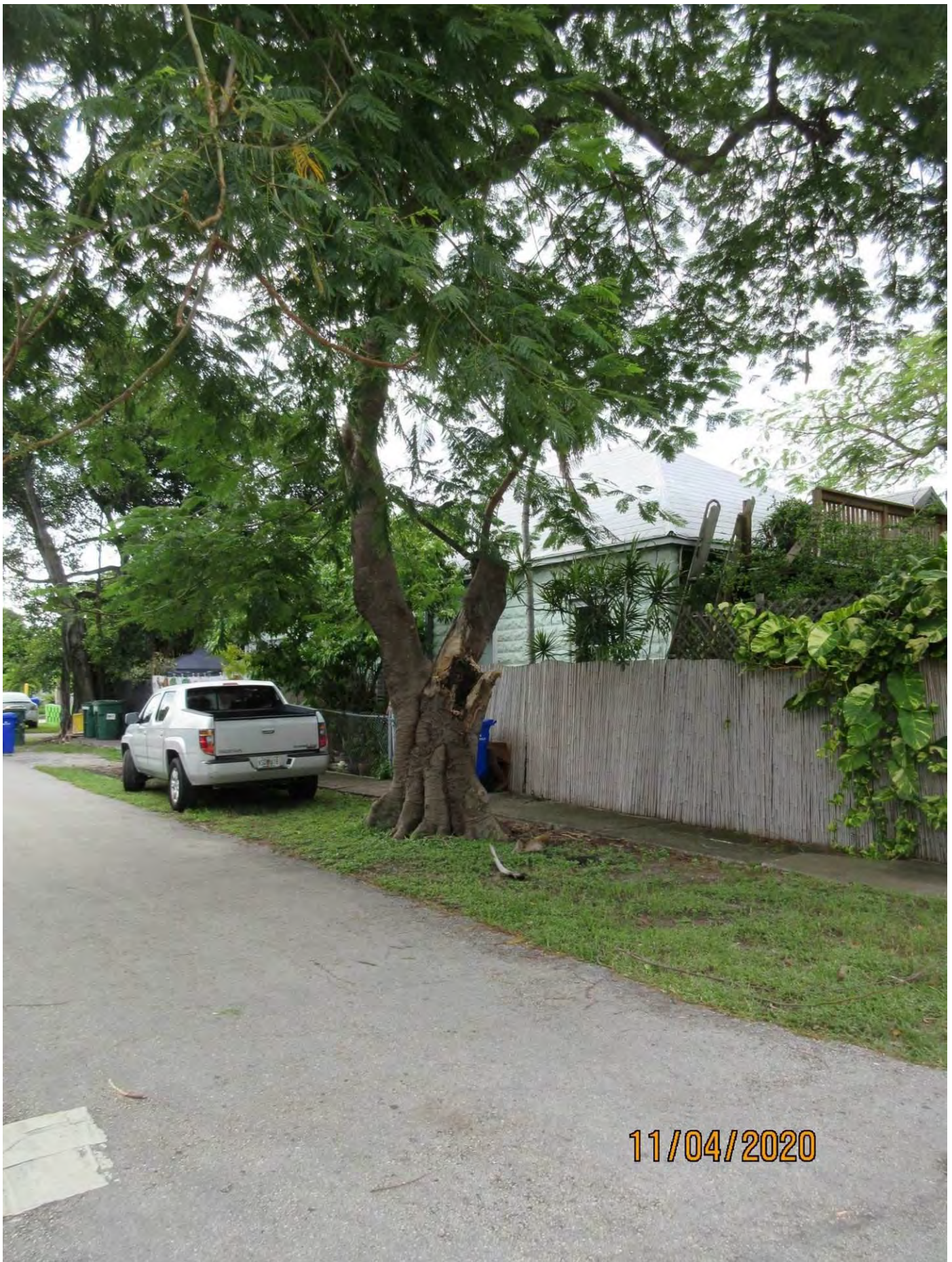
Photo showing whole tree, view 1.