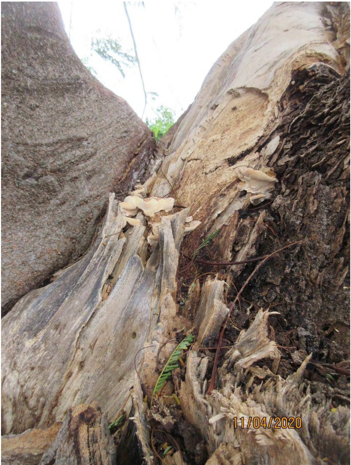
Close up photo of break area, view 2, note conks and bark crack on remaing trunk with canopy