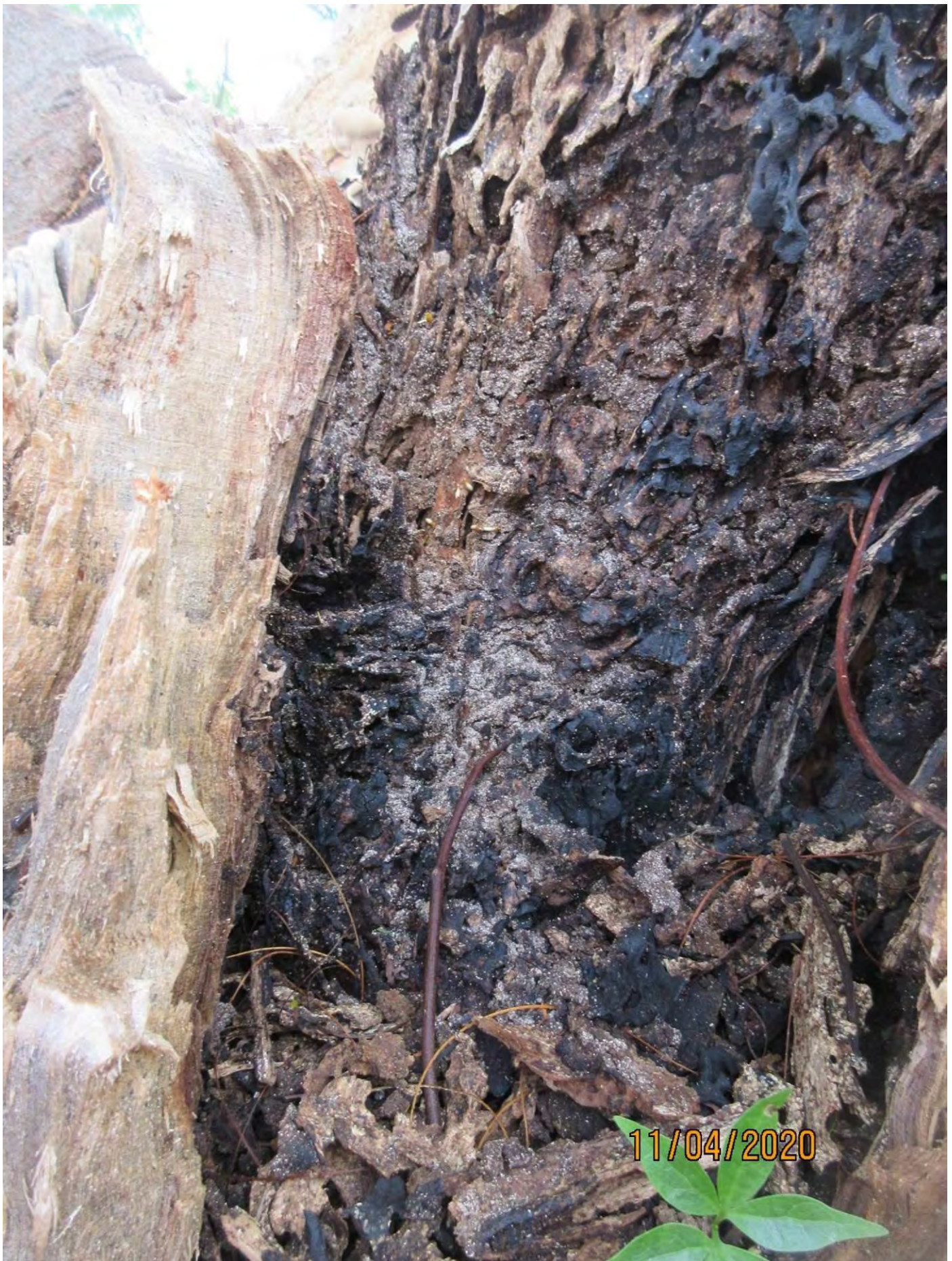
Close up photos of break area, view 1, note termite frass and decay in heartwood.