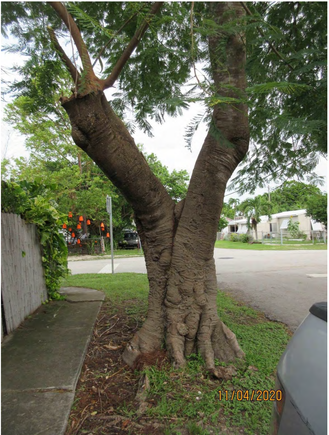
Photo of base and trunk of tree, view 1.