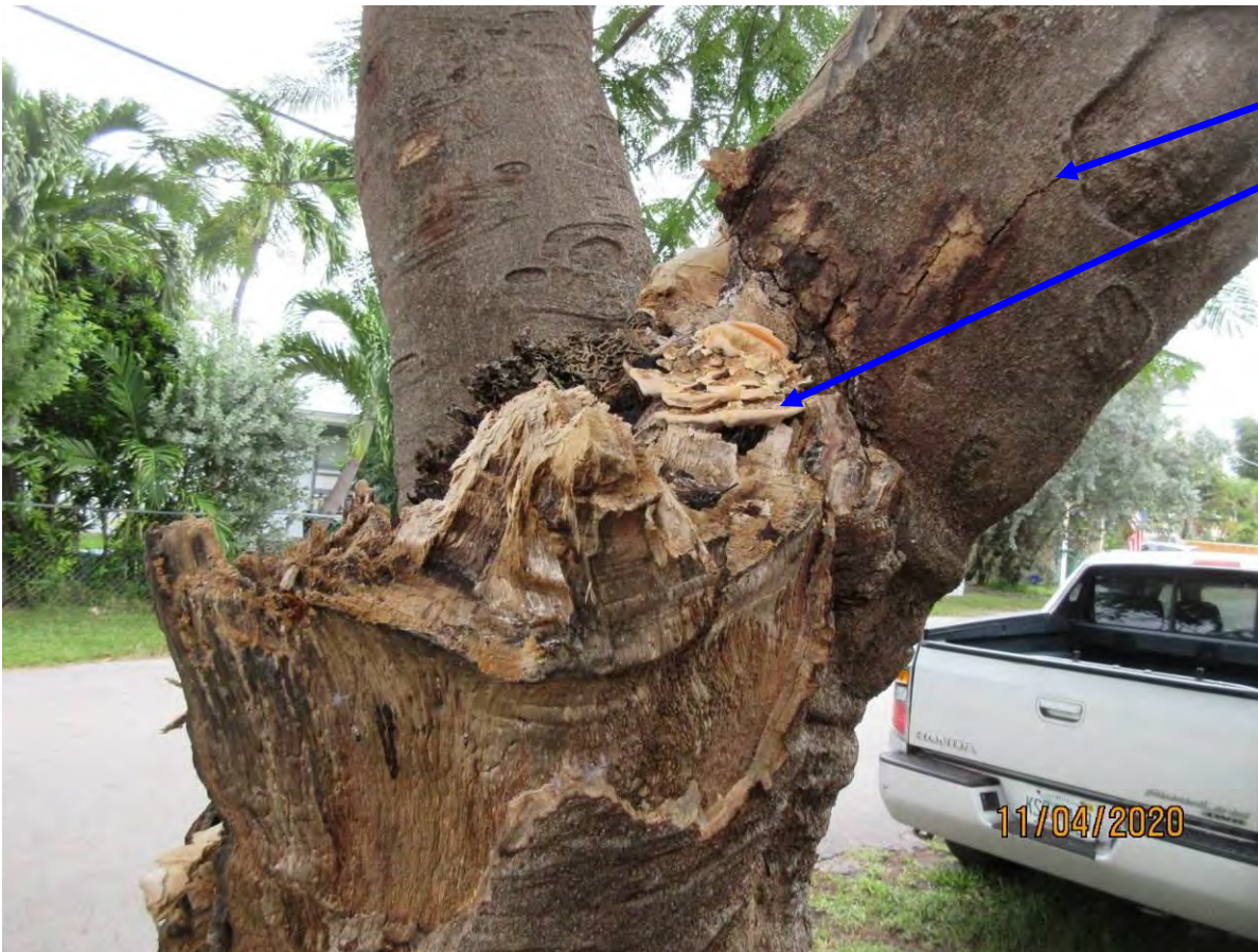
Conks and bark cracks in trunk with old canopy cut