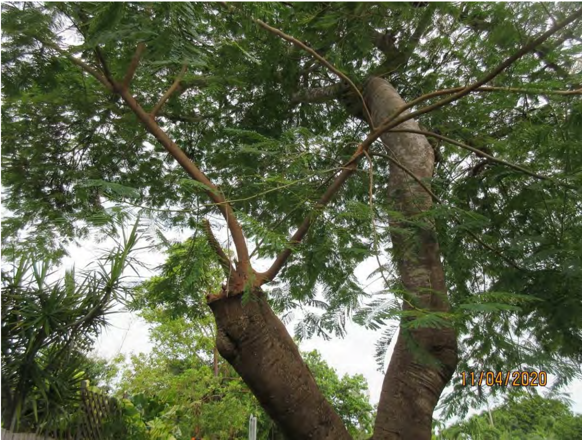
Photo of tree canopy, view 1.