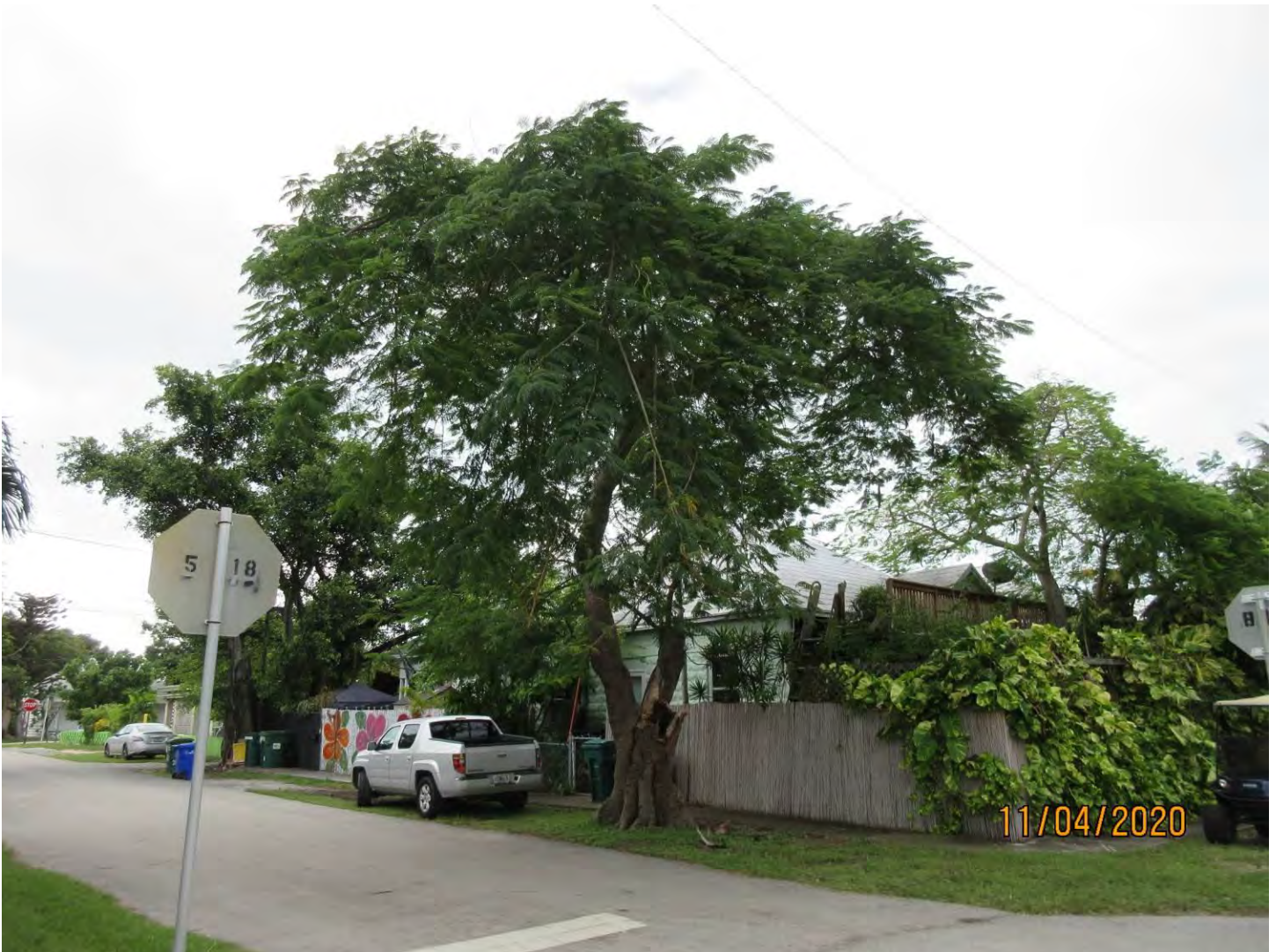
Photo showing location of tree on City right of way.

Tree Species: Royal Poinciana ( Delonix regia )