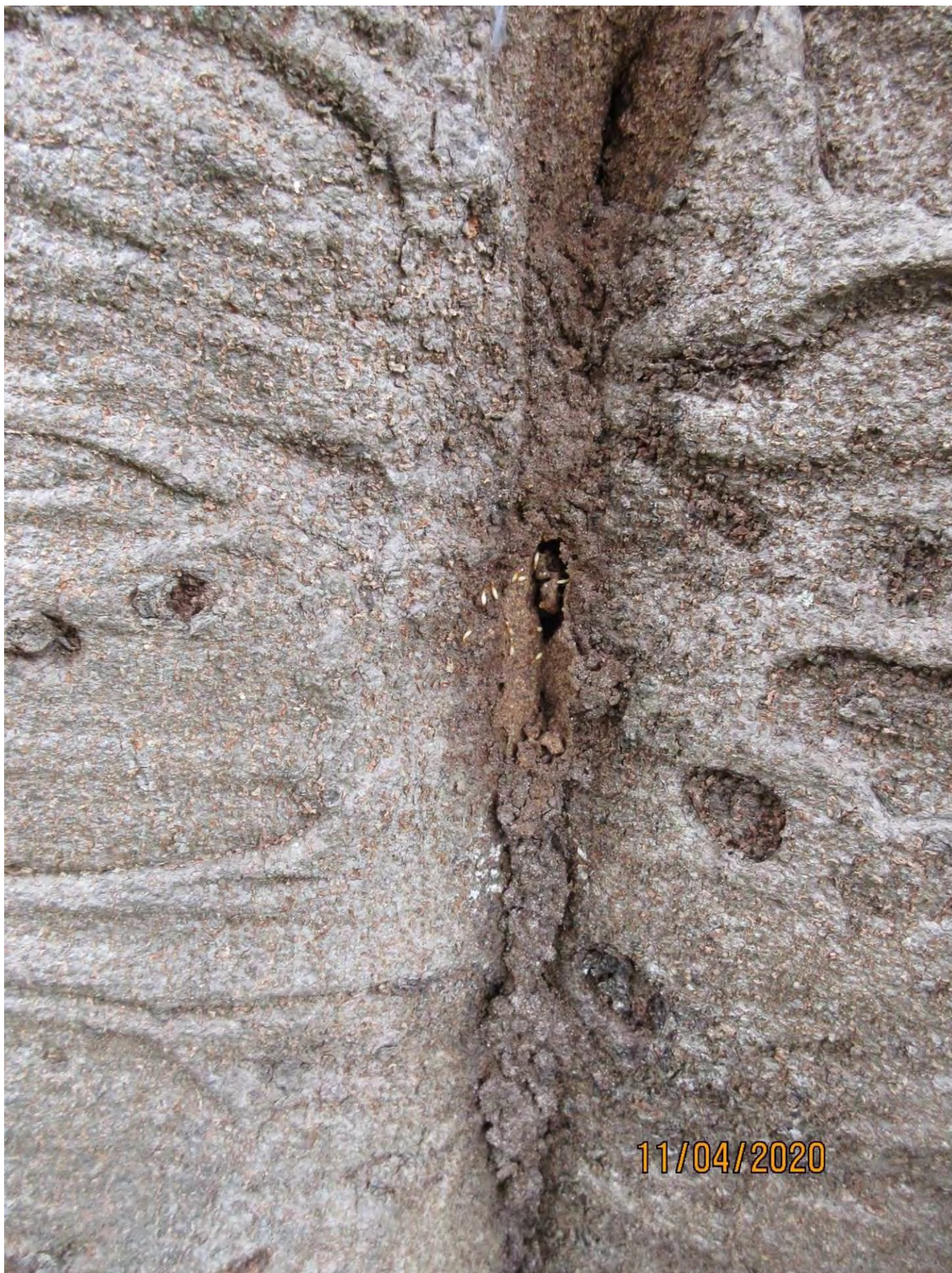
Mud trail and active termites in main trunk area.