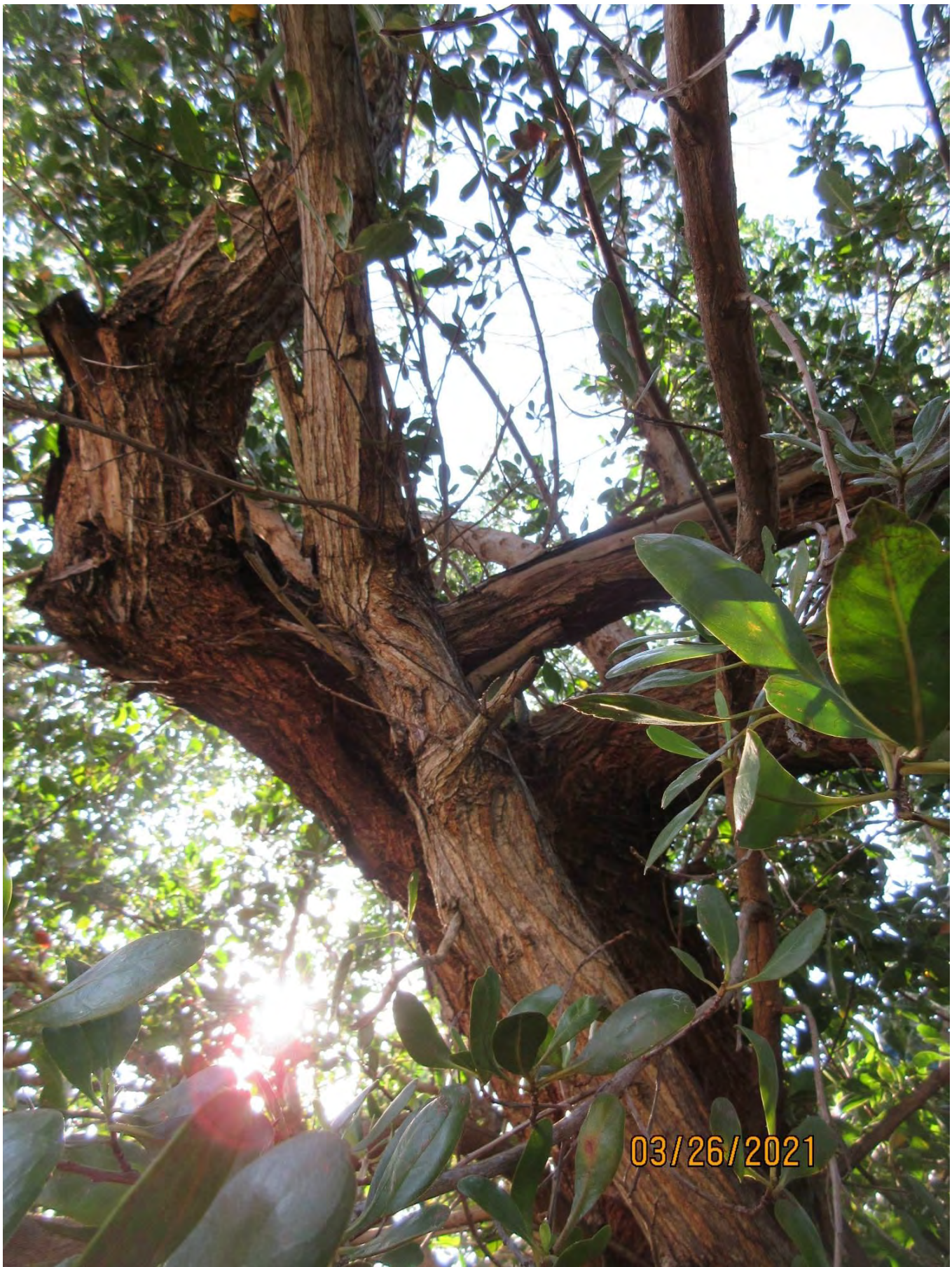
Photo showing canopy of tree, view 1.