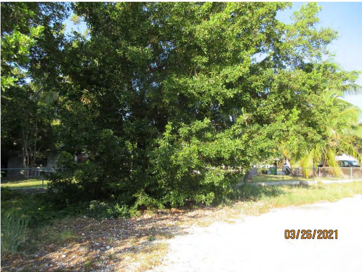
Photo of tree trunk, view 1.