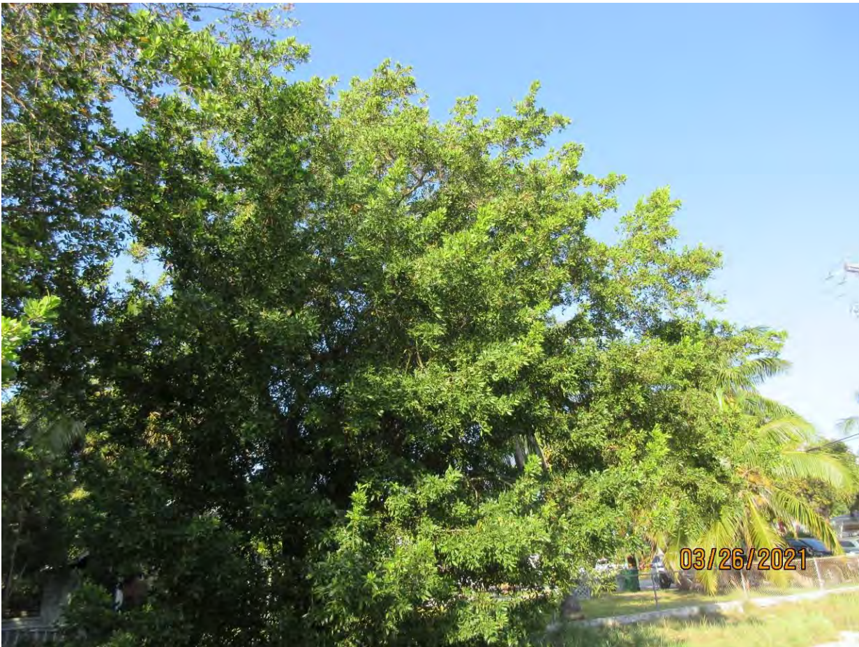
Photo of tree canopy, view 1.