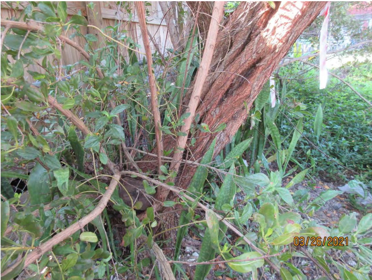
Two photos showing tree trunk and base of tree, view 2 and 3.