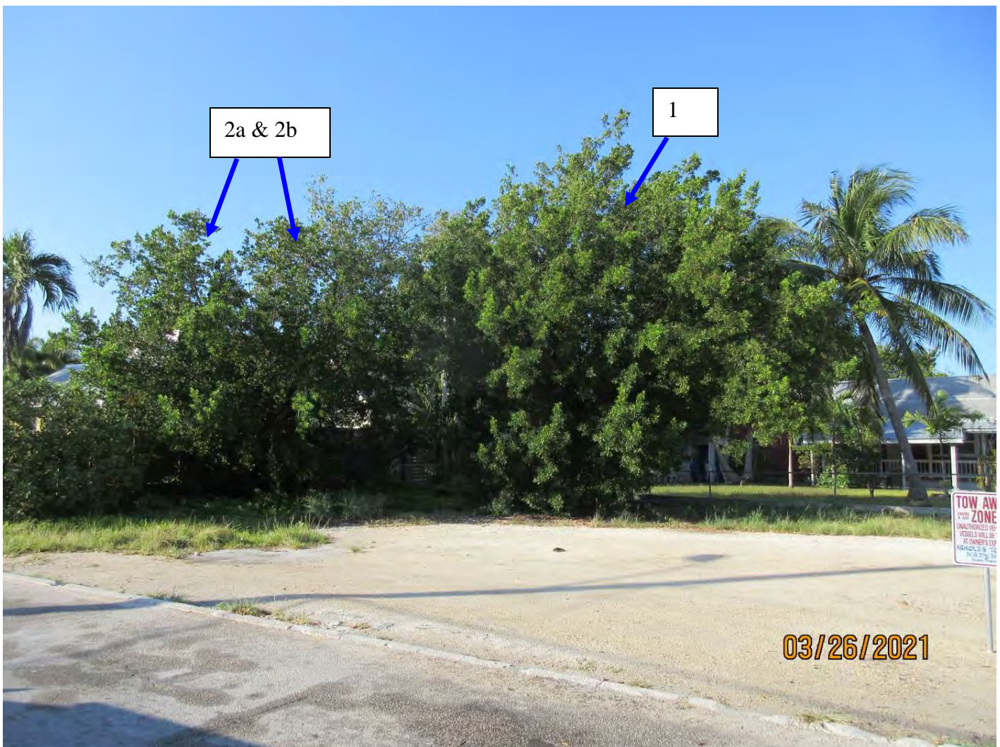
Photo showing locations of tree on the lot.

Tree Species: Green Buttonwood ( Conocarpus erectus )