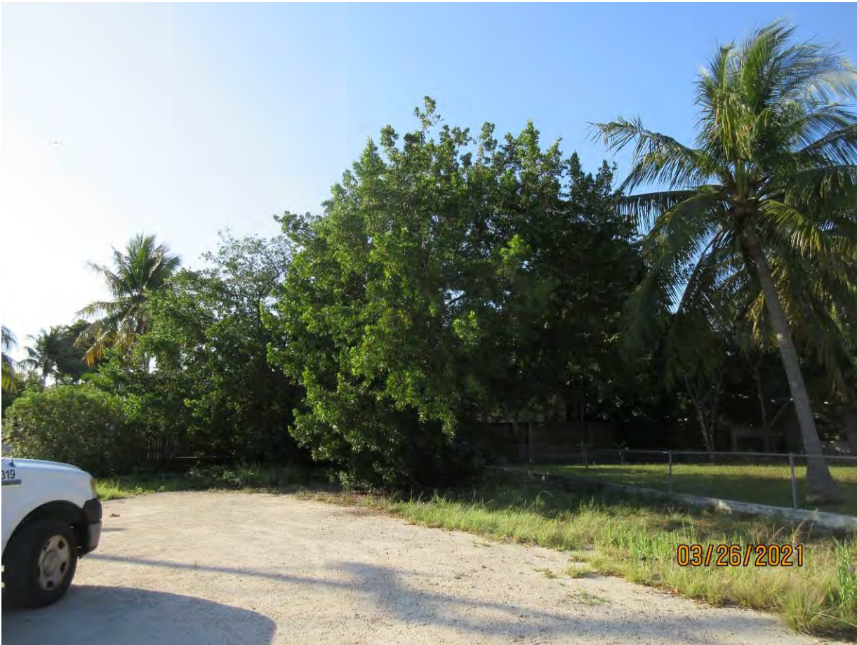
Photo of whole tree, view 2.