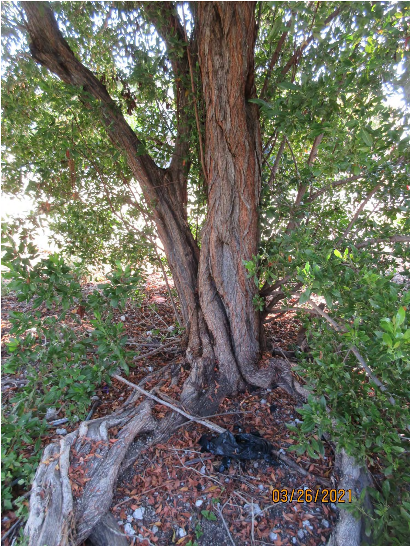
Photo of tree trunk and base of tree, view 1.