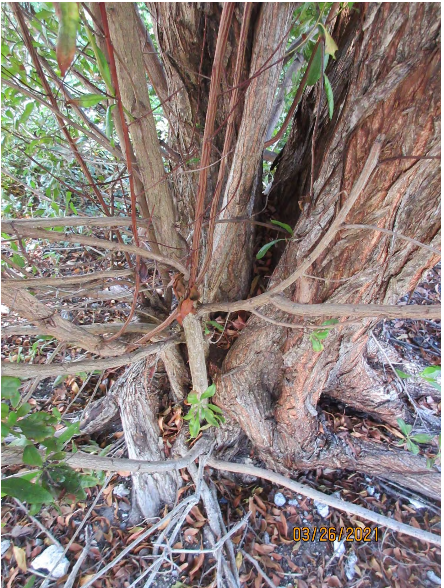
Photo of tree trunks and base of tree, view 2.