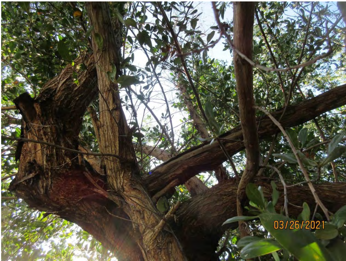
Photo showing tree canopy, view 2.