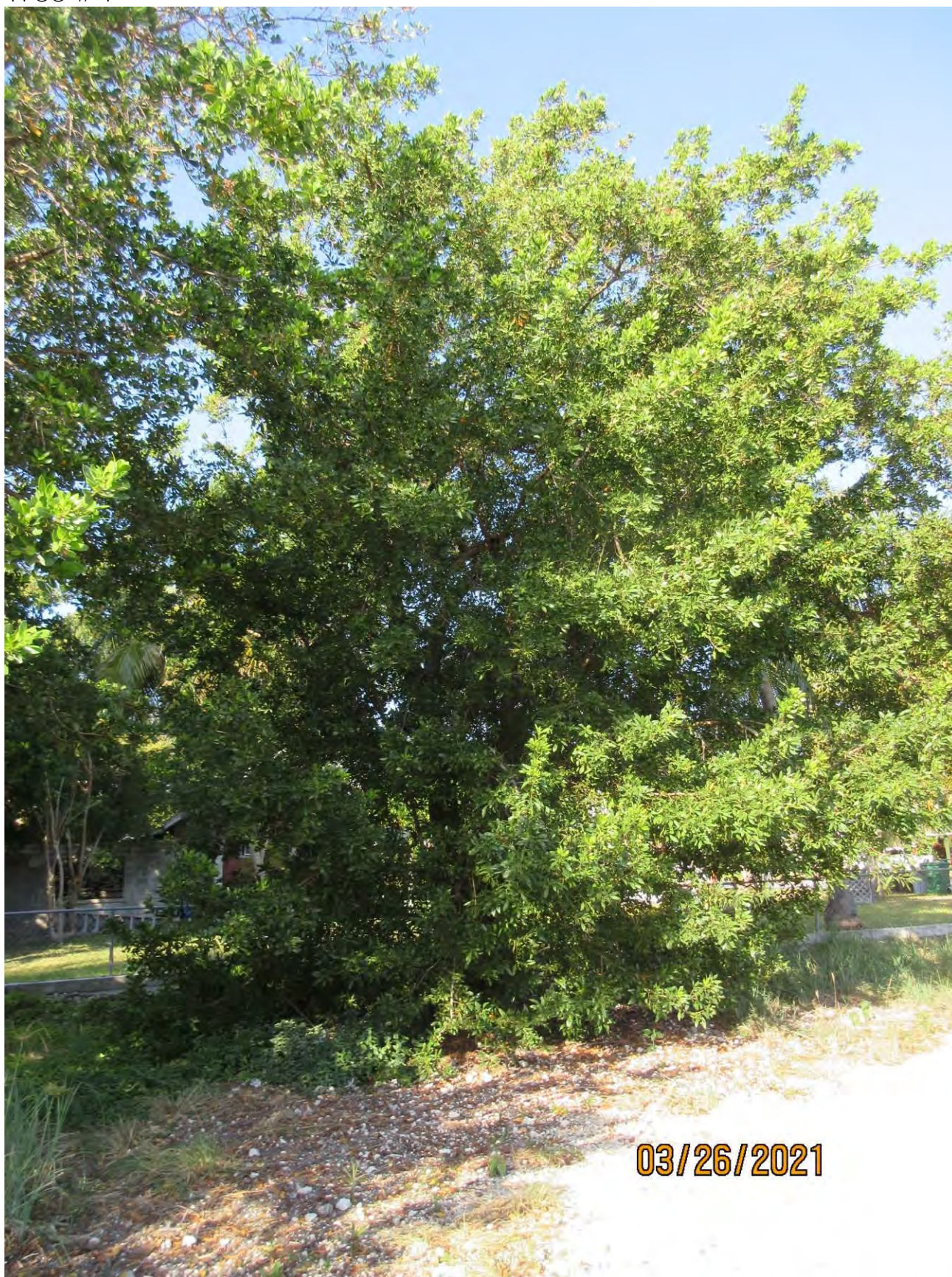
Photo of whole tree, view 1.