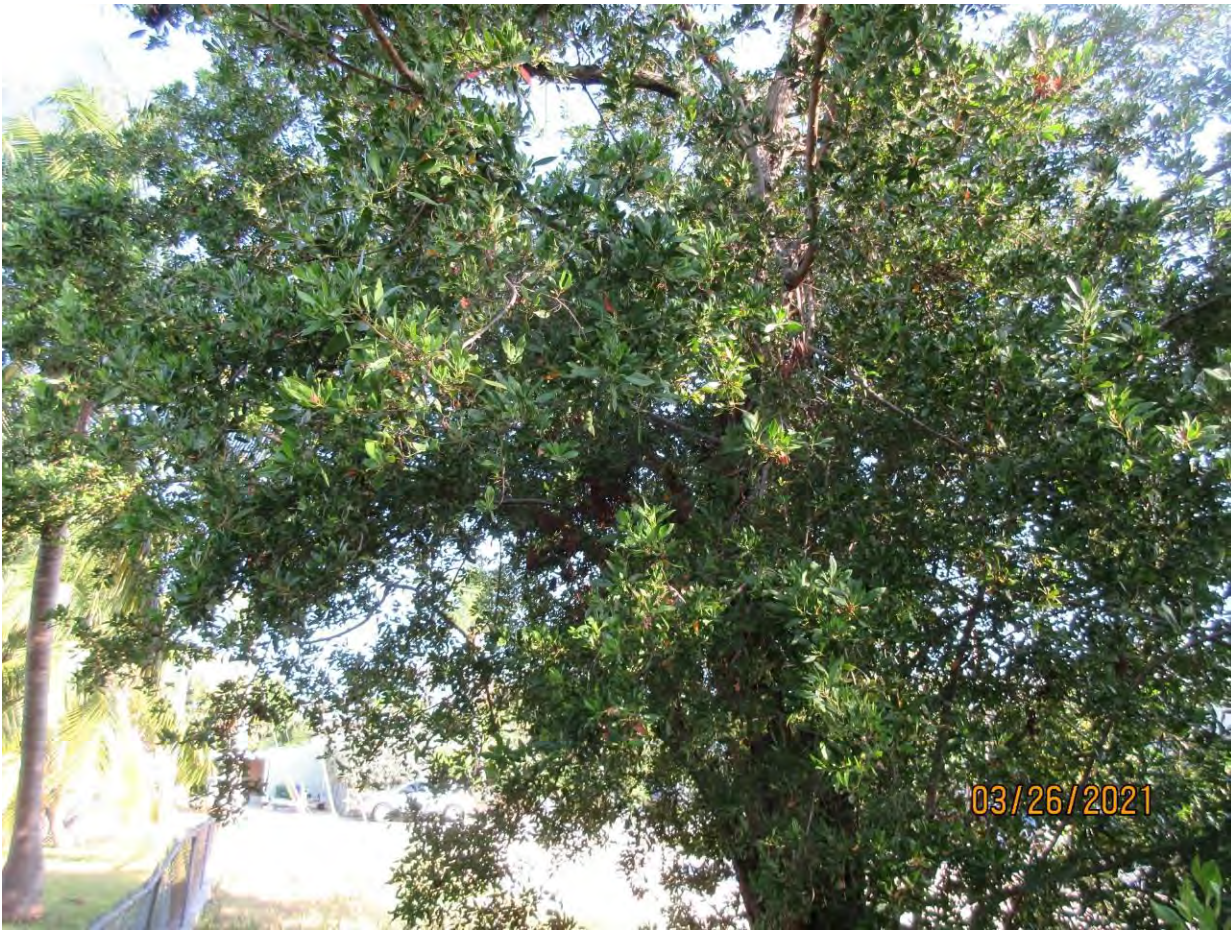
Photo of tree canopy, view 2.