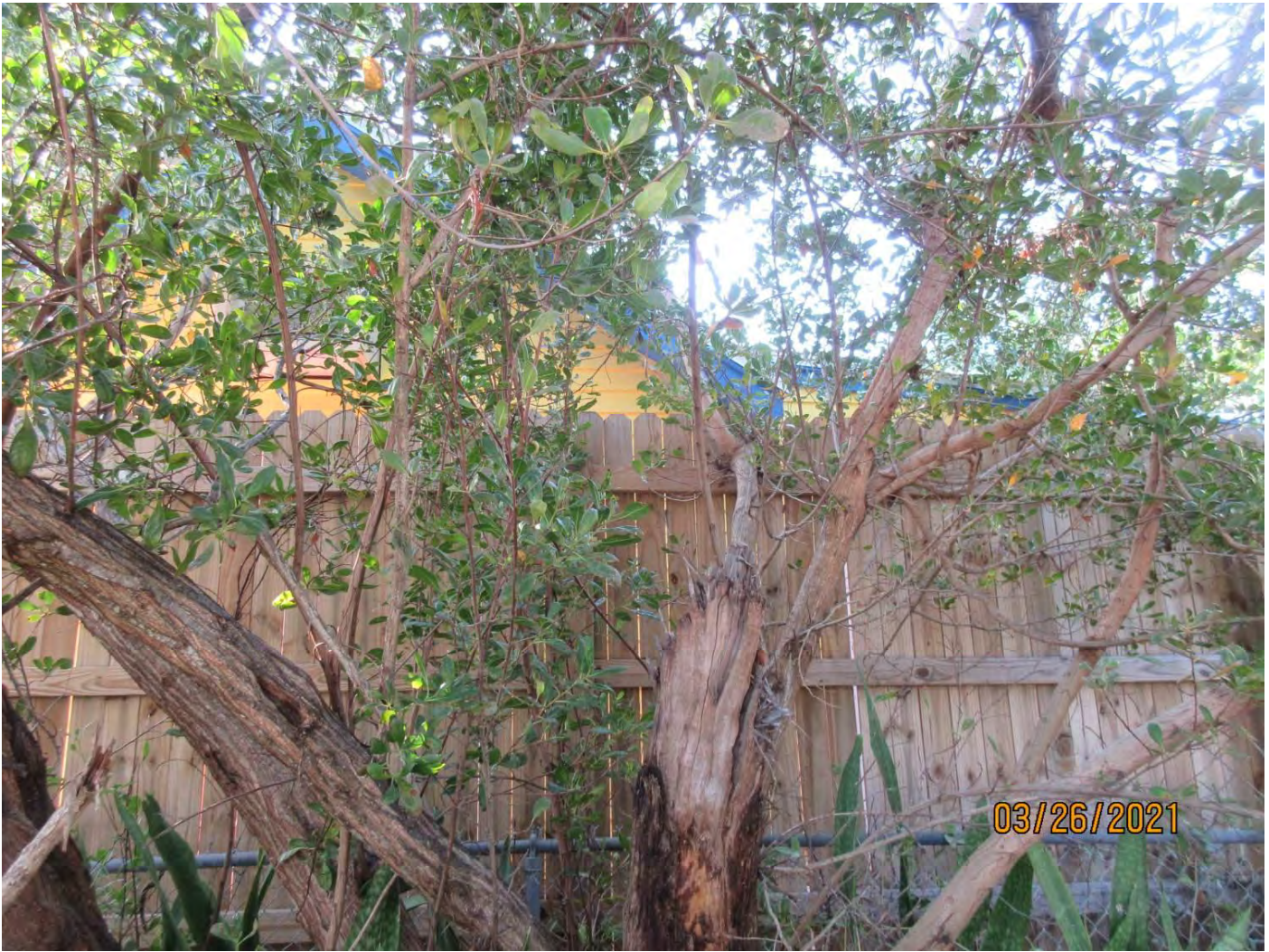
Photo showing trunks and canopy.