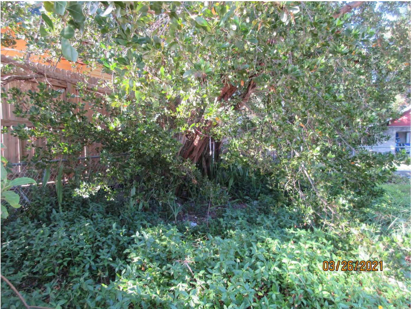
Photo showing whole tree area.