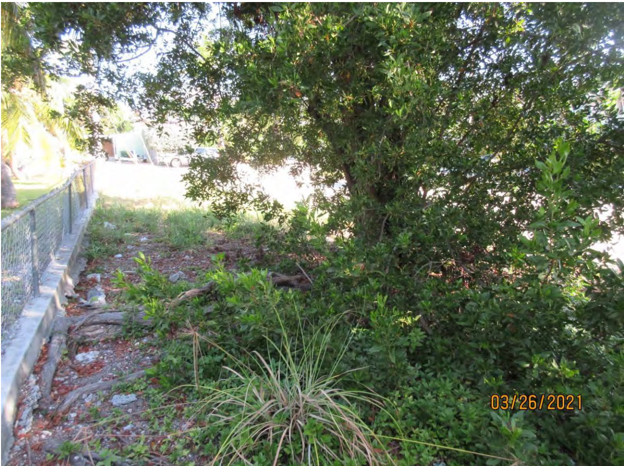
Photo of tree trunk, view 2.