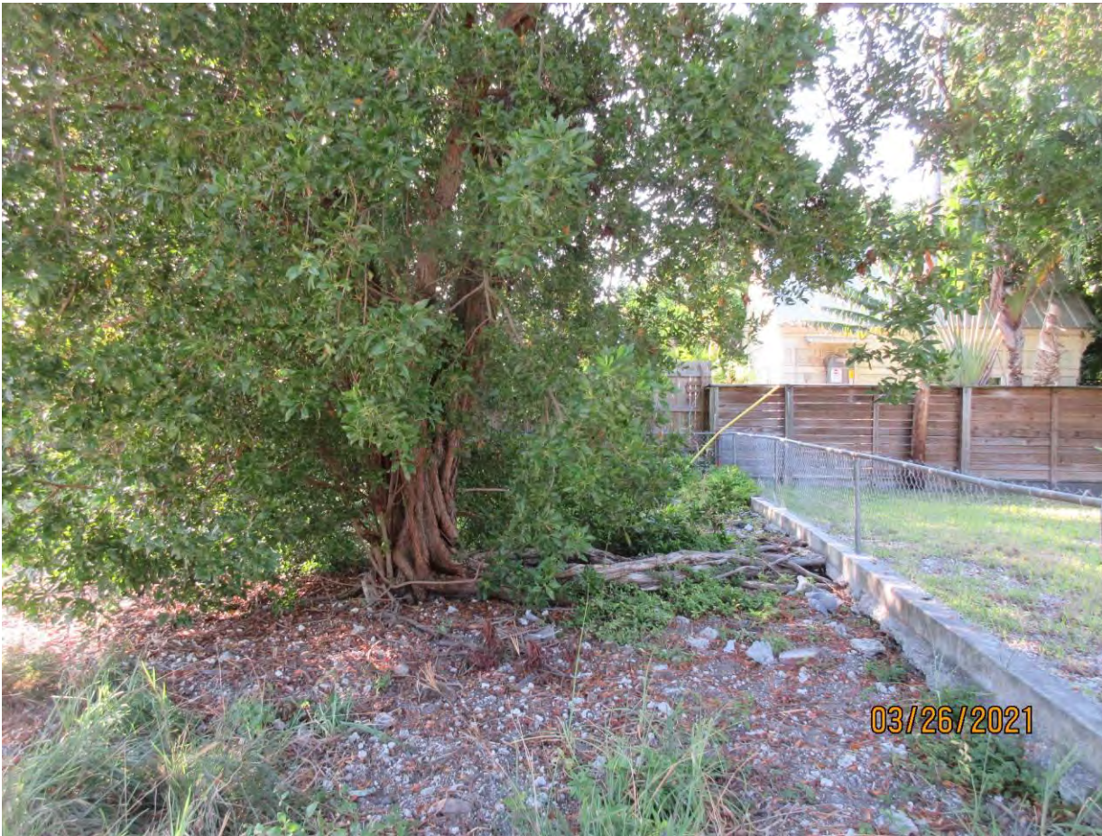
Photo of tree trunks and base of tree, view 3.