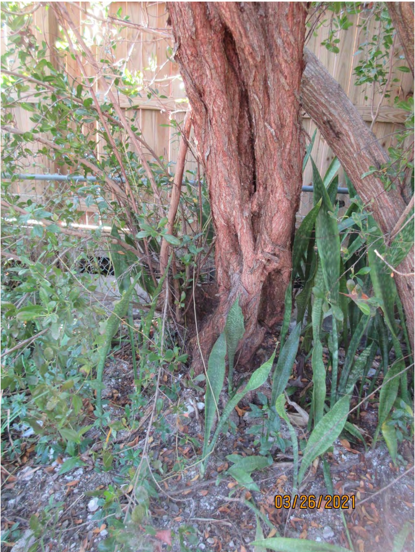
Photo showing trunk and base of tree, view 1.