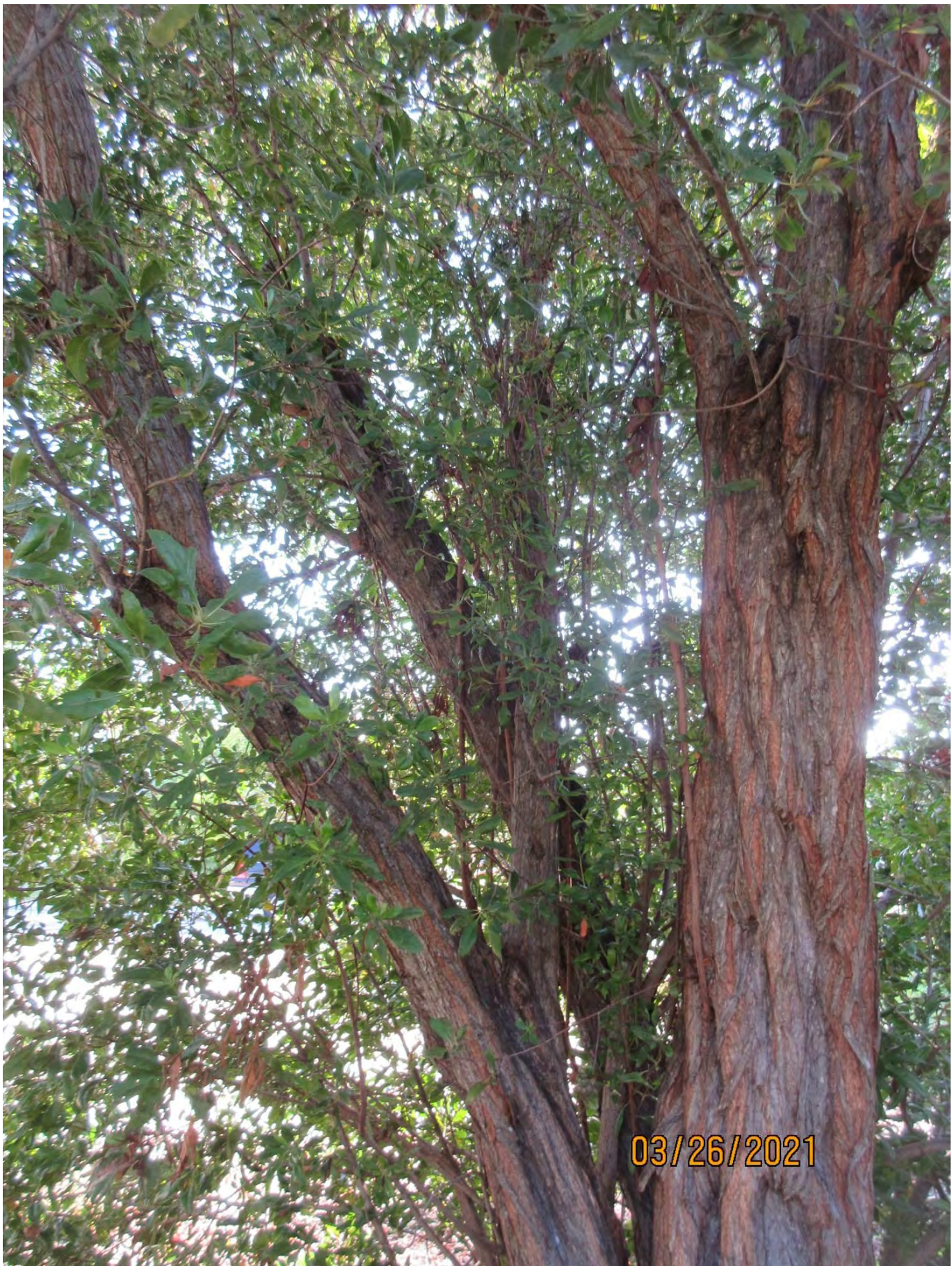
Photo of tree trunks, view 3.