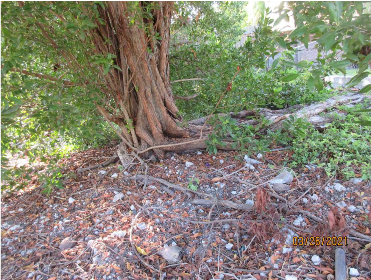
Photo of base of tree showing surface roots.