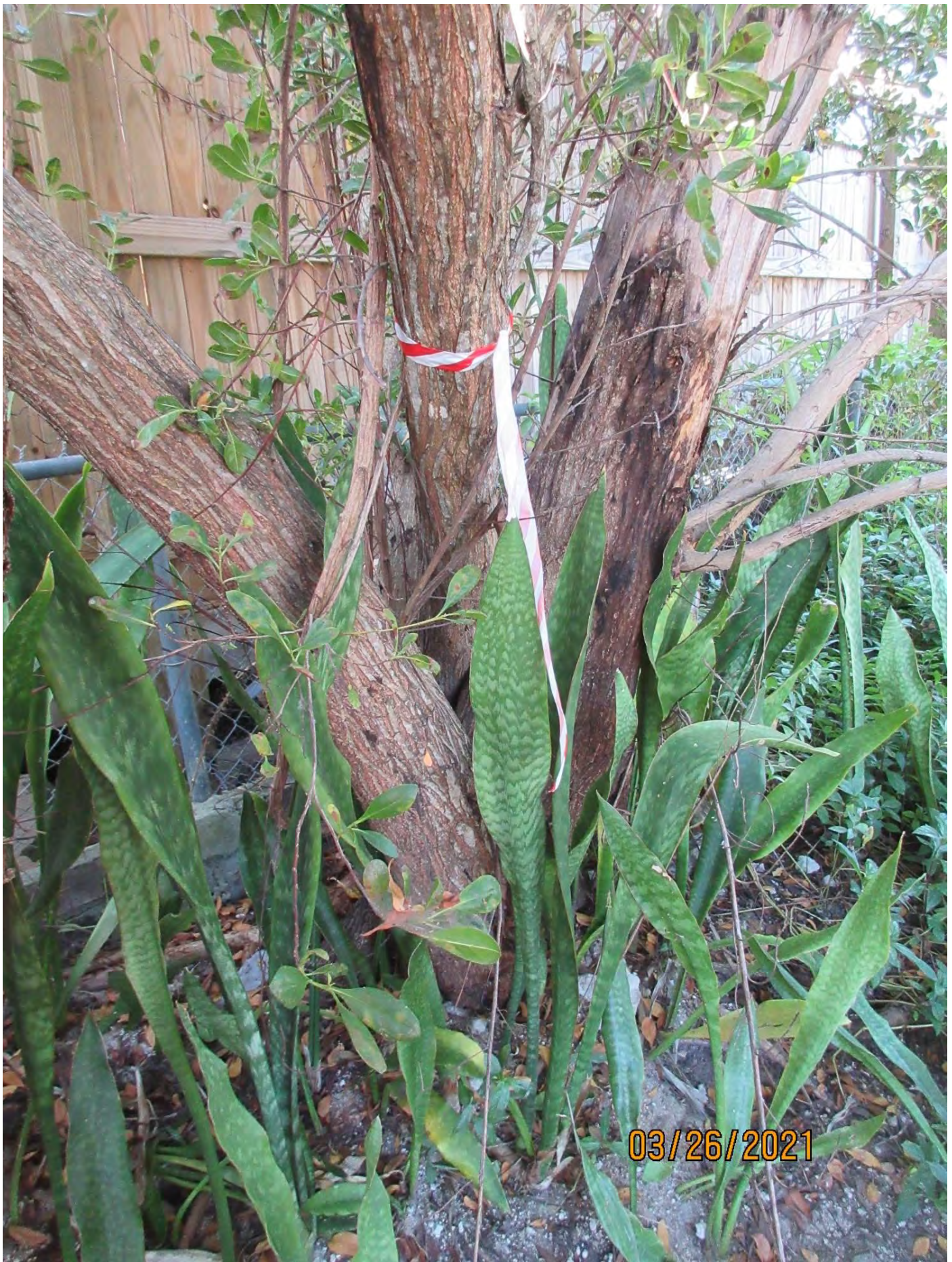
Photo showing main trunks of tree, view 2.