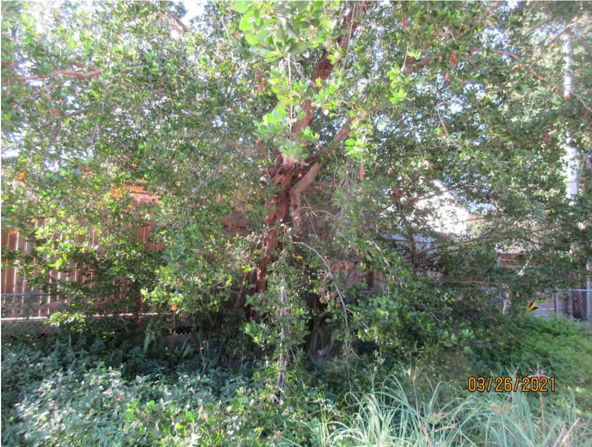
Photo showing whole tree area, view 1.