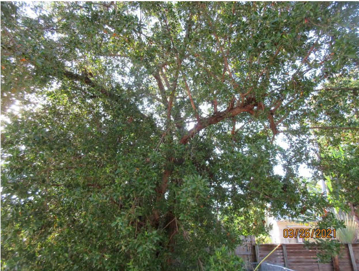
Photo of tree canopy, view 3.