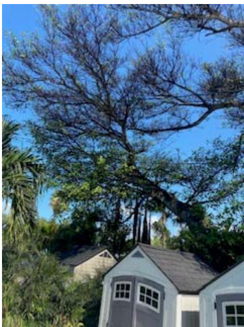
Sent from my iPhone